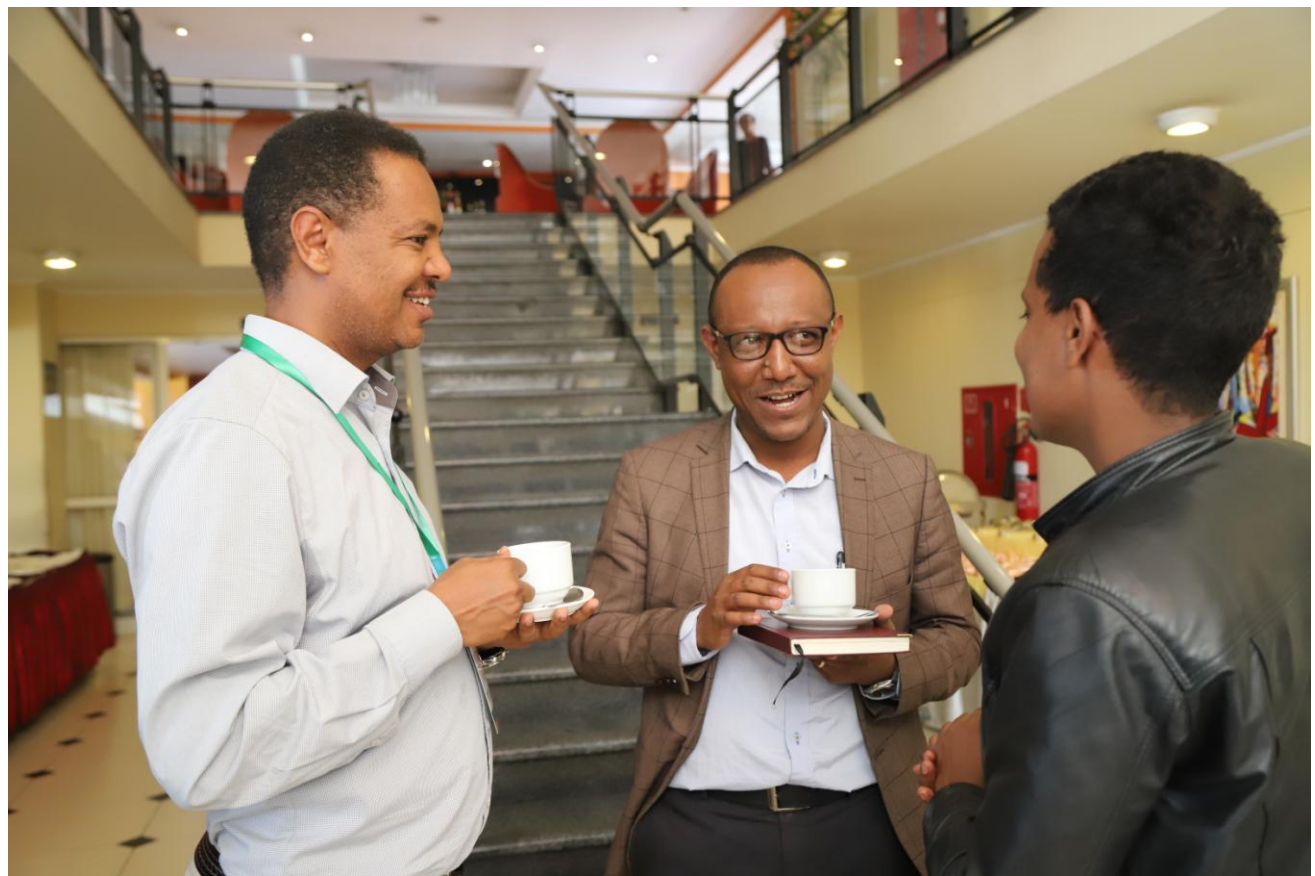
Participants discussing during the coffee break

These coffee breaks were one of the most intimate sessions and the participants seemed to have enjoyed one-on-one discussions and contacts exchange.