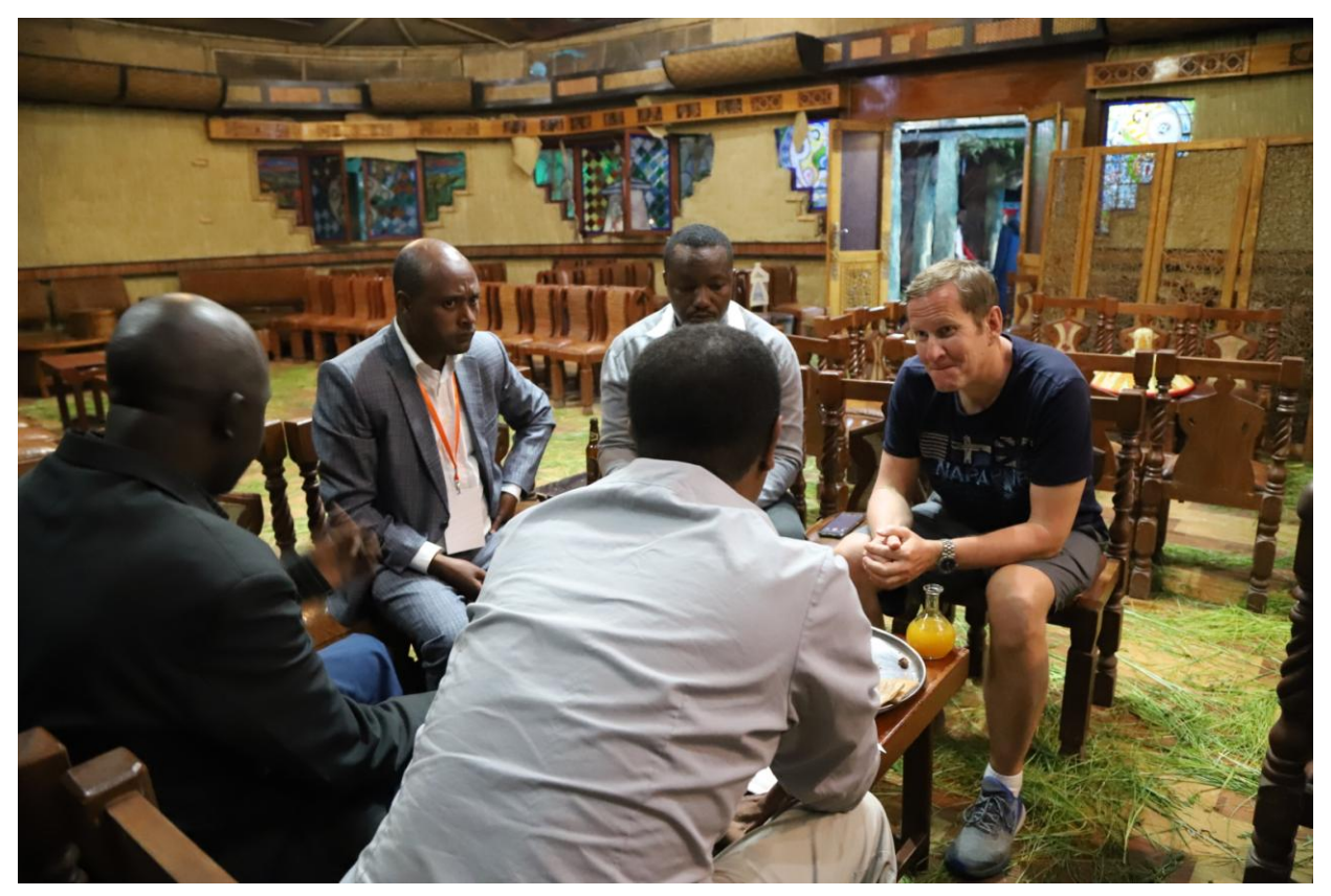
Certificates and gifts

Every participant received a certificate and a gift (a Rufford Conference branded note book).