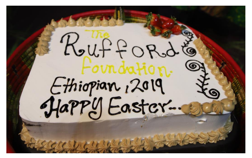
Easter Dinner Celebration at Yod Traditional Hotel

The second day of the conference was the Ethiopian Easter, the most celebrated day in Ethiopia. So the conference organizers considered this and organized a wonderful celebration for the participants on Saturday night at Yod Abyssinia Traditional Restaurant. The Yod Abyssinia is the most unique and one of the best restaurants and bars in Addiss Ababa.