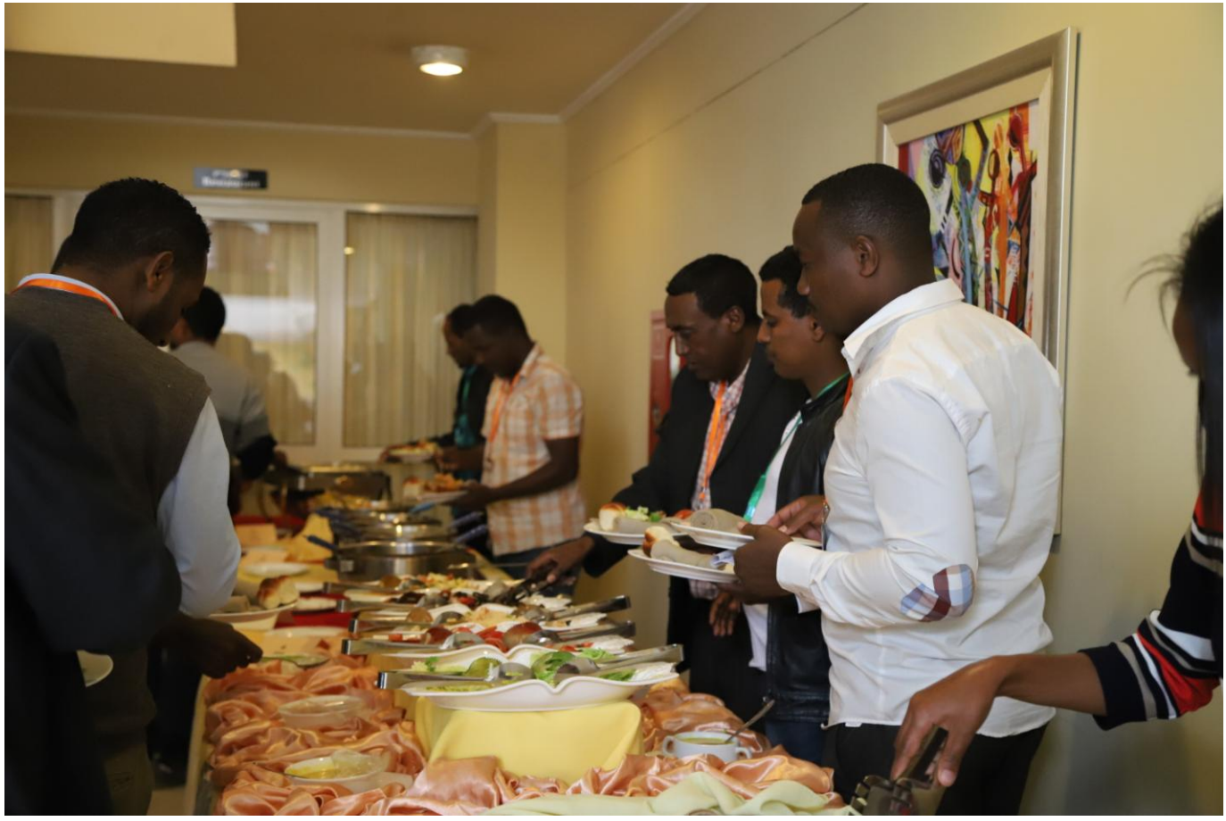
Lunch time memories