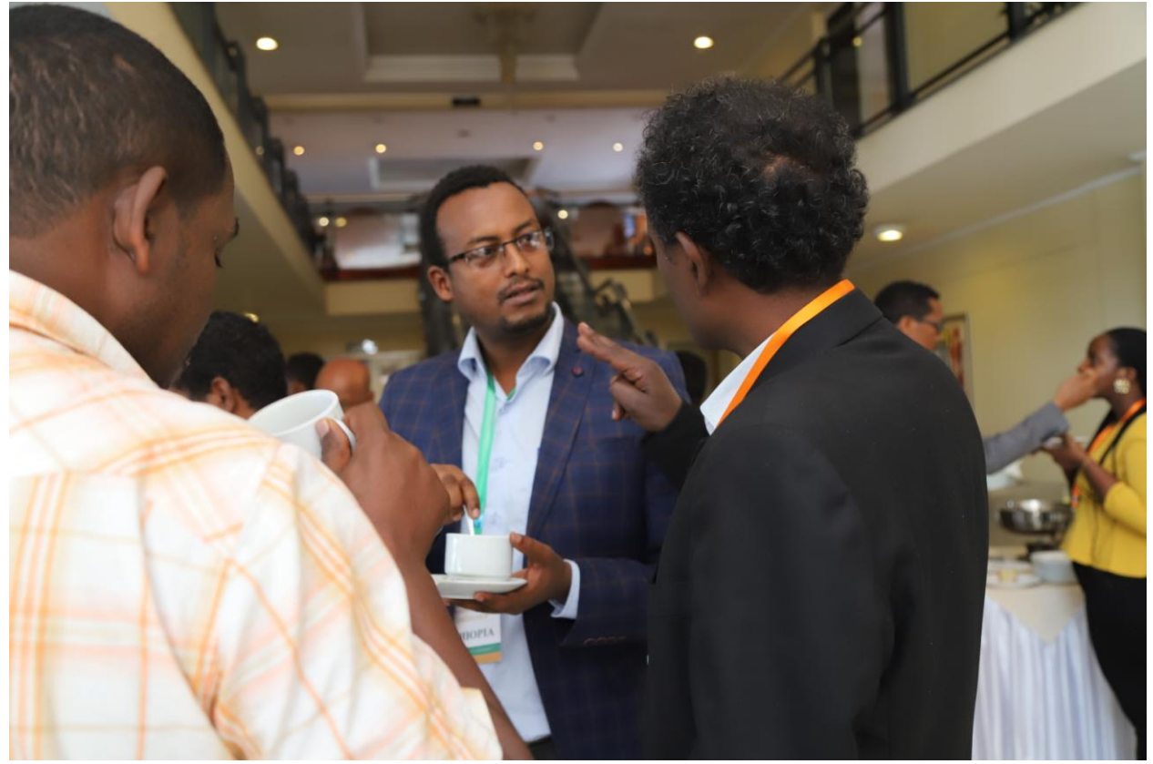
The participants used the time of networking very effectively. With passion they share experience, got to know each other and share business cards and project materials.