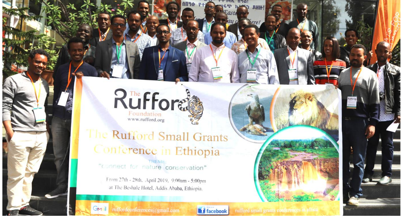
39 conservationists from 5 countries in one place