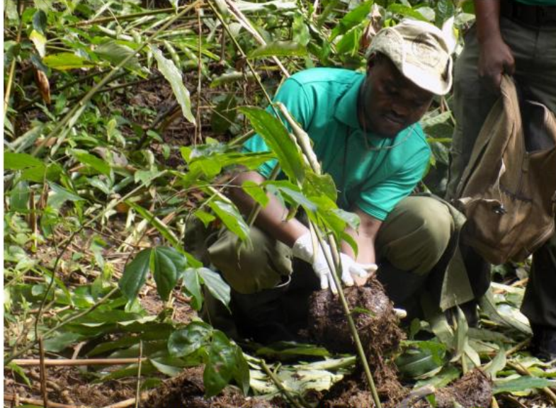
Pix 2: Elephant's dung collection for measuring decay rate at a survey site in Okomu National Park, Nigeria