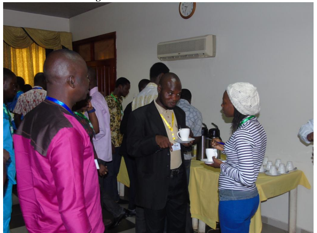
Participants used coffee breaks and any free time to connect and network with each other.