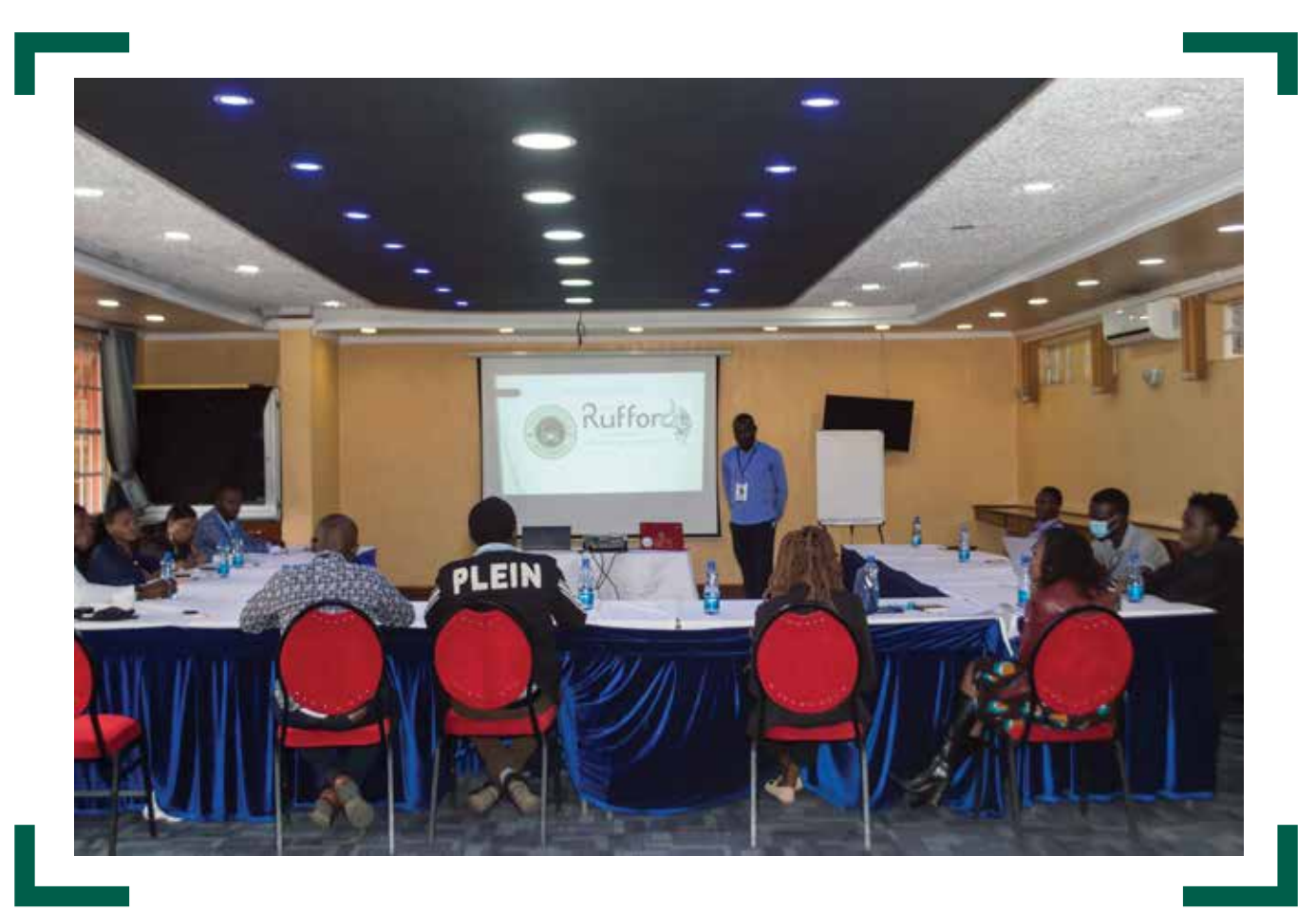
Power Point Presentations

The Rufford grantees have published important biodiversity information including field and academic research and professional knowledge products. In fact the RSG Research projects have made many recipients well-known researchers in Africa. Their publications and reports have been published in refereed journals including African journal of ecology, Global ecology conservation science, journal of biodiversity and environmental science. The RSG publications are also published widely on different institutions websites and shared with stakeholders.