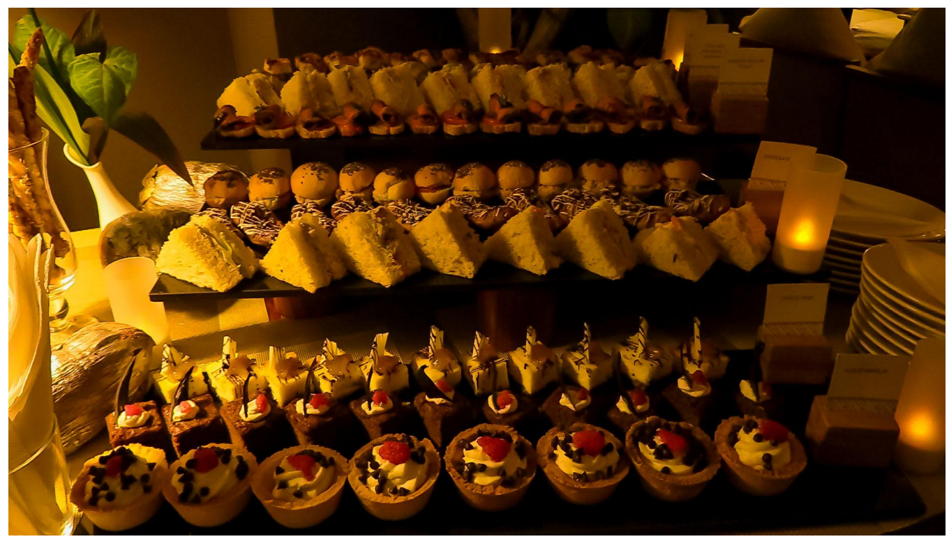
Cocktail Party for refreshments, networking and memories