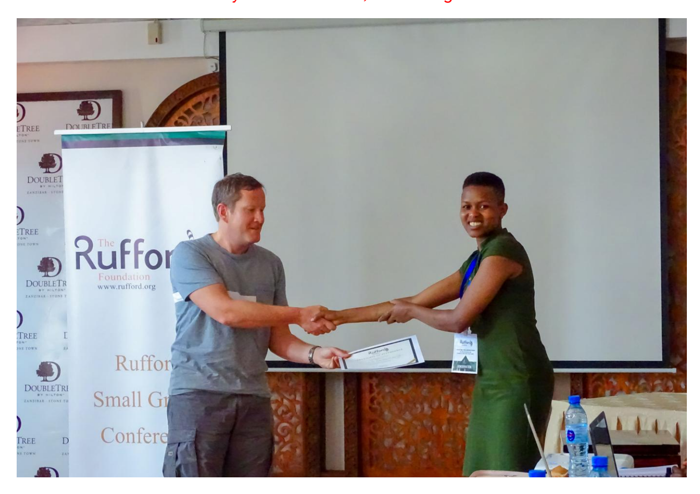
Participants Recognition and Certificates Awarding