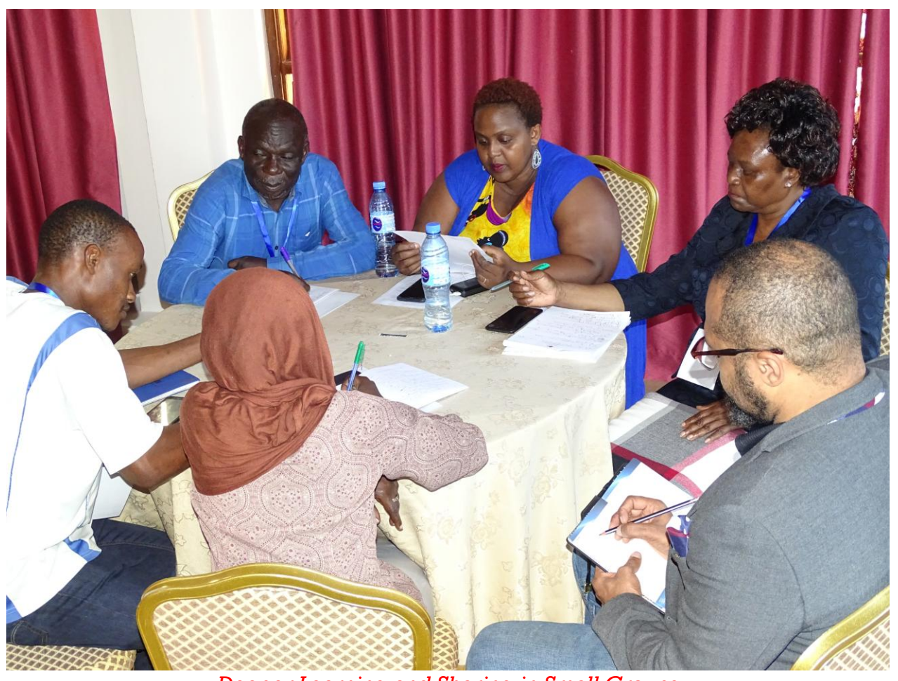
Deeper Learning and Sharing in Small Groups