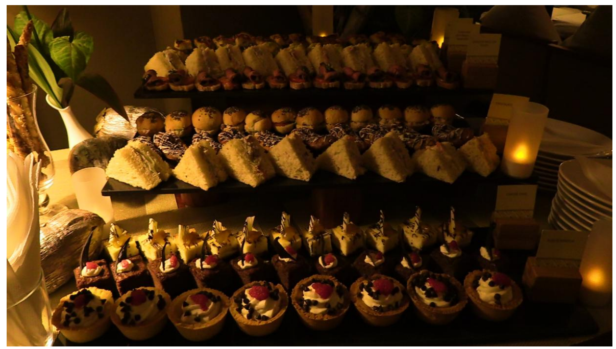
Double Tree Cocktail Canopy for RSG Recipients

The first day ended with a cocktail party where the participants enjoyed different foods and drinks as they do networking and sharing ideas.