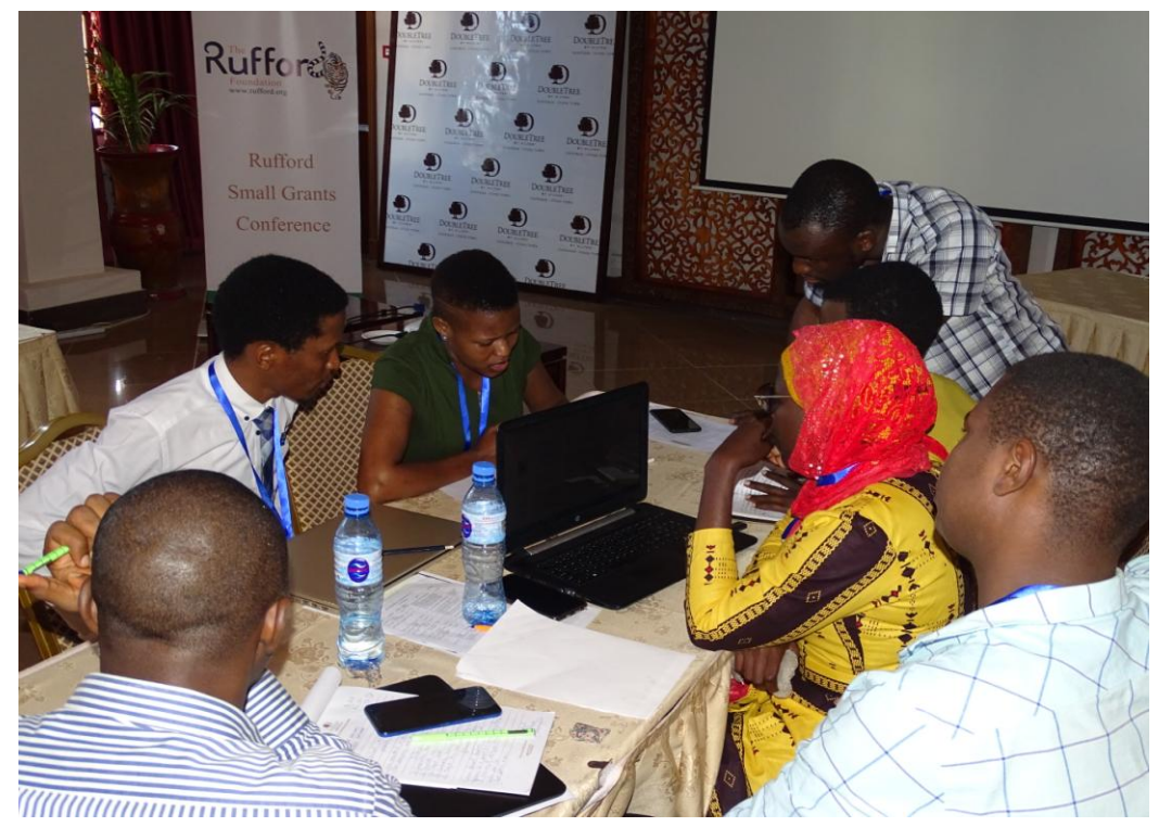
Group 3 working on their discussion report