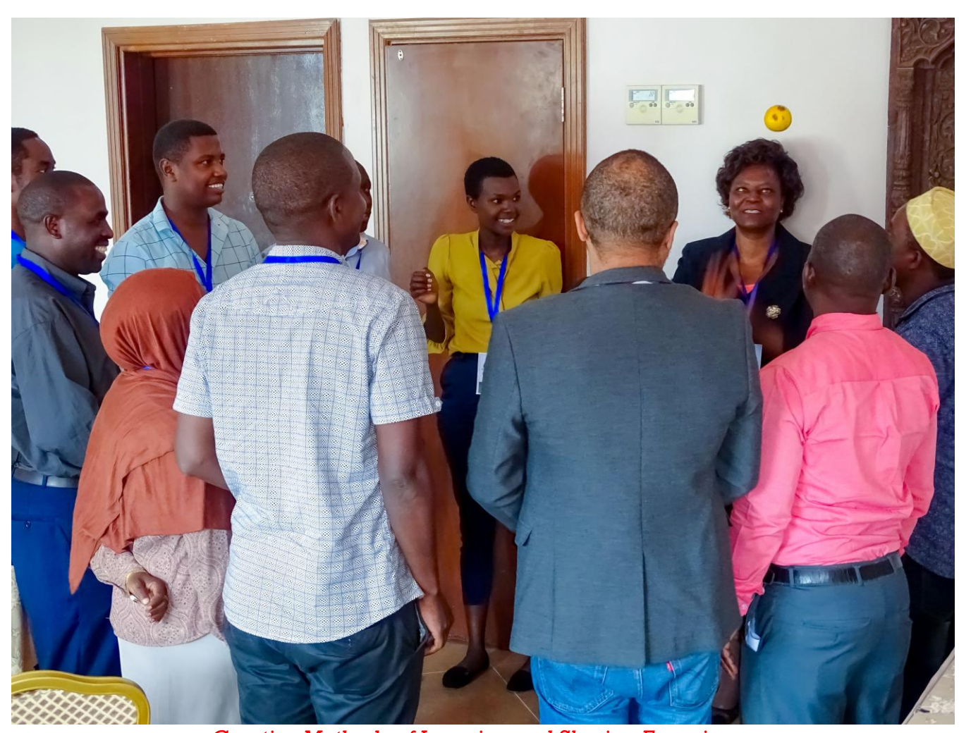
Creative Methods of Learning and Sharing Experience