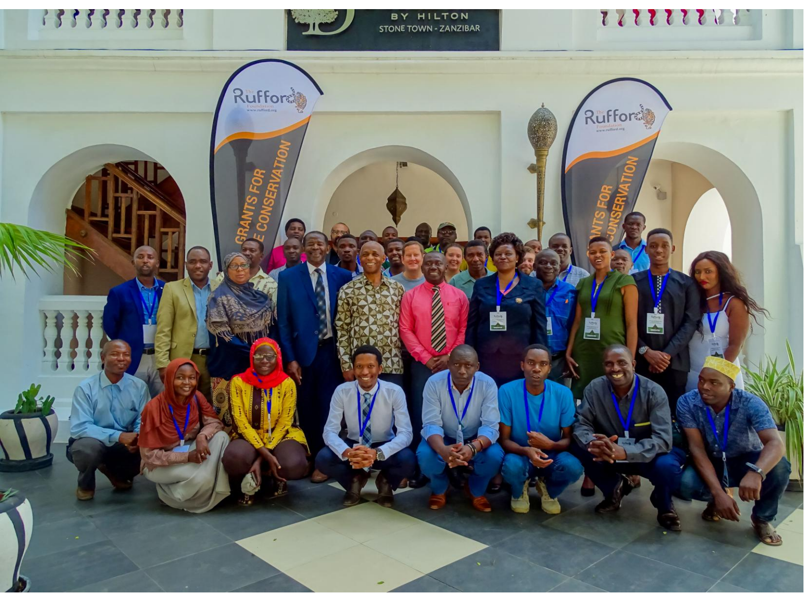
49 Conservationists from 7 Countries in One Island

From 20^{th} - 21^{st} February, 2020 At Double Tree Hotel by Hilton, Stone Town, Zanzibar