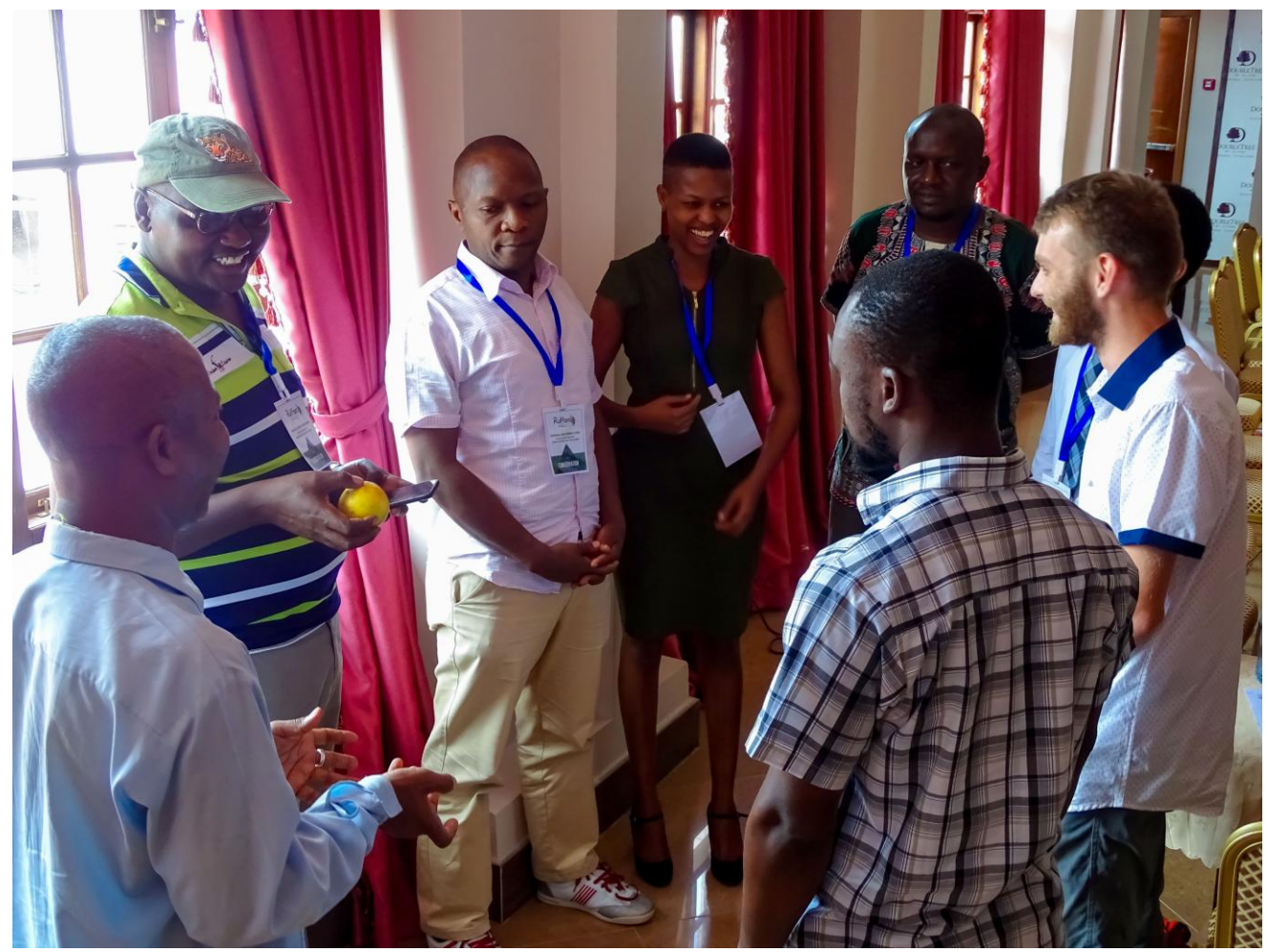
Team A devising strategies to get the orange through every members hand in the shortest time possible

Alphonse engaged the participants in a quick but very interesting and very educative ice-breaker game. The participants were split into three teams (Team A, B and C). Each team was given an orange. This orange was to pass through every team member's hand in as short time as possible.