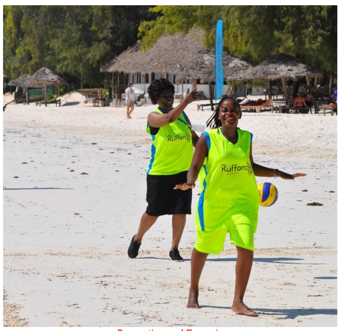
Recreation and Excursion