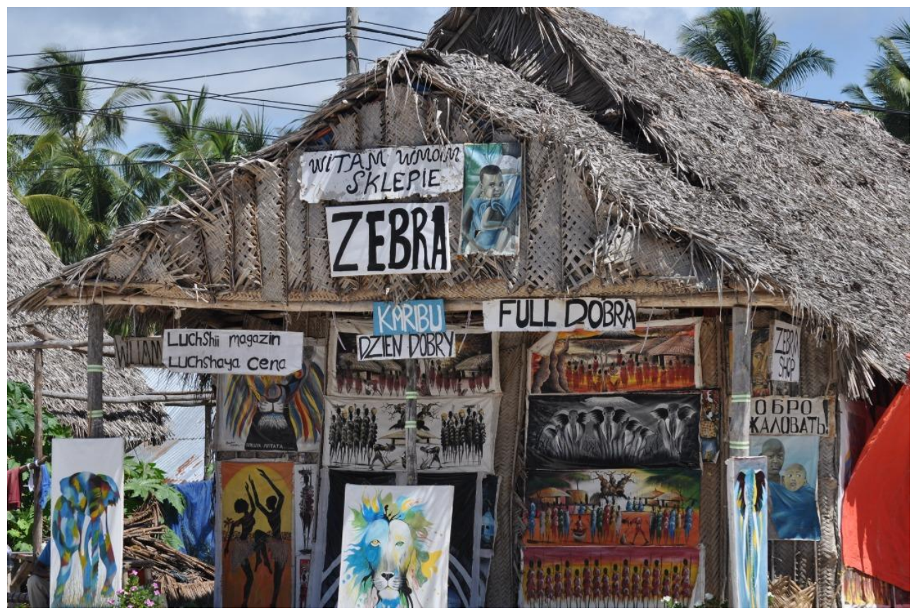
a house, near the entrance of Padi Beach, representing some of eco-tourism activities done in Padi

The second day , 21<sup>st</sup> February, was a day of excursion of Kizimkazi, the beautiful southern part of the Zanzibar Island. The participants had to see the Padi Beaches and their Sea Nature and ecotourism activities, to play farewell Beach Volley, and to excurse the Jozani Forest. Unfortunately, for the sake of fellow participants who had to catch their flights, the participants enjoyed the rest of activities apart from the Jozani Forest.