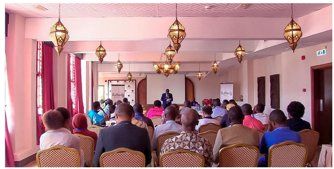
Authoritative Speakers and Great Attendance