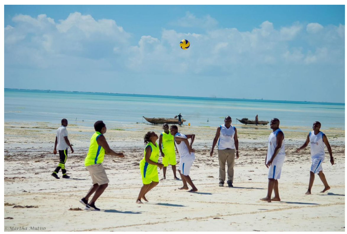
Participant playing the beach volley at Padi Beach

So, the participants did excurse different beautiful sceneries and on their own learnt from different conservation and eco-tourism activities taking place on the sea shores of Kizimkazi. At the end of their trip, they played a beach volley friendship match. This play made a wonderful farewell with great fun and friendship memories.