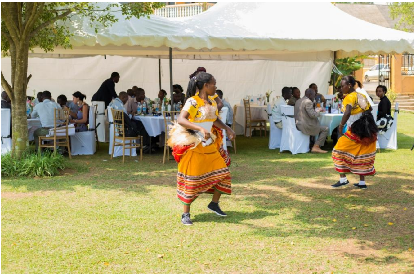
Participant having lunch as the cultural dancers entertain them on the shore of lake victoria

LUNCH: during lunch time, participants were networking and entertained by the cultural dancers. They had a good African buffet many claimed.