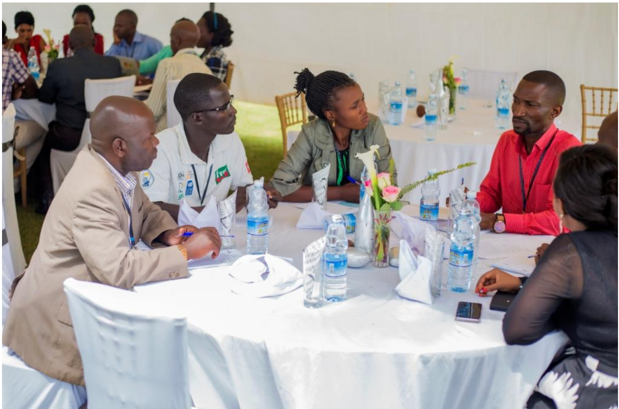
Group members discussing and sharing experience

Members of the groups were asked to talk about their projects to the other members. The group leader managed well the time given and each member was given a chance to share his project experience. The group members held their discussions and prepared PowerPoint and flip chart presentations. The groups also selected the best projects to be presented in the afternoon.