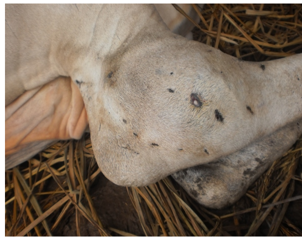
Fig.4: Injury marks on a cow's leg, caught by mugger at Traj Village, Gujarat