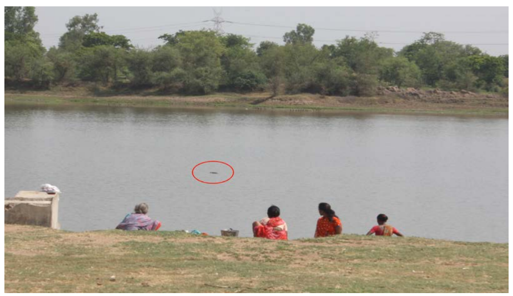
Fig. 2: Women while washing the clothes, watch a croc go nearby at Deva village.

All the mugger occupied wetlands were majorly used for activities like bathing, washing purpose and drinking. Only seven respondents answered that the wetlands are used for fishing too. However when we asked the question "do you go fishing", more responded (23%) answered that they do occasional fishing. 71.66% of the interviewed people also reported that fishing in these wetlands is carried out by fishermen coming from outside the village. Majority of the wetlands are given on lease by the Panchayat (village authority) for fishing. Only 10 respondents said that the wetlands are also used for farming. The peak hours of water use by humans were between the 0500- 1000 hrs in the water bodies of the study area, which was followed by 1000- 1300 hrs. Livestock mostly used the wetlands in the morning up to 1000 hrs and in the evening around 1600 hrs. People also use some of this wetland to grow Indian water chestnut ( Trapa bispinosa ), and Lotus ( Nelumbo nucifera ).