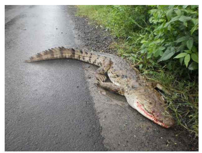
Fig.3: A mugger run over and killed by a vehicle on road near Deva Village, Gujarat, India.

recorded during the survey. One crocodile (5.38 ft) was killed near Deva village while crossing the road. During monsoon, muggers in this region engage in local migration moving from one wetland to another. During such movements they have to sometime cross roads and railway tracks. It was during such movement that the animal was run over by some vehicle. Encroachment in to the mugger habitat was also found to be a serious threat to their survival. In April 2014, many mugger burrows were destroyed while reconstruction the side of the canal at Deva village, which harbours significant muggers populations in the area (Upadhyay and Sahu 2013; Vyas 2013).