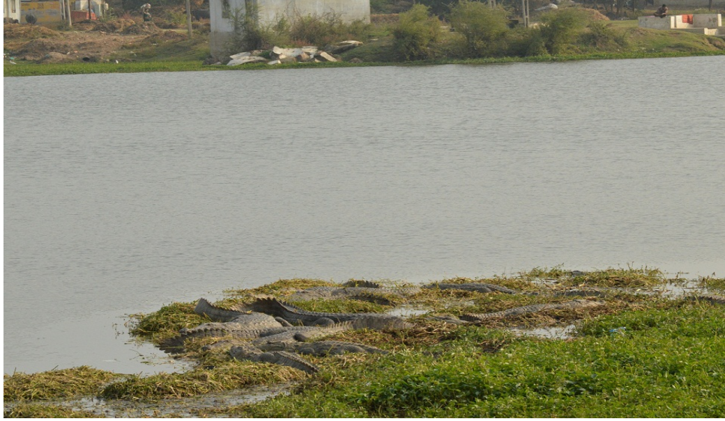
Fig. 3: Mugger basking in group at Deva Village.