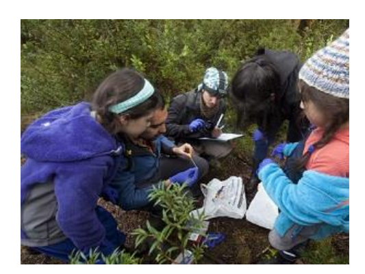
Figure 1. Children and part of our team in fieldwork activites. Melimoyu, Chile.

Our project started in late austral winter 2014. At the same time that fieldwork activities were developed, we participated in several talks and activities with local children. We brought small groups of children to the forest to observe and collaborate with the scientific research in Darwin's frogs (see photo 1). Furthermore, talks to large groups were performed in schools and a summer camp (see photo 2 and 3). As scientific work progressed, our interest to involve local children and adults (but also anyone interested) in the conservation of Darwin's frogs also increased. This has been an amazing experience!