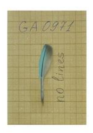
Nest - N14Cg01