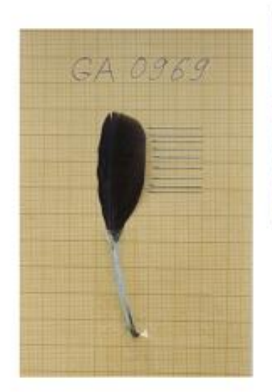
Nest - N14Cg03