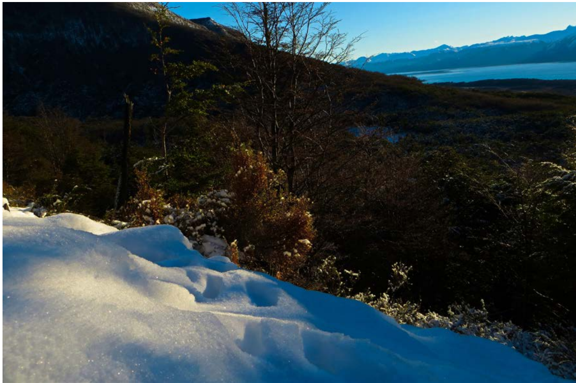
Mink tracks on the snow showing how mink in Navarino Island are using other habitats away from water sources and different from other parts of the world where mink present a sub-aquatic habit.