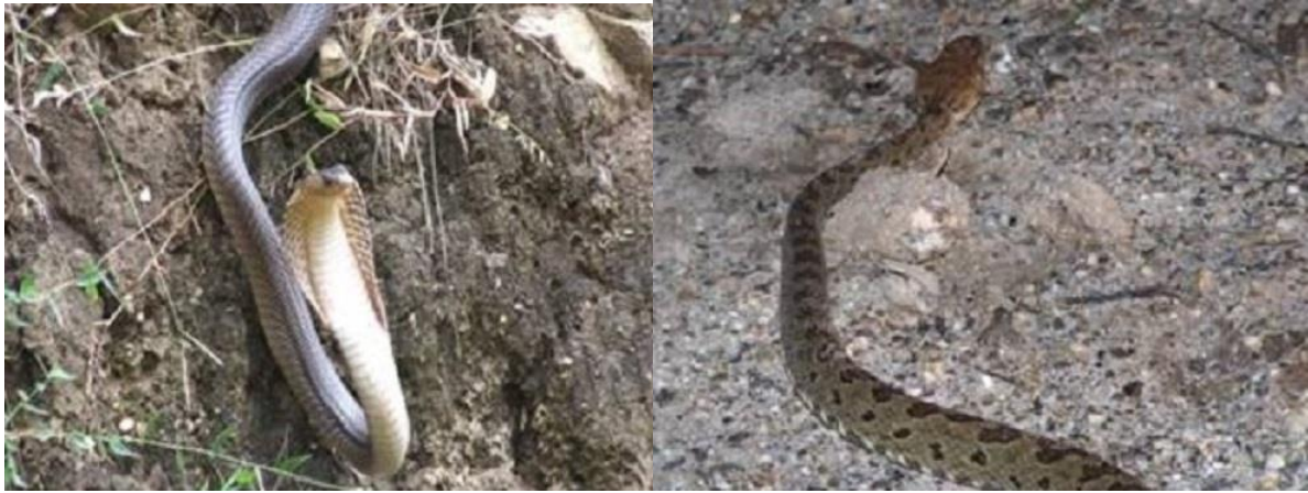
Left: Naja kaouthia . Right: Protobothrops himalayanus .