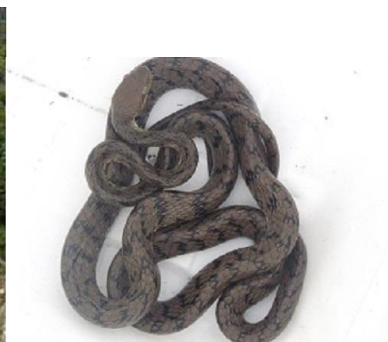
Left: River Mochu, study site. Right: Boiga multifaciata .