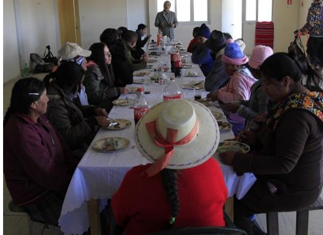
Workshop with the community of Enquelga.

Andean cat photographed by a camera trap