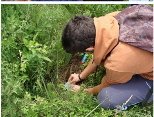
Photo 6. Children setting up traps for spiders in order to collect spider material for their school