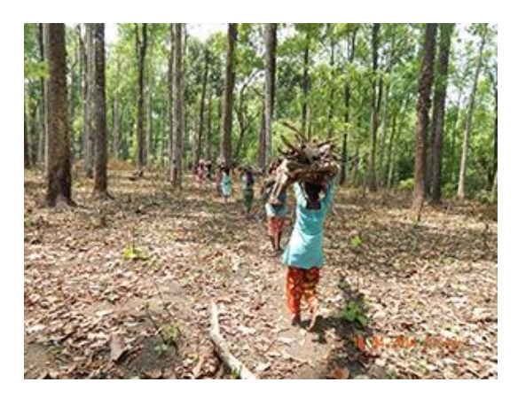
Image1. Stakeholder interview respondents: A group of women from nearby tea estate extracting driftwood from forests