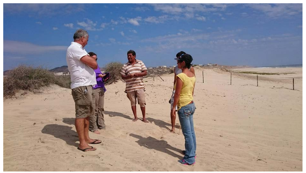
A small group of ATV passing while we were in process of making a beach profile.

The workshop attendees included two ATV companies trying to do right by impacting less and cleaning the beach, five members of the ejido, and a new sea turtle nest monitoring group, "Eco-Plan". After the workshop, we proceeded to train interested attendees how to record coordinates of nests, how to mark nests, and how to make a beach profile. The workshop is in an area of heavy ATV traffic, much of it illegal according to Mexican law, and within sea turtle nesting habitat. We are working with Eco-Plan and ATV companies to develop best practices for nest protection and conservation tourism with the ejido, the municipal government of Los Cabos, and the large network of nest monitoring groups spanning the elite hotel region of Los Cabos, **where the Rufford Conference was held in February 2015.