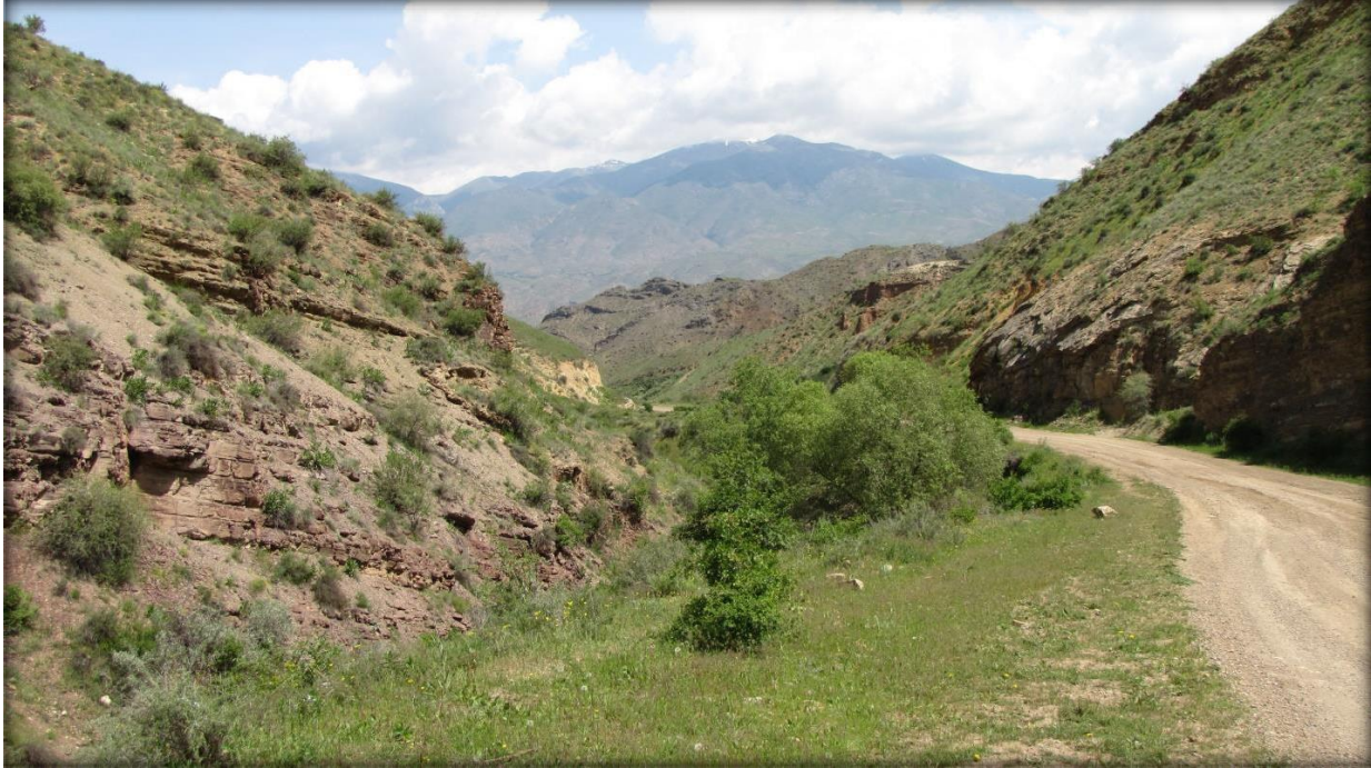
Fig 2. Ourtsadzor PBA