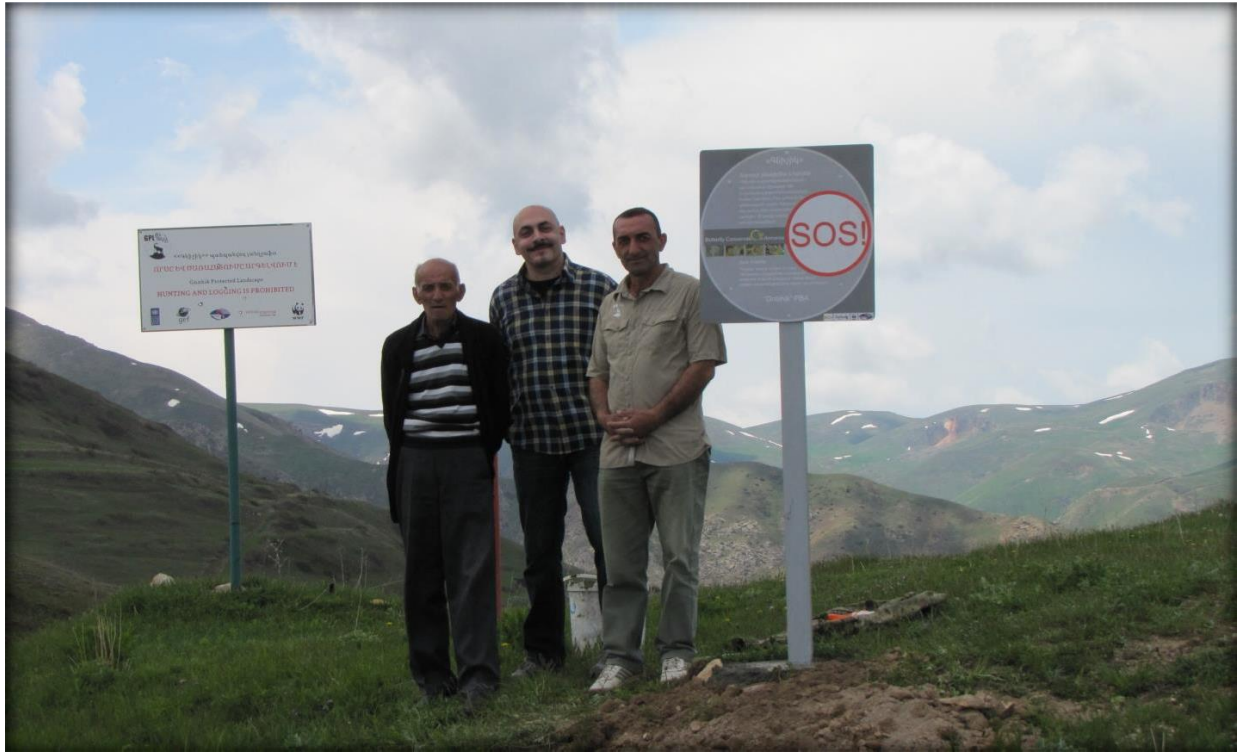
Fig 5. Thaleropsis ionia . The species with stable population trend is very interesting for butterfly watchers