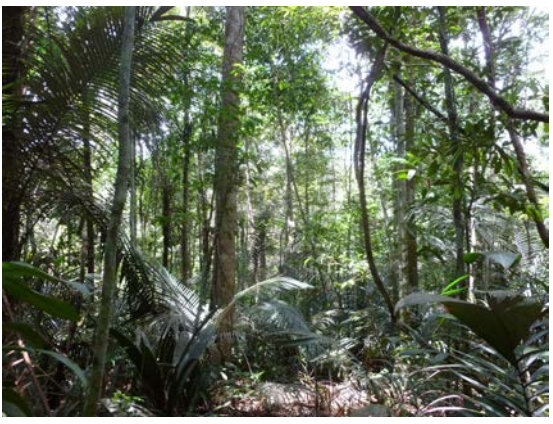
Left: Continuous forest site. Right: Forest interior.