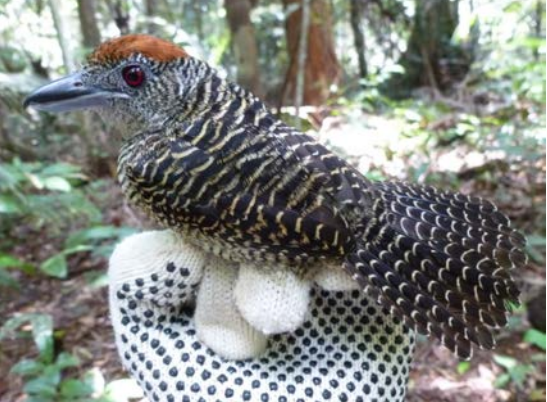
Left: ruddy spinetail (Synallaxis rutilans). Right: fasciated antshrike (Cymbilaimus lineatus).