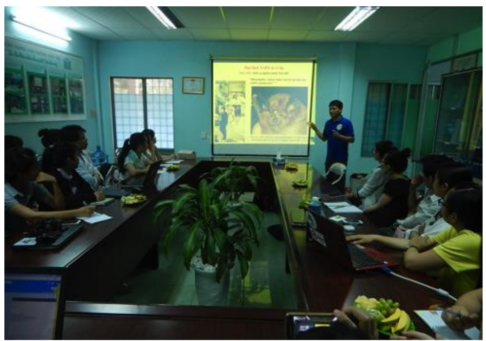
Workshop on "Urban bats and bat borne diseases" held in April 2017 at the University of Da Nang - University of Education (co-organised with GreenViet)

The project team also collaborated with local organisations (i.e. GreenViet) to established seminars and workshops on "Urban bats and bat borne diseases".