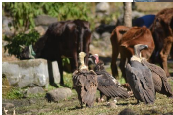
Vulture monitoring at Vulture Safe Feeding Site