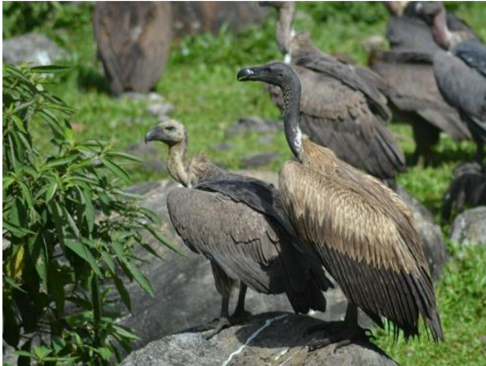
Slender billed vulture (adult) and juvenile white rumped @VSFS Ghachowk, Hemanta Dhakal