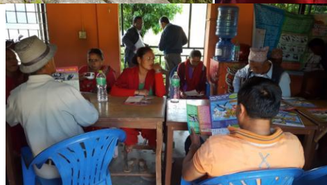
Culture awareness and Interaction Program