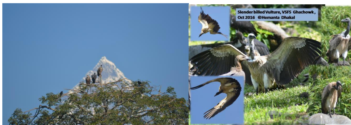
Fishtail mountain, vultures and Bombyx cebia

Every week one hotspot (among eight selected sites of Kaski) was visited and vulture number, species and their activities are observed and recorded. We start our monitoring from 8.00 am to 11:00 am. In some cases (mostly during carcass feeding) we have also observed till 1:00 pm. From September to mid-November we have good opportunity to make people from different sectors to participate in the monitoring of vulture in vulture safe feeding site in Ghachowk and land filled site of Pokhara. This phase we had observed four carcass feeding at vulture safe feeding site, Ghachowk and two carcass feeding in Pokhara- 14, Majeripatan (Proposed Regional Airport site Of Pokhara).