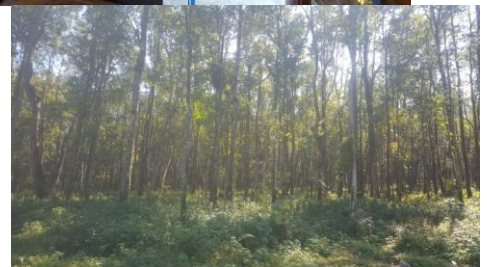
Bamdi Veer Community forest