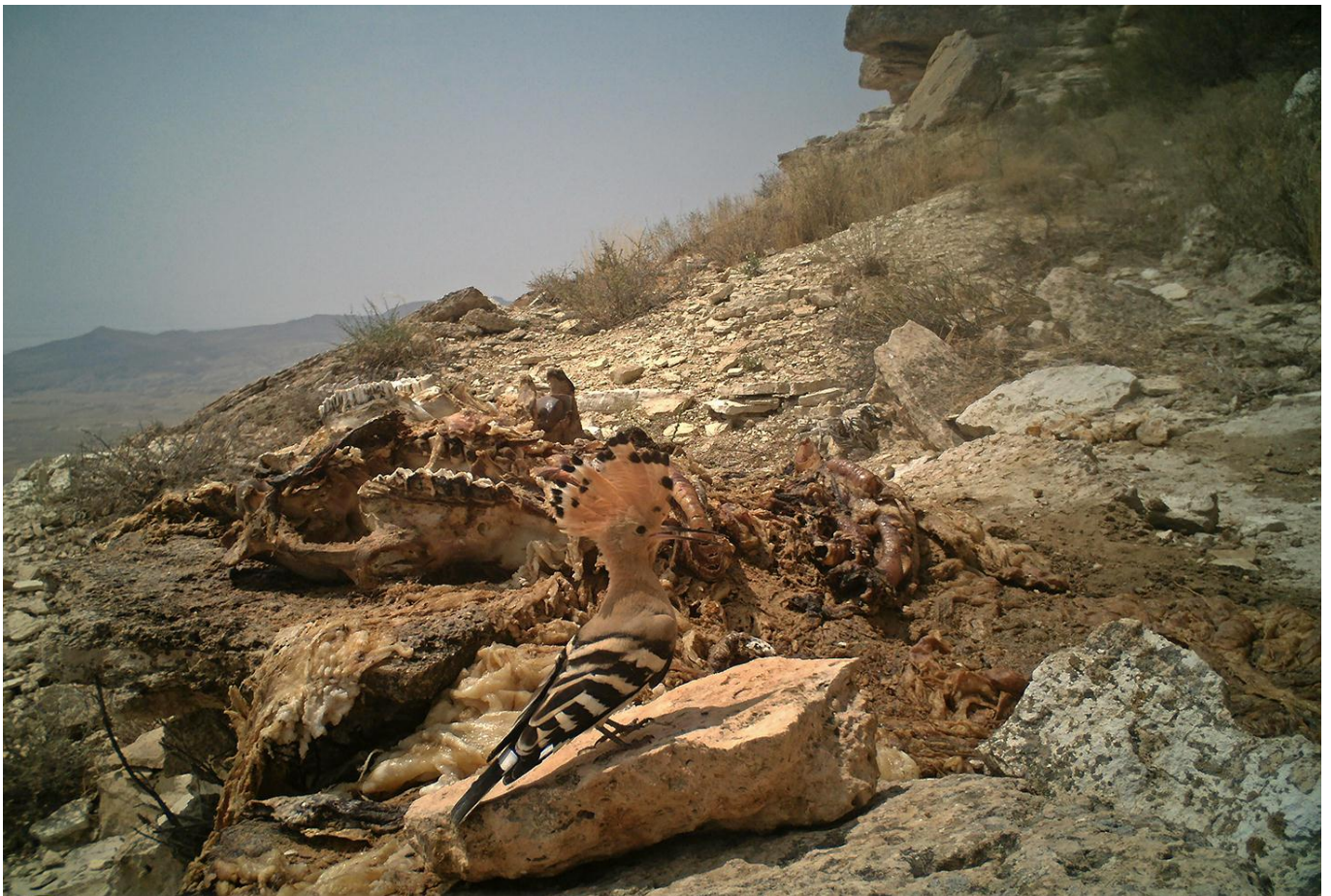
Hoopoe ( Upupa epops ), as well as the small passerine species, was attracted to the station by numerous flies and its larvae.