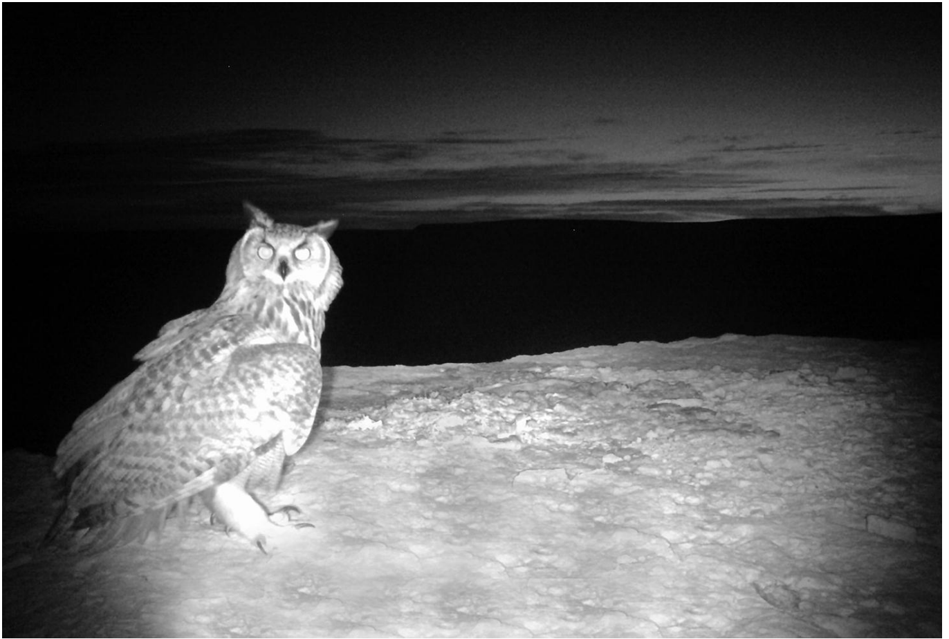
Eagle Owl ( Bubo bubo ) was attracted to the feeding station by the hedgehogs that often become its prey.