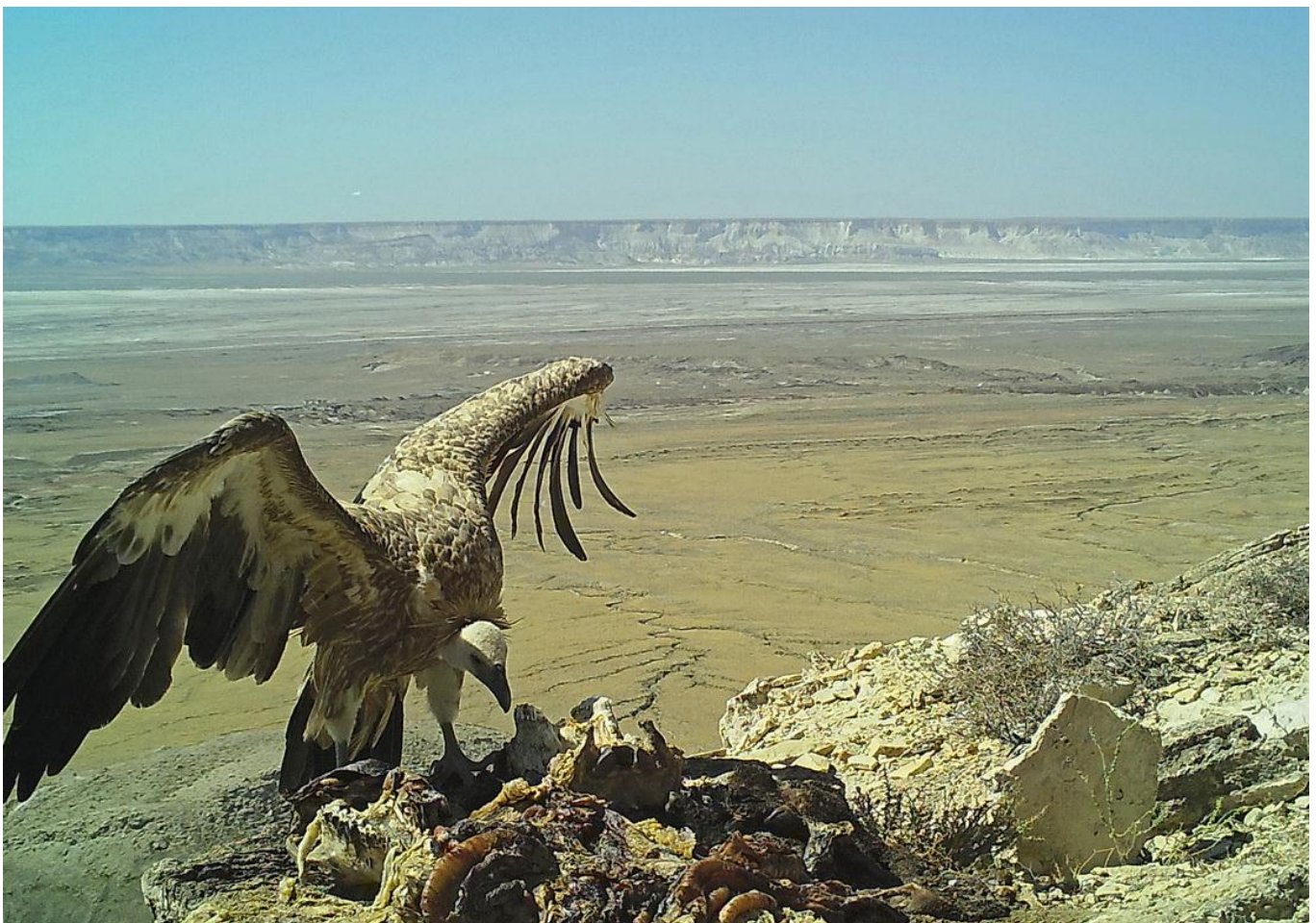
Griffon Vulture ( Gyps fulvus ) is non-breeding species in the Ustyurt State Nature Reserve.