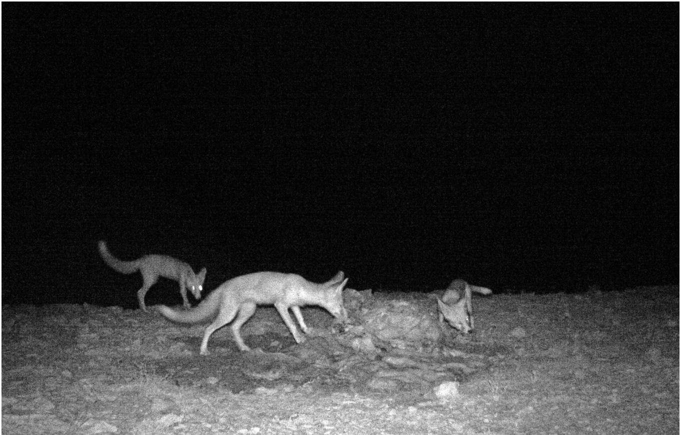
Red Fox ( Vulpes vulpes karagan ) is the most common predator within the Reserve.