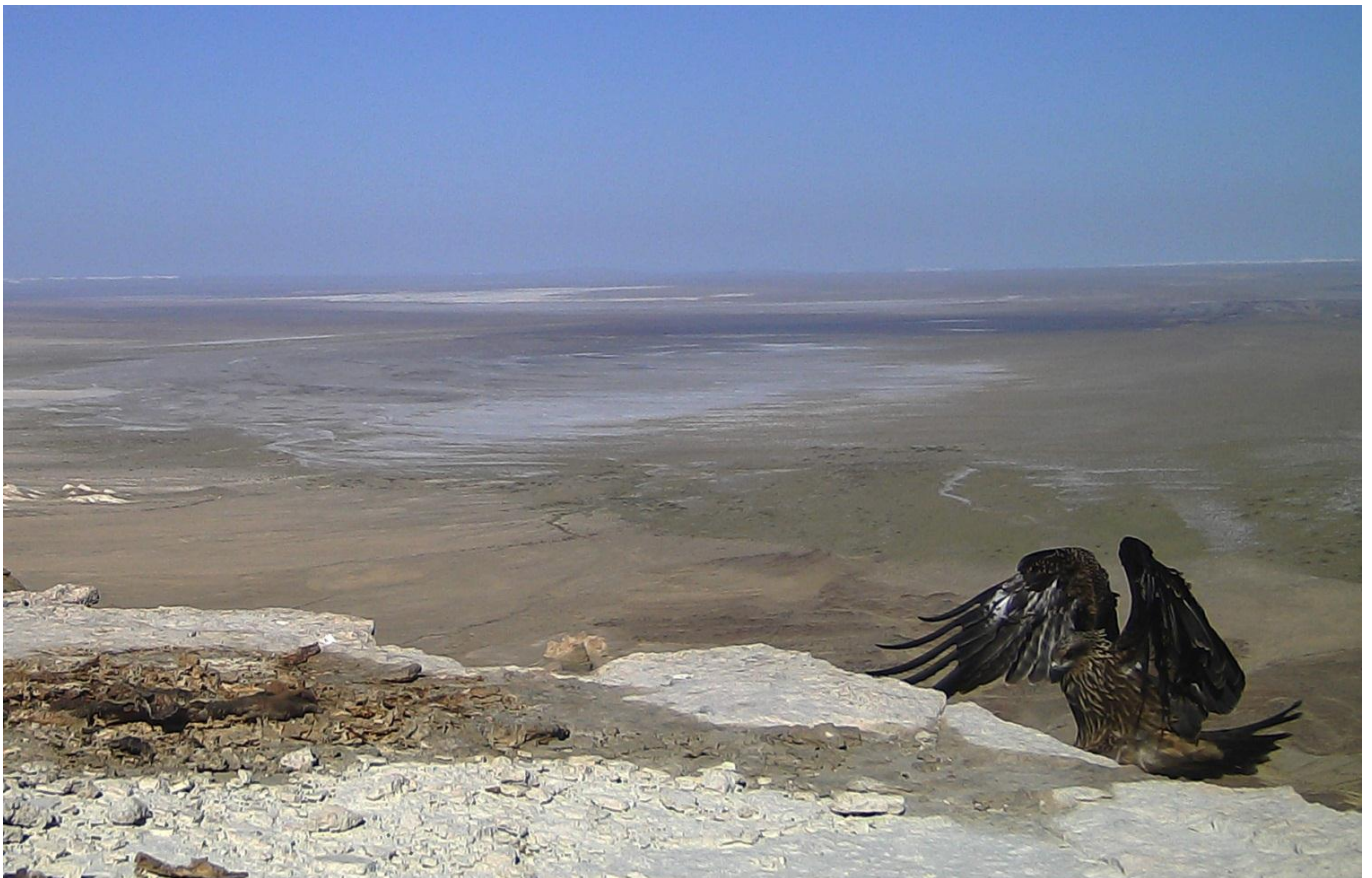
Black Kite Milvus migrans at the feeding site.