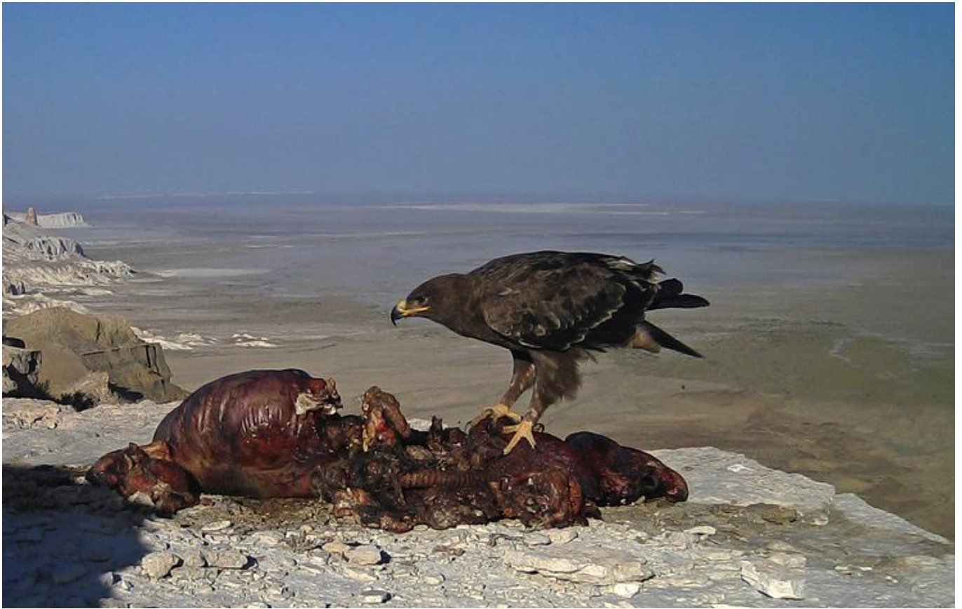
Steppe Eagle ( Aquila nipalensis ) on the feeding station.