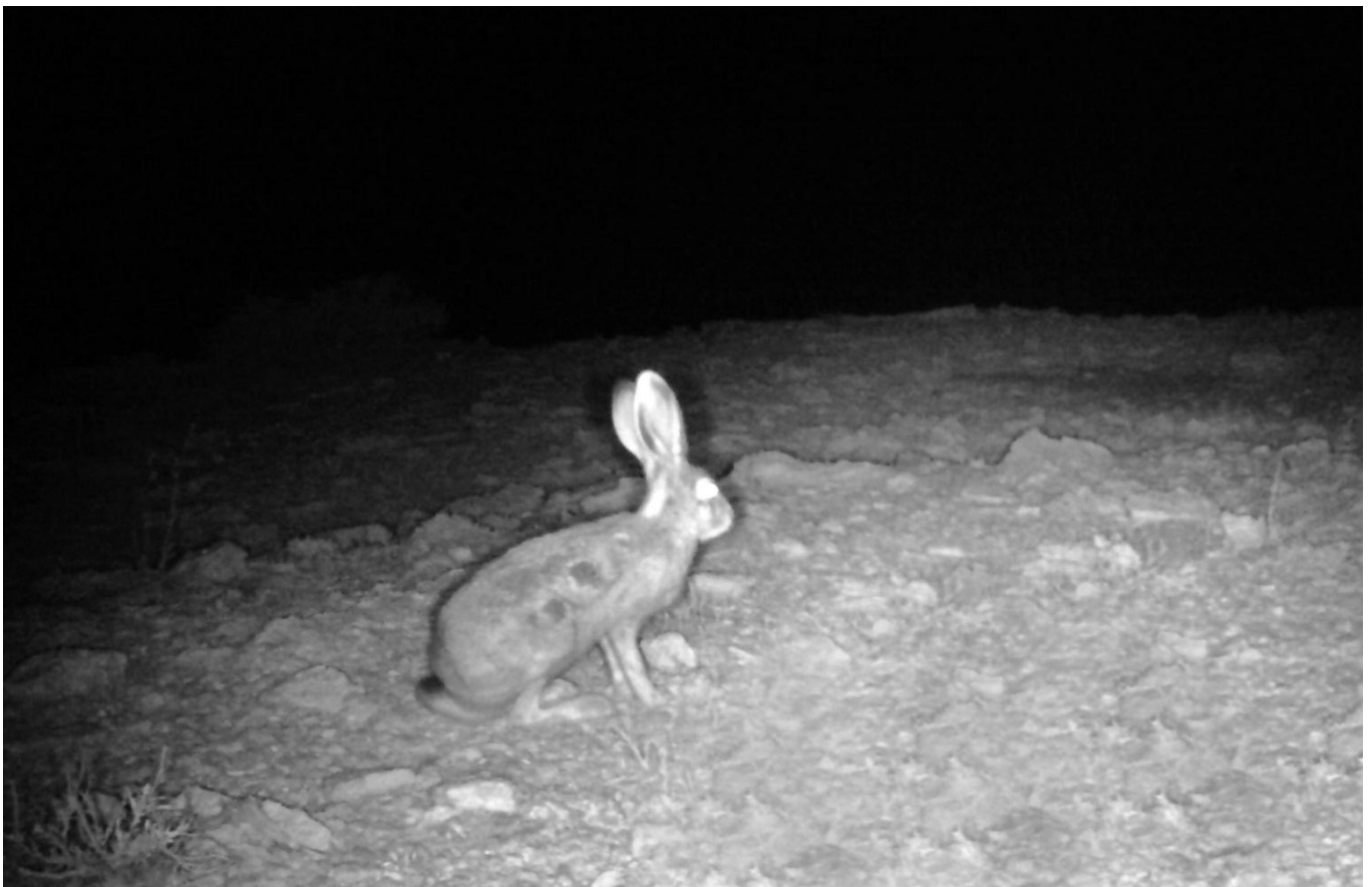
Tolai Hare ( Lepus tolai ) is common inhabitant in the Reserve.