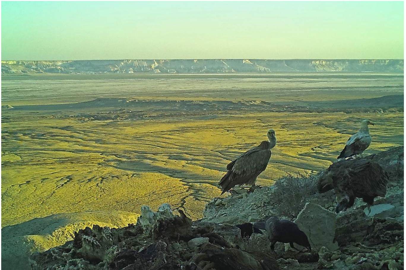
Cinereous Vulture ( Aegypius monachus ), Griffon Vulture ( Gyps fulvus ), Egyptian Vulture ( Neophron percnopterus ) and Common Ravens ( Corvus corax ) on the feeding-station.

Annex: photos taken by camera traps at the feeding stations.