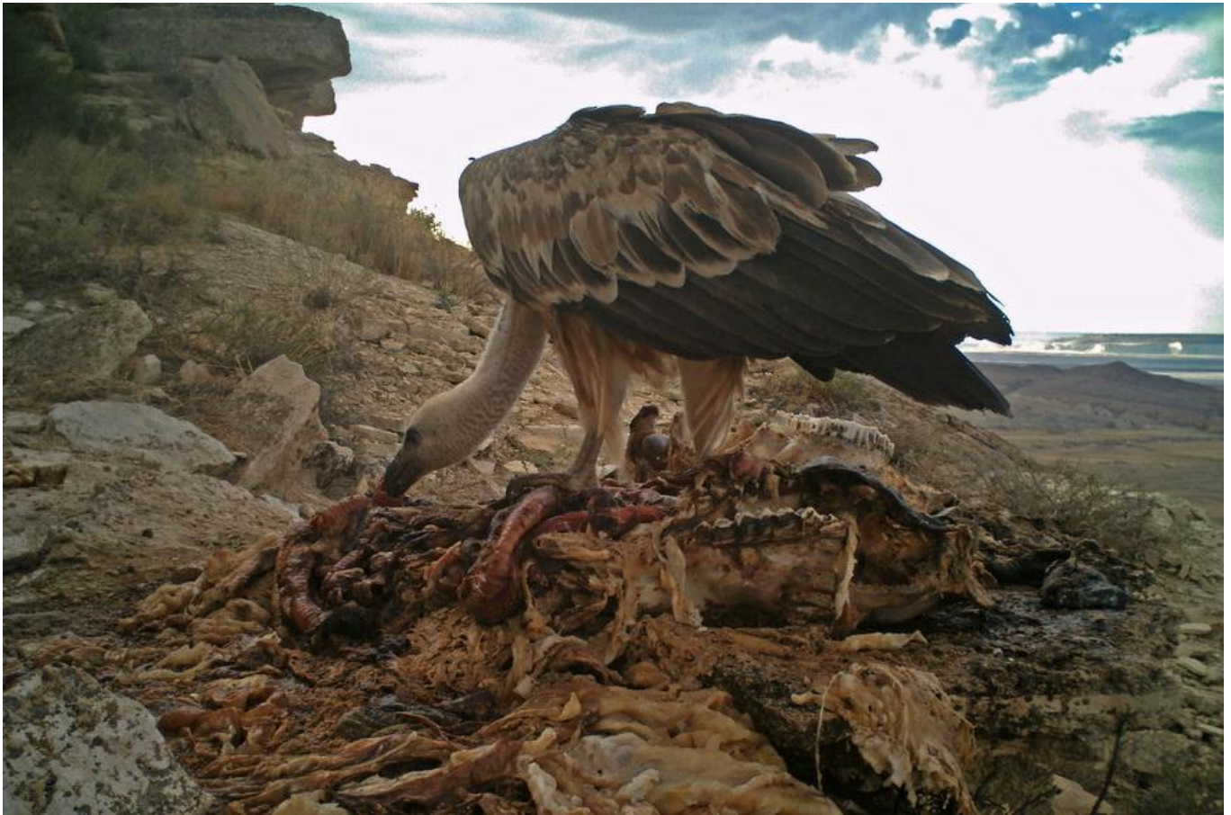
Griffon Vulture ( Gyps fulvus ) is a rare visitor at the feeding site.