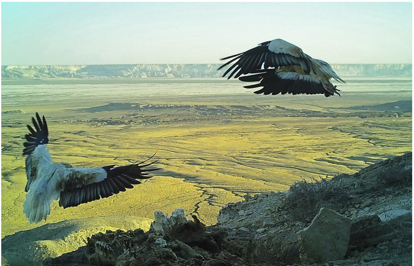
Aerial dance: a couple of Egyptian vultures ( Neophron percnopterus ) take off from the site.