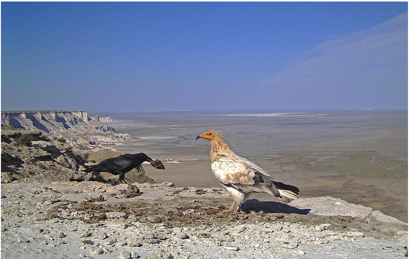
Egyptian Vulture ( Neophron percnopterus ) and Common Raven ( Corvus corax ) on the feeding station.