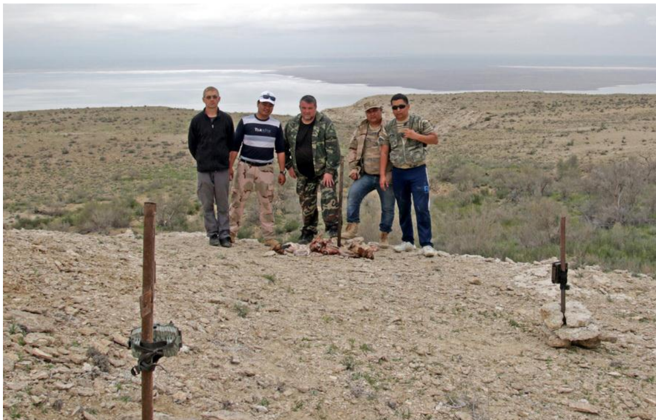
Supplementary Feeding Project team on the feeding station.