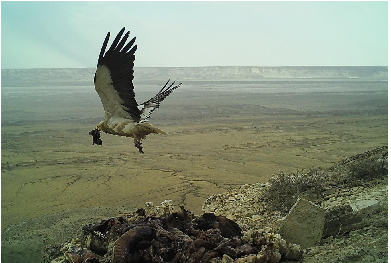
Egyptian Vulture ( Neophron percnopterus ) carries a piece of offal away from the feeding station.