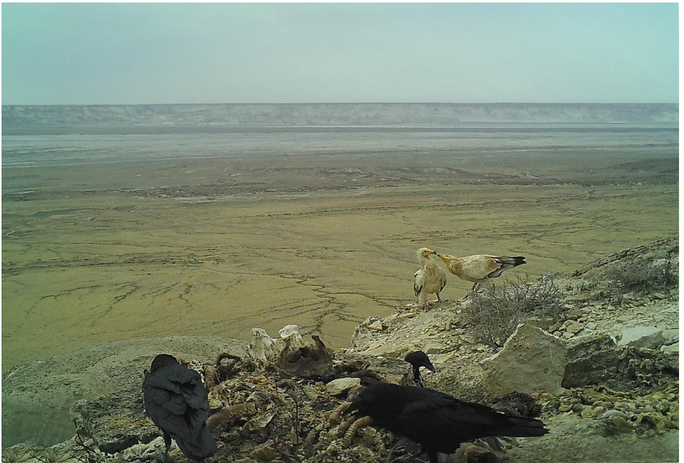
Common Ravens ( Corvus corax ) and a couple of Egyptian vultures ( Neophron percnopterus ) at the feeding site.