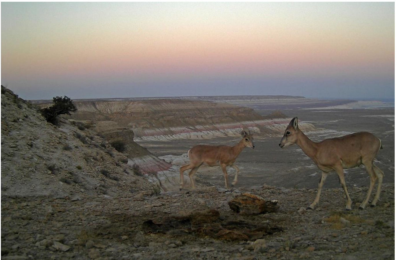
Ustyurt Urial ( Ovis vignei arkal ): a female with her lamb.