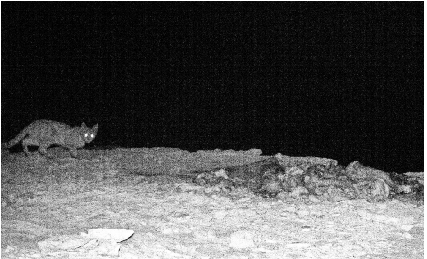
Wild Cat ( Felis silvestris lybica ).