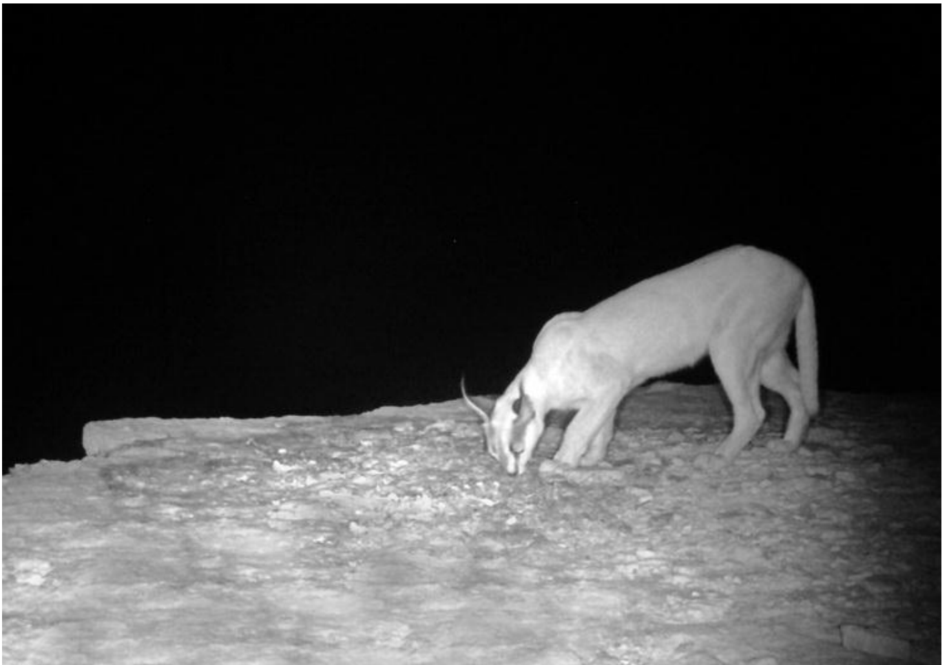
Caracal ( Caracal caracal ) is one of the rarest species of the Ustyurt State Nature Reserve and is listed in IUCN Red List and the Red Data Book of Kazakhstan.