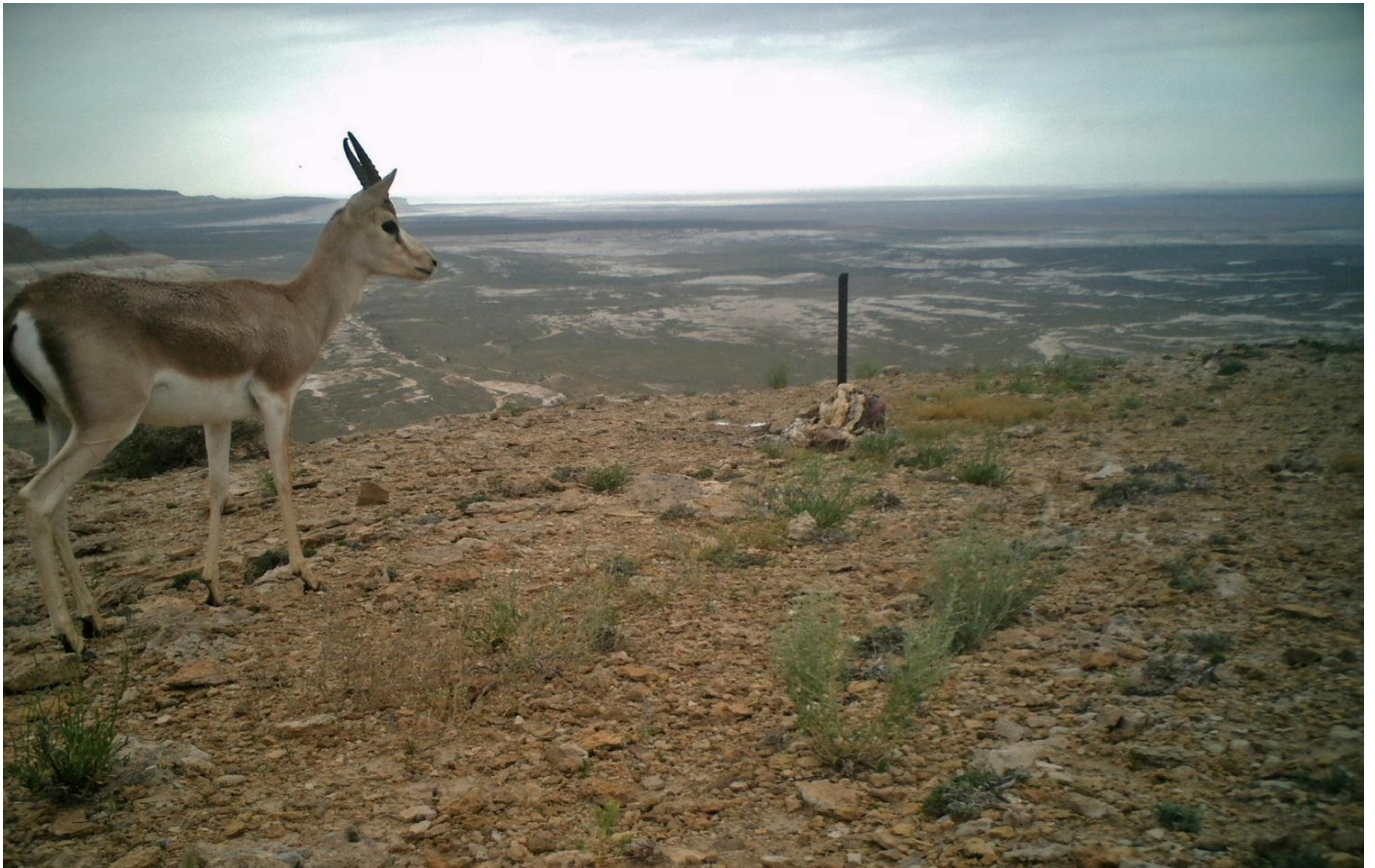
Goitered Gazelle ( Gazella subgutturosa ) is listed in IUCN Red List and the Red Data Book of Kazakhstan.