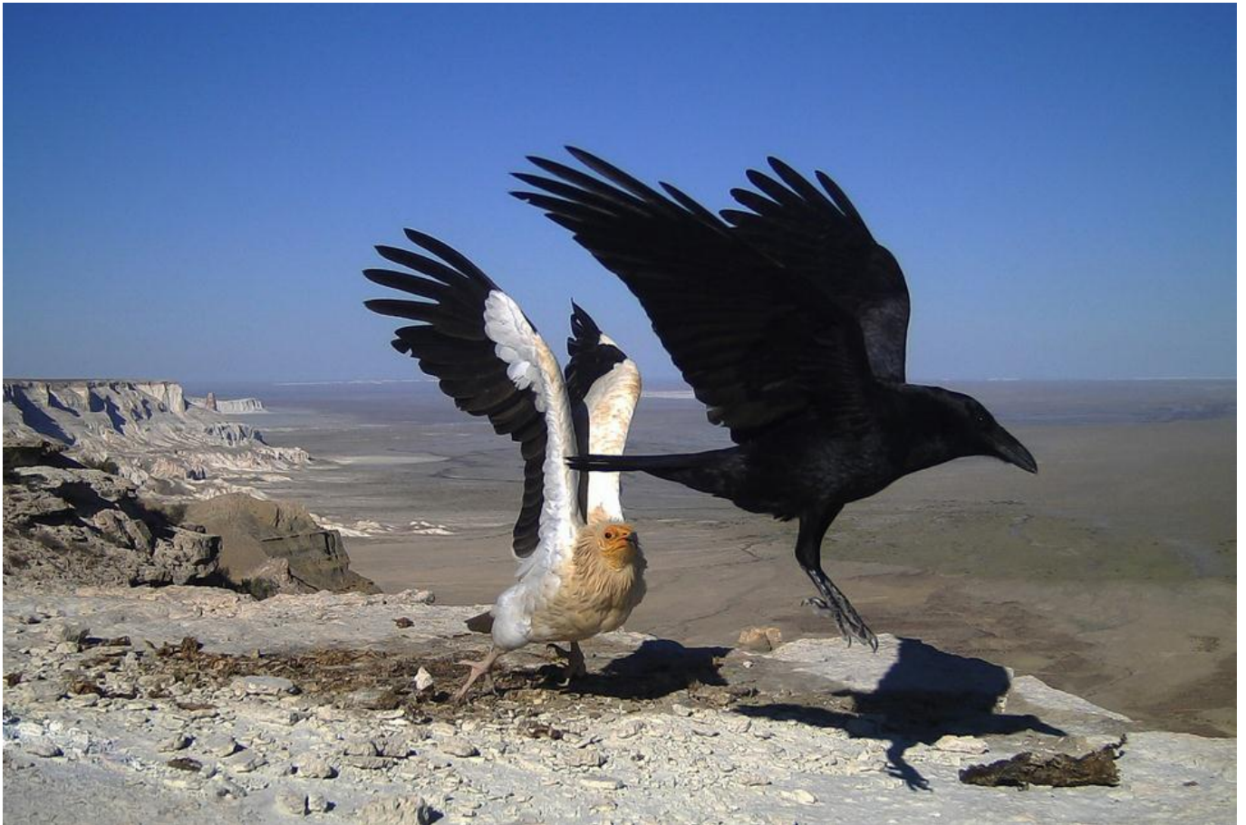
Egyptian Vulture ( Neophron percnopterus ) chase away Common Raven ( Corvus corax ) from the feeding site.