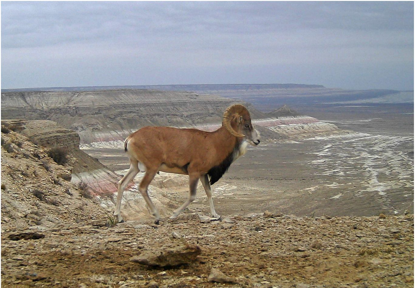
Ustyurt Urial ( Ovis vignei arkal ) is listed in IUCN Red List and the Red Data Book of Kazakhstan.