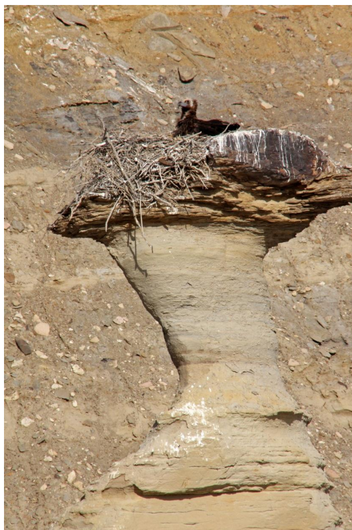
Cinereous Vulture ( Aegypius monachus ) on the nest in 24/04/2011; in 2016 this nest was abundant.