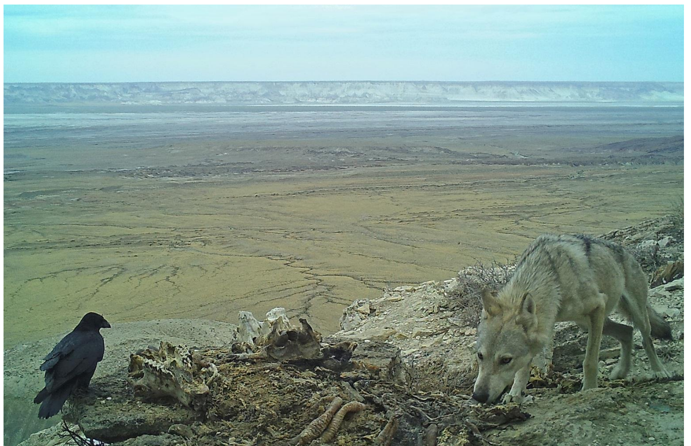
Common Ravens ( Corvus corax ) and Wolf ( Canis lupus ) are food competitors for vultures at the feeding site.