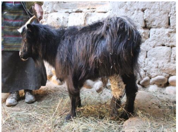
Kill site shed within village.