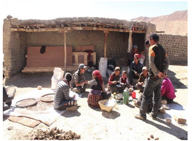
Focus Group discussion at Gara. FGD at Marang.

Social survey: So far, we have done interview survey with the livestock owners in two out of remaining three VDCs of Mustang District and conducted a questionnaire survey, semi-structured interviews and a group discussion with local herders and pastoral communities to identify the extent and nature of livestock losses due to snow leopard and their perception towards snow leopard conservation in Surkhang and Ghami VDC. A total of 60 respondents were interviewed.