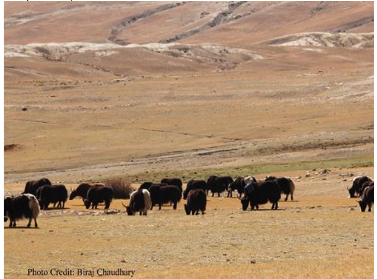
Yak in its pasture where snow leopard depredation is very high.