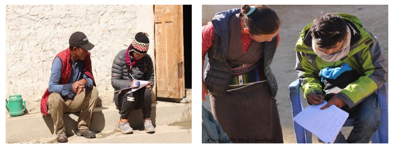
Data collection.

Social survey: So far, we have done interview survey with the livestock owners in two out of remaining three VDCs of Mustang District and conducted a questionnaire survey, semi-structured interviews and a group discussion with local herders and pastoral communities to identify the extent and nature of livestock losses due to snow leopard and their perception towards snow leopard conservation in Surkhang and Ghami VDC. A total of 60 respondents were interviewed.