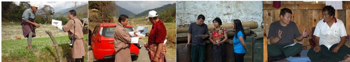
Interviewing local people