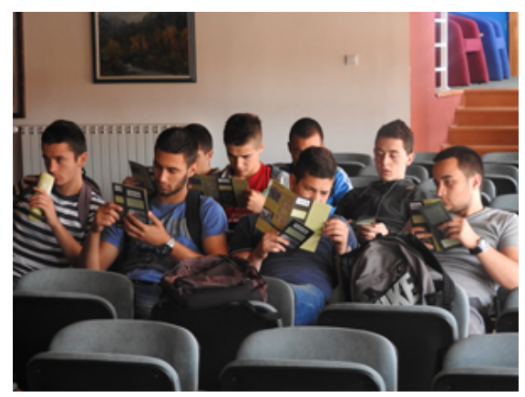
Fig 5. Lecture at high school