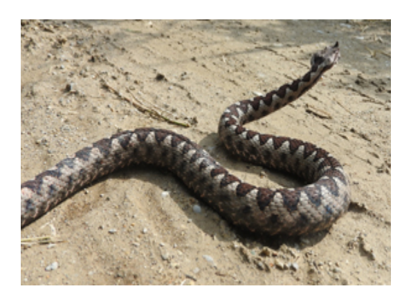
Fig 1. Nose-horned viper after measurement

Apart from this activities we gave lectures in primary school "Vuk Karadžić" in Donji Milanovac (in "Djerdap" National Park) and in high school for foresters "Šumarska škola" in Kraljevo. We also distributed leaflets, brochures and posters in these two schools. The lecture in Kraljevo was organised with the help of NGO KAPD "Balkan" from Kraljevo. I also formed a Facebook page for our project on address: https://www.facebook.com/sacuvajmoposkoka/