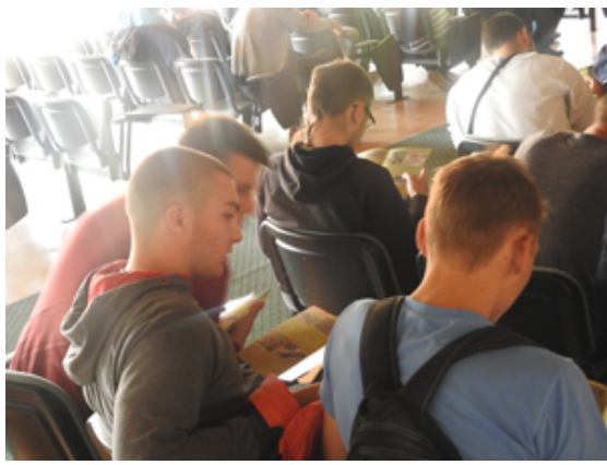
Fig 6. Lecture at high school