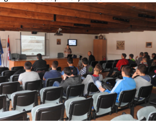
Fig 4. Lecture at high school