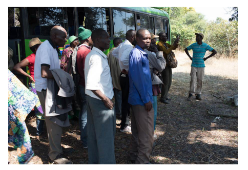
Local community in Katavi National Park

from Mpimbwe to visit the park and interact with the park authorities, where they got a chance to discuss the importance of national parks and different ways that they can collaborate to protect the wildlife in it. During the "Day in the Park", participants visit many of Katavi's finest sites, including Lake Chada where the Mpimbwe god 'Katabi' is thought to herd his hippopotami. They are also given presentations by Tanzania National Park staff sergeants and rangers in which they learn about the benefits of national parks.