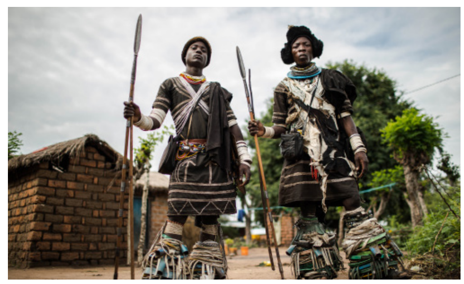
Lion dancers (killers) at Usevya village