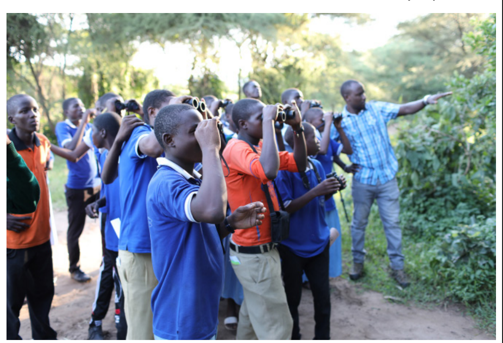
Youth using binoculars donated by UCDavis during the outdoor learning activities.