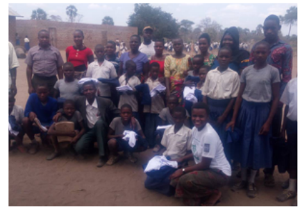
Former lion killers students and their parents

(shirts and trousers or skirts, pen and exercise books). Next year, we will support 200 primary and secondary pupils in Mpimbwe extending support to other school requirements like sustainable water reservoirs, classrooms, furniture and books to create a conducive environment to retain children in school as well as motivate them towards a hopeful future.