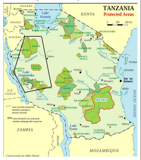
Map showing areas that WASIMA will be expanding to