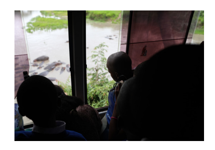
Youth watching Hippos from the bus during the Day in the Park.

Despite living on its doorstep, few local community members have ever visited Katavi National Park. Each year, we support and organize community members from villages bordering KNP to visit the Park through a "Day in the Park" program. The goal of the program is to give locals a chance to learn about wildlife and develop positive interactions with park staff. In 2017, we were able to take 180 youths, 30 former lion killers, 60 community leaders and 60 traditional medicinal practitioners