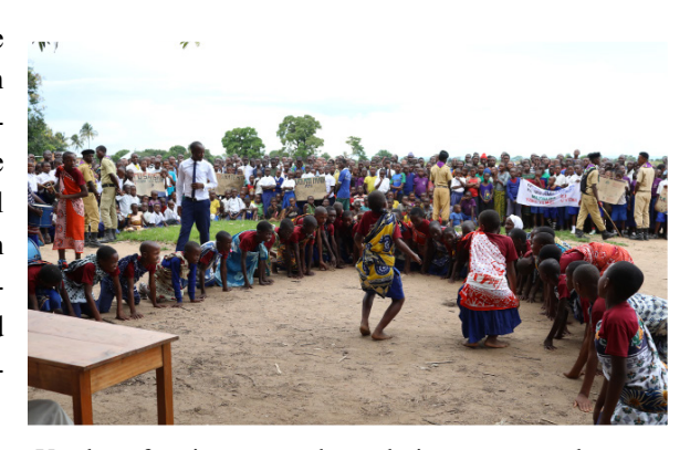
Youth performing ngoma dance during our outreach event

in public in order to spread conservation messages through singing, drama, and dancing. Our last event was conducted on March 10, 2017 when more than 2000 community members attended. The project has been working with 5 schools so far and established 3 registered village youth environment clubs.