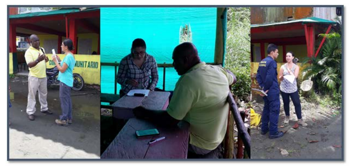
Interviews made by the team of the project to representatives of the entities of the CVC, the Community Council of La Barra and the National Navy.