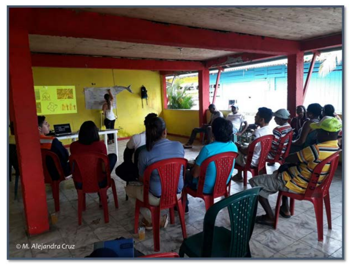
Workshop session with the assistants of the different entities and groups.