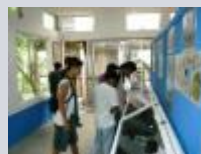
Inauguration day at the museum.