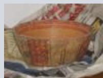
Mayan artifacts in our museum see more 2007 photos