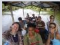
Field trip to El Peru-Waka archeological site.