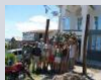
Group photo (Sept.) see more 2007 photos