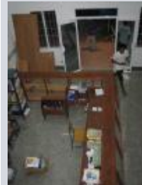
Birds-eye view of the librarian's area in the new library.