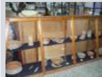
Mayan Archeological museum in the community library!