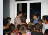
Opening ceremony of new library