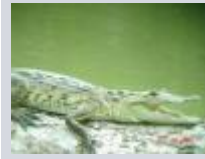
Duffy the Croc has grown!