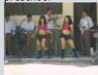
Inauguration of new High School