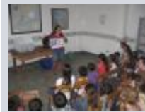
Teaching in the Library see more 2008 photos