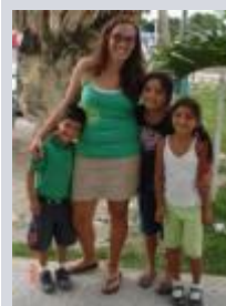
JD and the crew see more 2008 photos