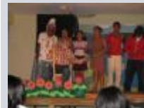
San Andres Theater 2008