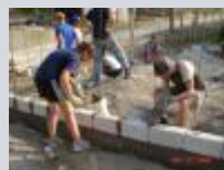
laying block at the new preschool