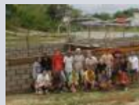
Group at the new preschool