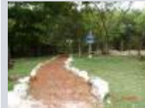
New trail system throughout park.