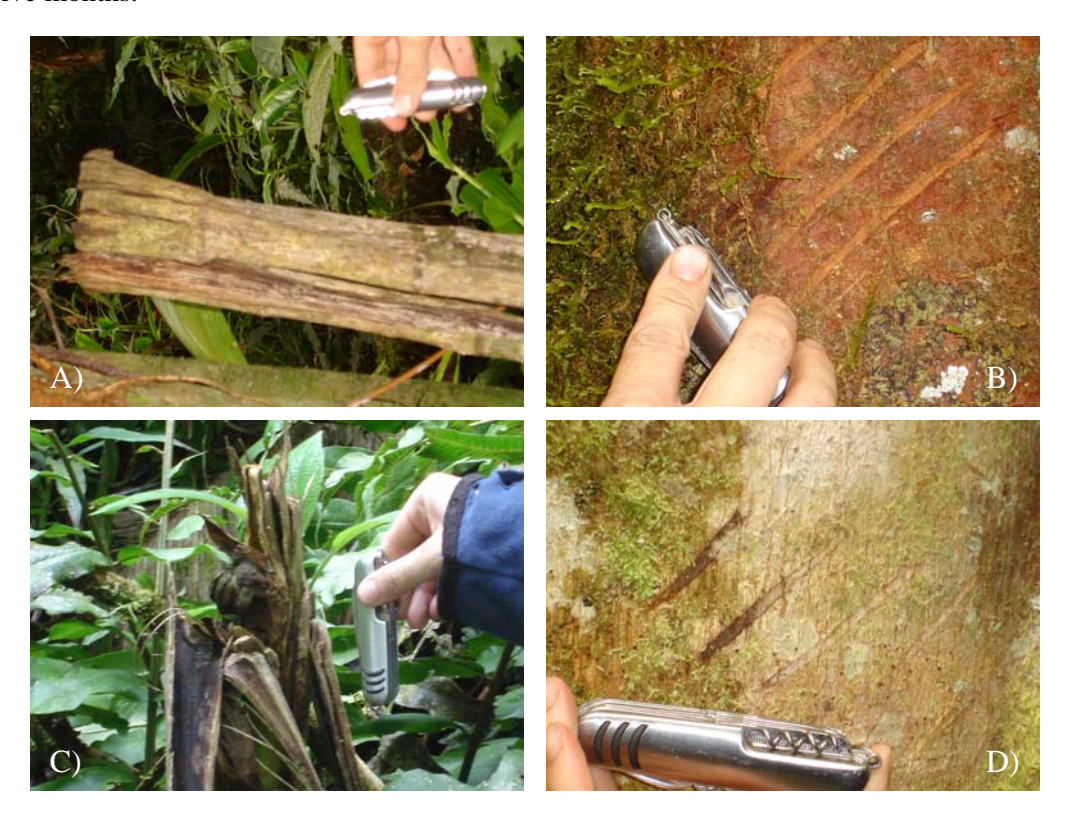
Figure 4.- Andean bear signs of the Sign Aging Project: A) Macanilla ( Wettinia praemorsa ) no longer distinguish as bear-sign after eleven months. B) Andean bear deep claw-mark distinguishable as bear-sign after twelve months. C) Palmiche ( Geonoma undata ) distinguishable as bear-sign after twelve months. D) Andean bear deep claw-mark distinguishable as bear-sign after twelve months.

Continuing with the activities started on August 2005, a monthly visit was conducted to the Sign Aging Project set in Cubiro, by the project team as a whole. Eaten bromeliads, Mapora ( Prestoea acuminata ) palm trees, rubbing trees, day-beds, superficial claw-marks, tracks, scats, hairs and some bitten roots were no longer distinguishable as bear-signs after six months (See Figure 4). The visits concluded after on year survey, and only deep claw-marks on trees and some palm tress of the Geonoma and Wettinia genera were identify as bears-signs until the end (See Figure 4).