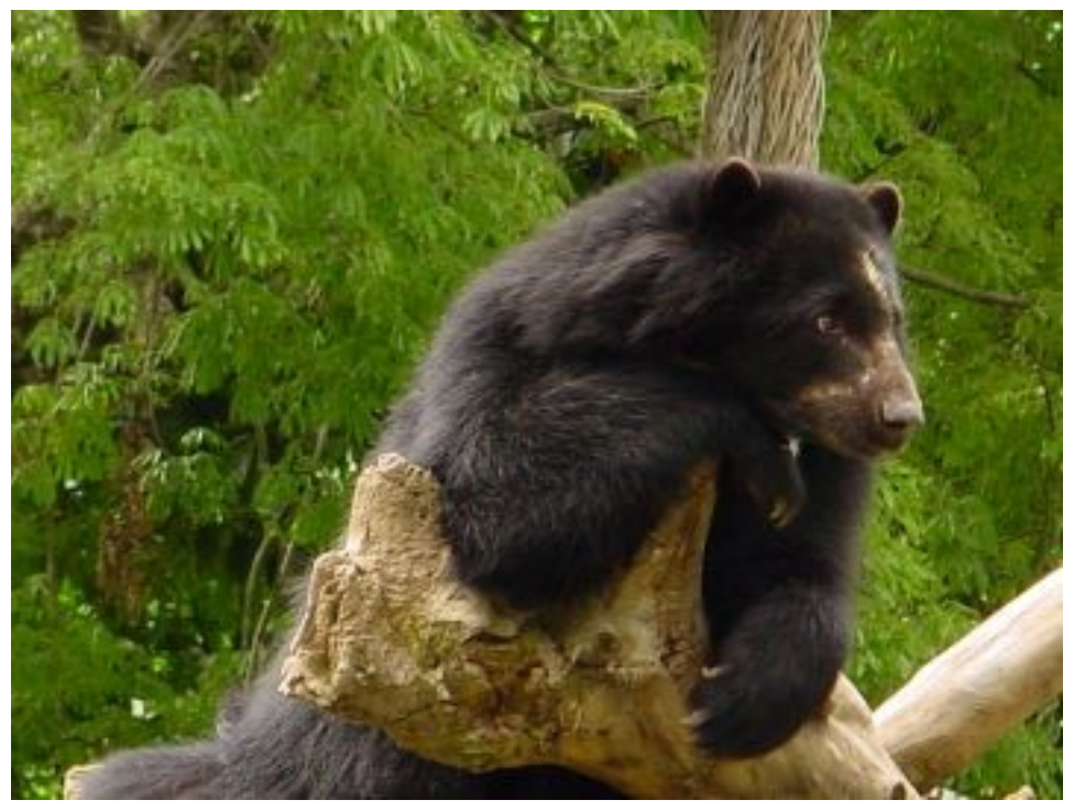
Andean bear (Tremarctos ornatus) (Lizcano, 2003)

EVALUATING THE CONSERVATION STATUS OF THE THREATENED ANDEAN BEAR ( Tremarctos ornatus ) in Sierra de Portuguesa, Venezuelan Andes: Designing a management strategy.