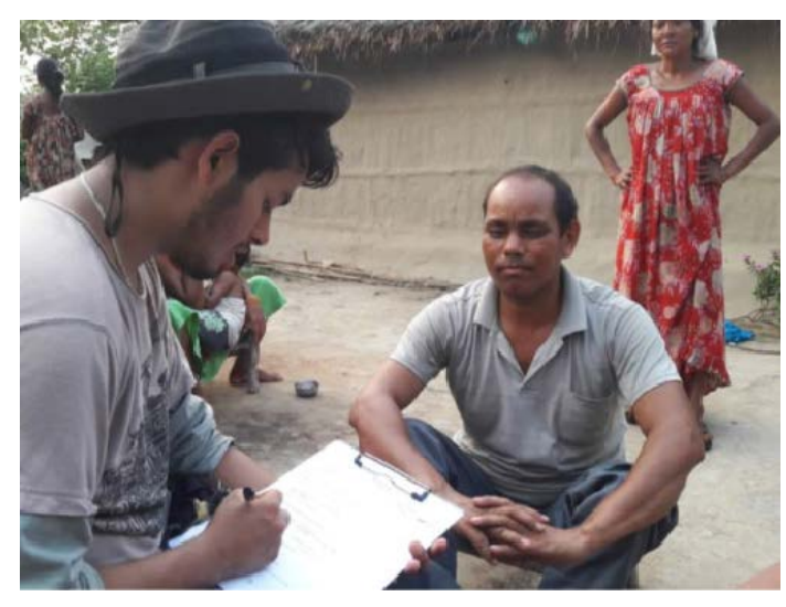
house Surveyor conducting household survey.

collected data about the compensation received by the villagers from national park authority. Meanwhile we are analyzing complete data to map spatial and temporal patterns of human-wildlife conflict in Bardia National Park.