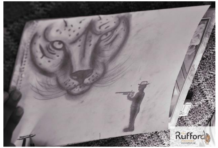
Art by one of the students who participated in the drawing competition

Student creating the art in the drawing competition