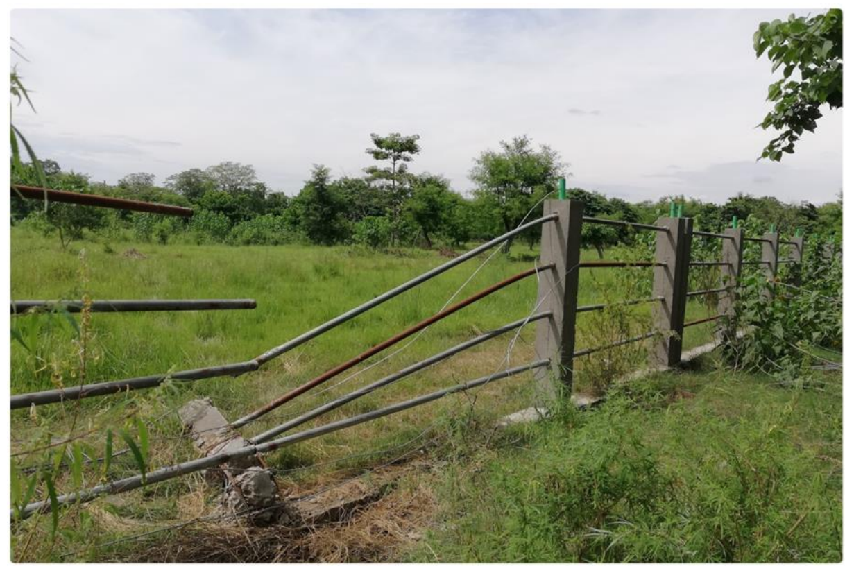
Failure of Human Wildlife Conflict in buffer zone area