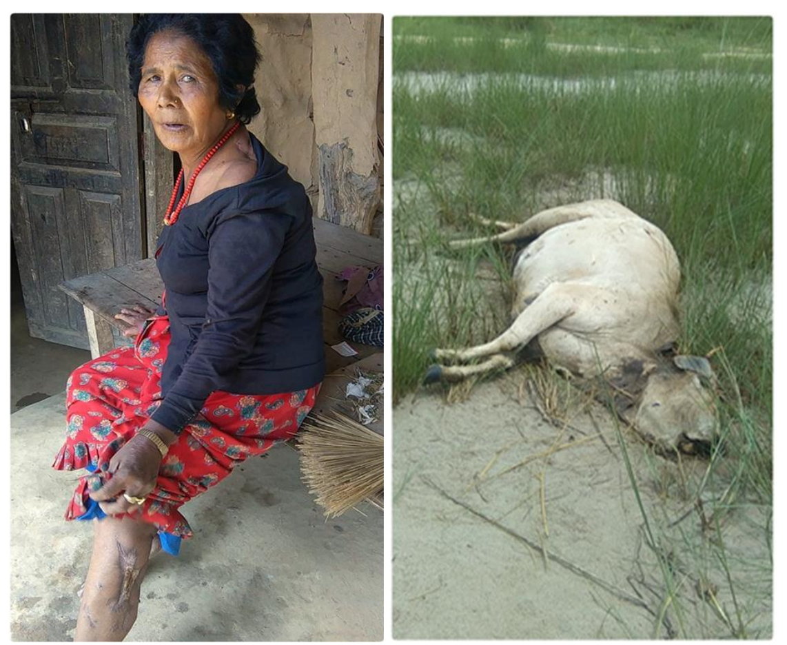
Left: Local Women from Khata Corridor showing her wound, she was attacked by leopard in the forest recently. Right: An OX killed by a tiger in the buffer zone forest of Bardiya National Park