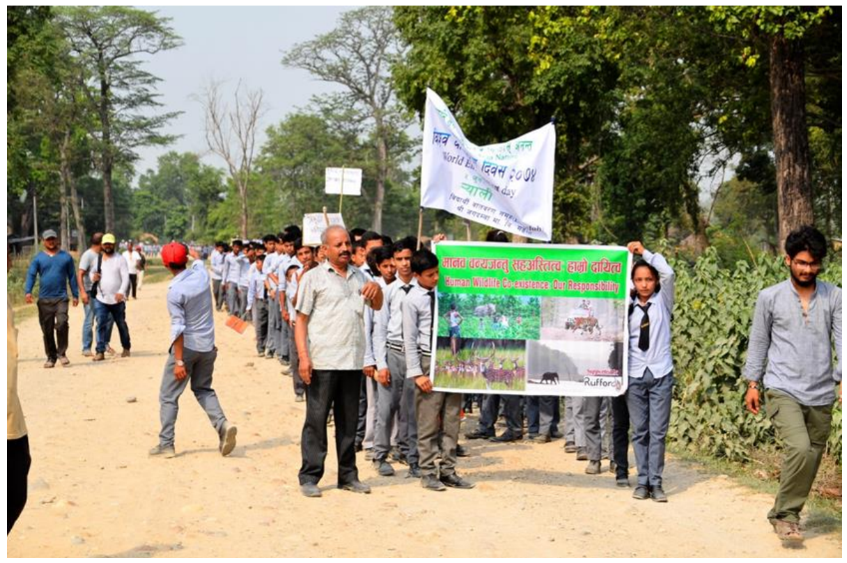
Students participating in HWC awareness campaign