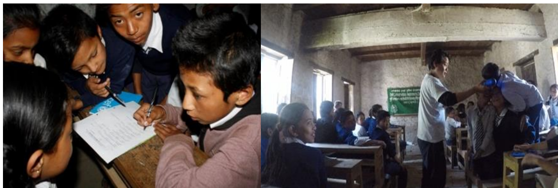
Activities during school based owl conservation awareness camps in eastern Nepal

School level owl conservation awareness camps started with quick survey on owls. This included questions of students seeing or hearing owls, killing of owls, owning catapults and such. It was followed by filling up of pre-evaluation form by groups of students. After this, different owl sounds were played via external speakers. Then, characteristics of owls were described followed by reasons why owls are important and why they should be conserved. Then, the students were told about threats to owl in Nepal and what can be done to conserve them. They were also instructed what to do in case of injured or captive owls. Finally, they were given post-evaluation form to be filled collectively by groups.