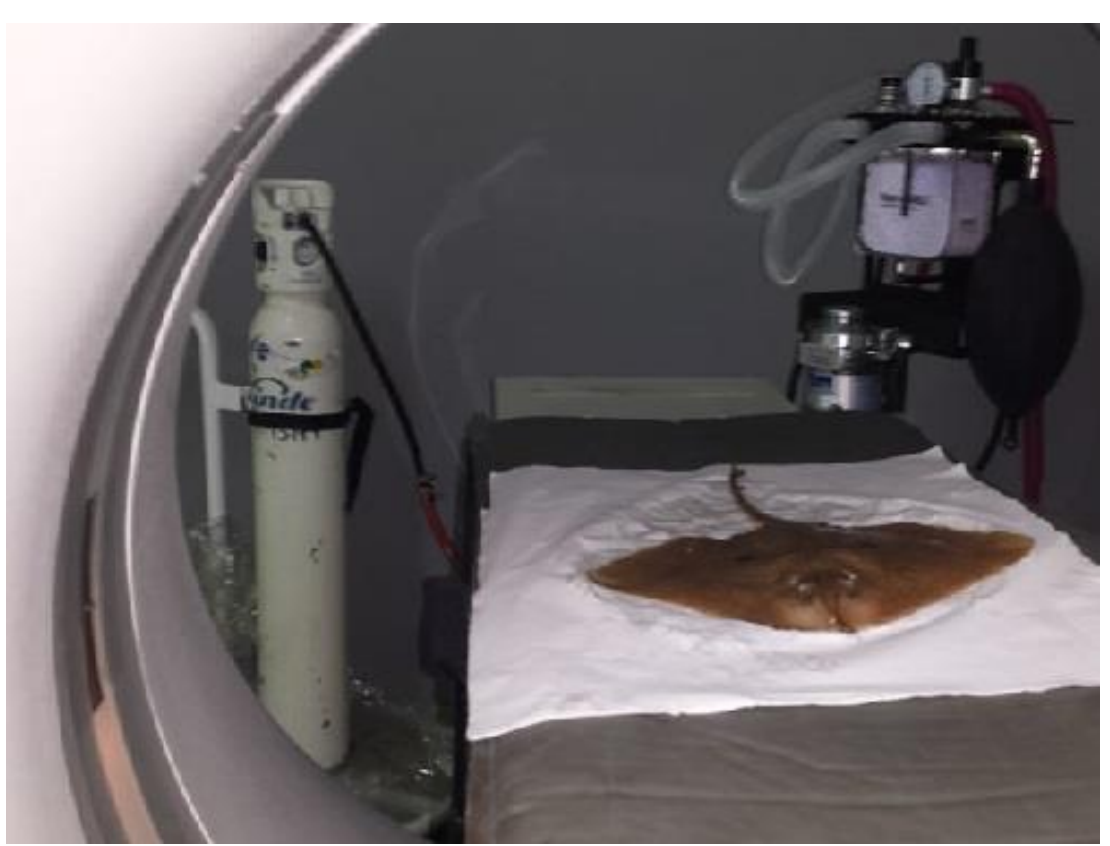
Raja miraletus (L.), by-catch from the Neum bay, used for detailed axial computed tomography analysis at the Faculty of Veterinary Medicine.