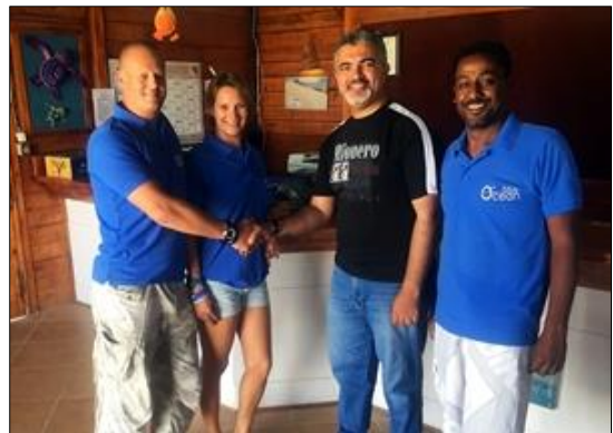
Fig 2 and 3: First meeting with stakeholders of Blue Ocean Diving center