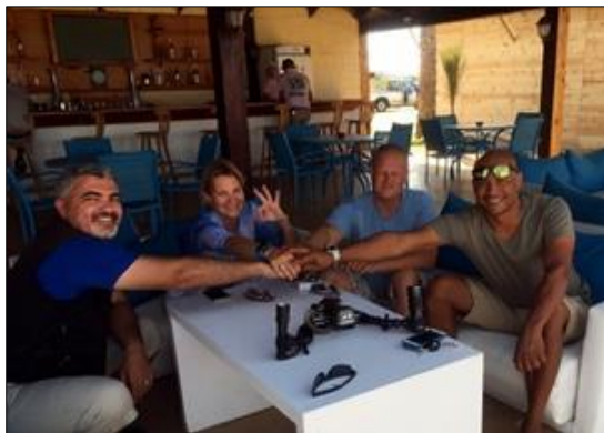
Fig 4 and 5: Second meeting with stakeholders of Blue Ocean Diving center