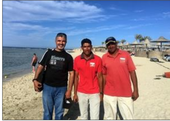
Fig 7: Meeting with Solymar Abo Dabbab Resort