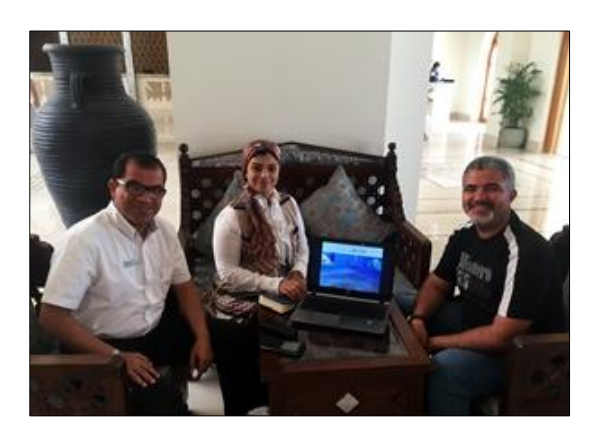
Fig 1: First meeting with stakeholders of Hilton Marsa Alam Nubian Resort

For preparation and enrol the stakeholders in the project, one meeting was conducted with marketing and security manager of Hilton Marsa Alam Nubian Resort (Fig 1). Two meeting was conducted with the marketing and diving managers of Blue Ocean diving centre (fig 2 to 5) at Marsa Abo Dabbab, one of the main diving centres at Marsa Abo Dabbab, the main popular site for the dugong in Marsa Alam. Another meeting was conducted with Diving De diving centres (Fig 6) and another meeting with the recreational manager of Solymar Abo Dabbab Resort (Fig 7) at Marsa Abo Dabbab.