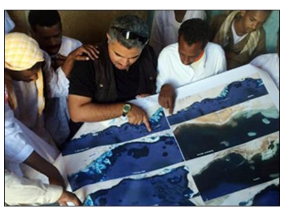
Figure 2: Conducting questionnaire survey with fishermen at Tondoba village