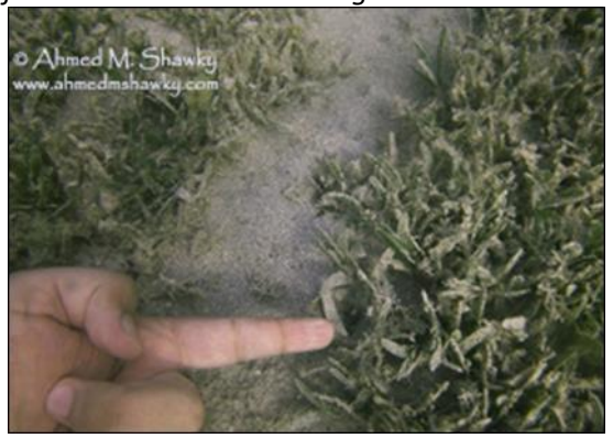
Figure 4: Feeding trail for small dugong