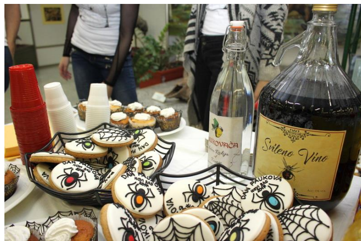
Cocktail food and drink – specially designed for the event The Spider Day