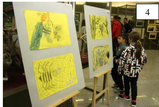
Photo 1, 2, 3, 4 – programme for children with workshops and exhibitions at the event The Spider day.