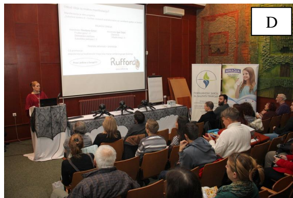
Photo A, B, C, D – program for adults with logo of the event The Spider day.

For children, workshops and competitions were organised. The mosaic and graphic art from The Vocational School of Design “Bogdan Šuput”, Novi Sad were exhibited as were the drawings of primary school children “Petefi Sandor”. Photo exhibition was also provided. These were work of professional nature lovers.