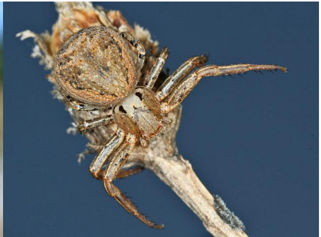
Left: Argiope lobata . Right: Xysticus kochi