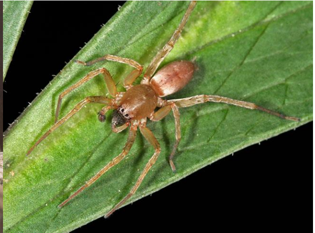
Left: Agalenatea redii . Right: Clubiona terrestris