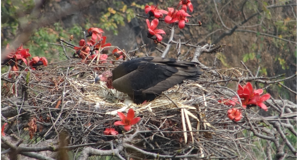
Male Red-headed vulture protecting egg in the nest.

before it was declared as community forest). Their nesting behaviour was observed and noted down. An egg was found to be incubated by a pair of vultures alternately one after another. The juvenile of red-headed vulture was successfully hatched from egg in the nest and it was ready to fly in the first week of June 2018.