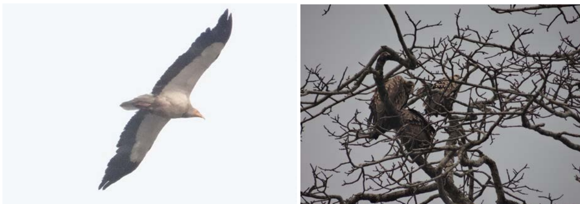
Left: Egyptian vulture. Right: Himalayan Griffon.

Maximum population of vulture along MTR in Dhorfirdi was noted to be 30 and minimum six. Altogether, six species of vultures were observed during the transect survey in March 2018 i.e. red headed vulture ( Sarcogyps calvus ), Egyptian vulture ( Neophron percnopterus ), white-rumped vulture ( Gyps bengalensis ), Himalayan griffon ( Gyps himalayensis ), Eurasian griffon ( Gyps fulvus ) and slender-billed vulture ( Gyps tenuirostris ).