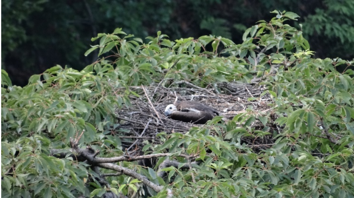
Juvenile Red-haded vulture at nest.