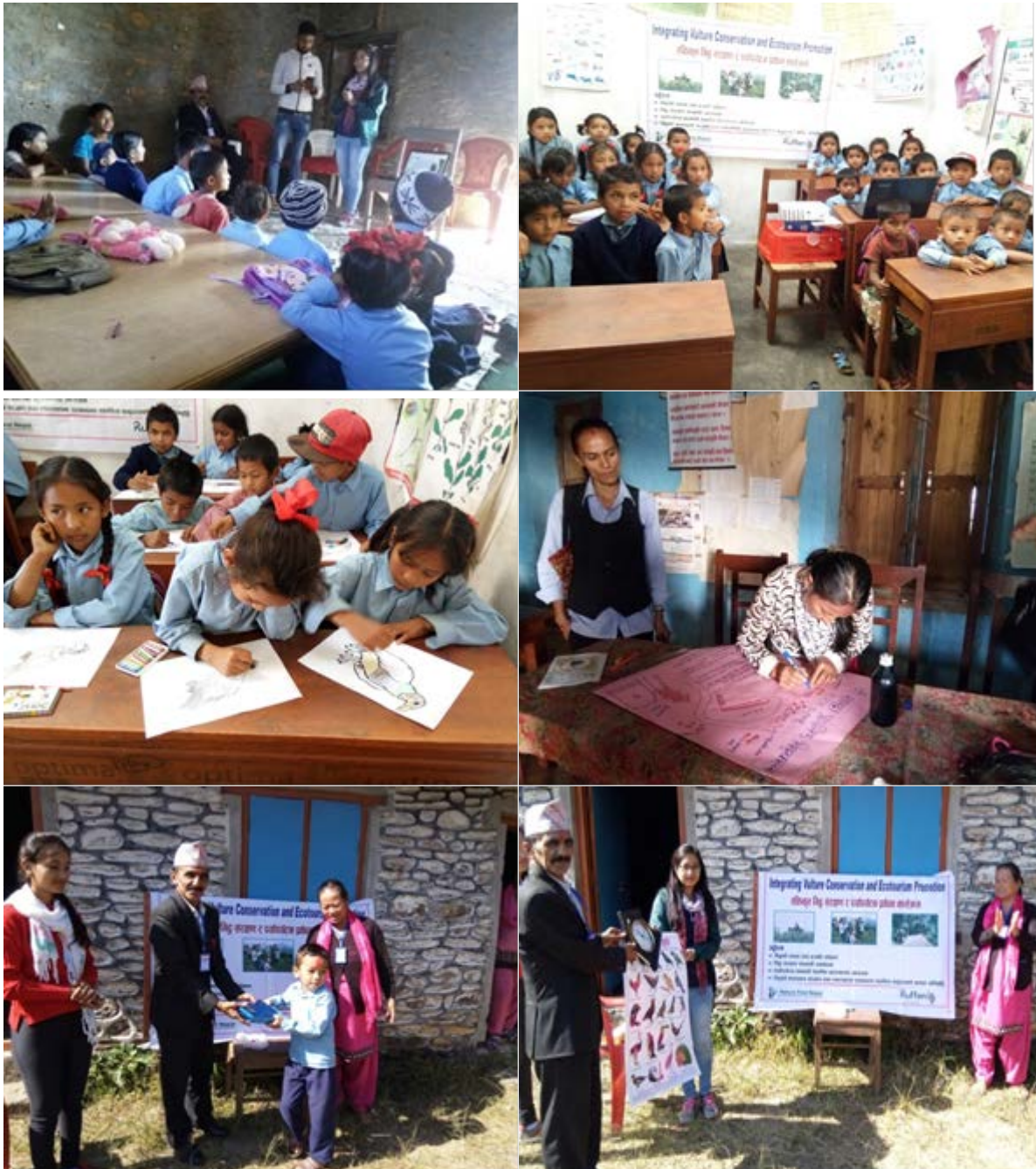
School awareness program activities.