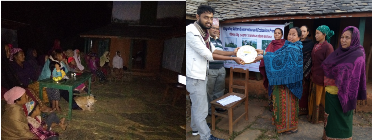
Community awareness activities.

the programme was fruitful which made them aware about status and importance of vulture and they were also interested in vulture conservation and ecotourism promotion in their area.