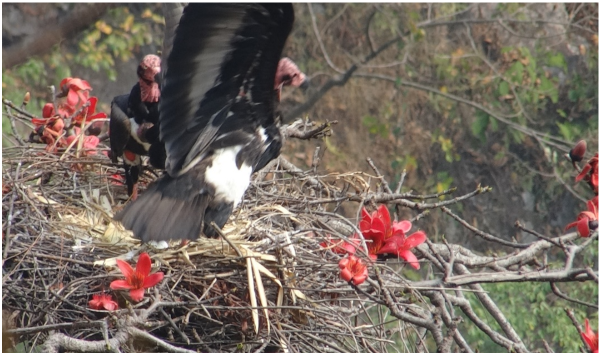
Male and female Red-headed vultures during incubation period in the nest.