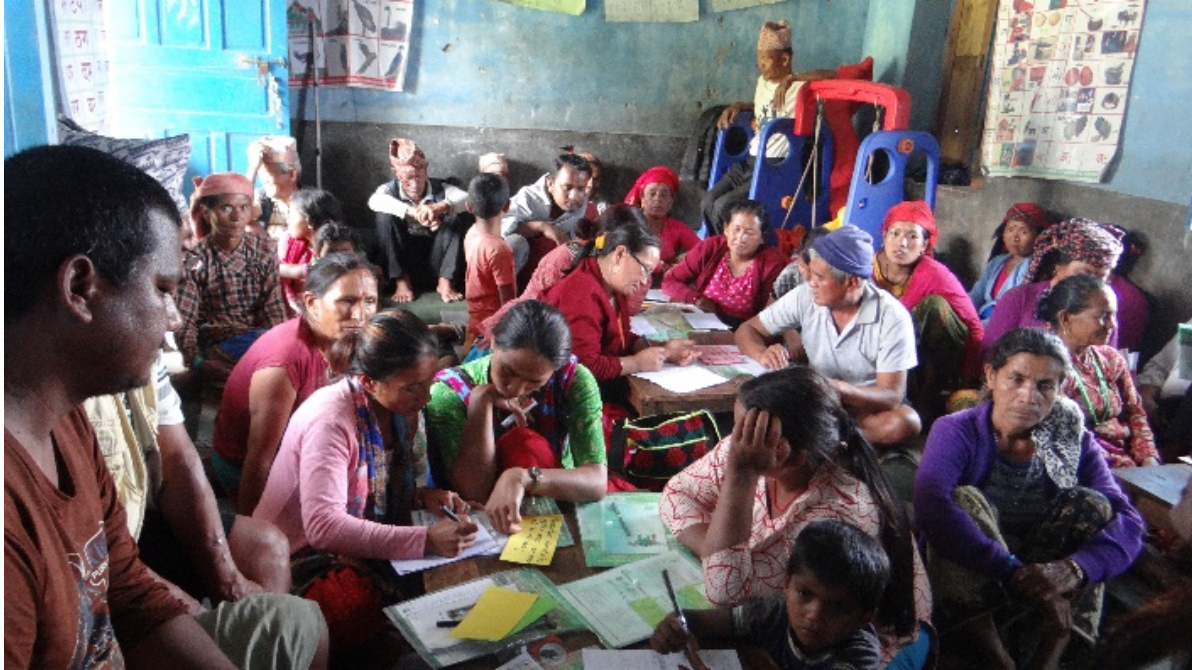
Training cum workshop activities.