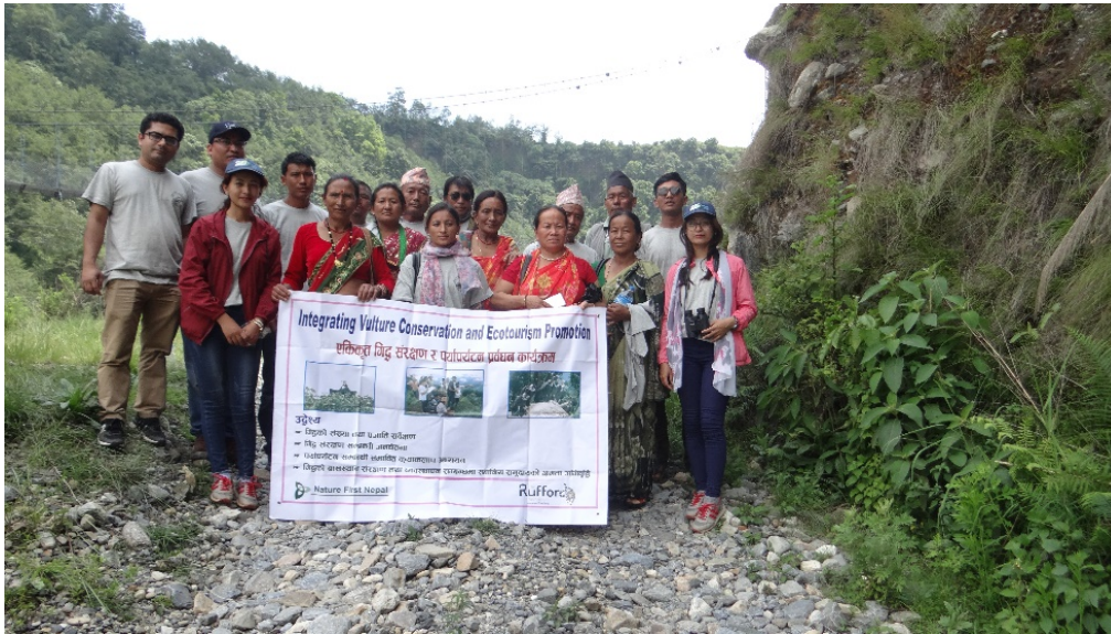
Activities during exposure visit to Ghachwok Vulture Restaurant.