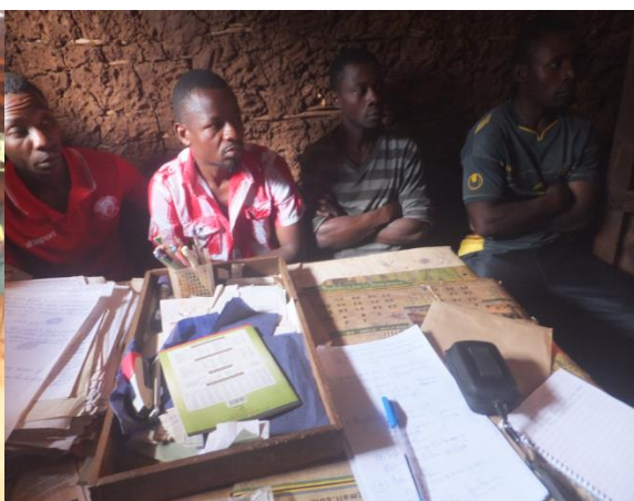
Some of villagers attended an inception meeting at Kilangangua (left) and Kwemkole (right)