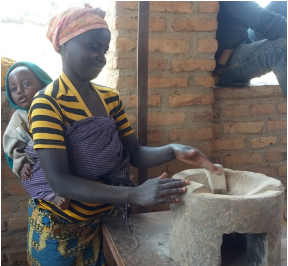
One of cooperative potters explaining how this stove functions

Now, in partnership with the district office and trained partners, the project team is conducting 13 community outreaches to create forest conservation awareness and demonstrate the installation and use of the improved stove.