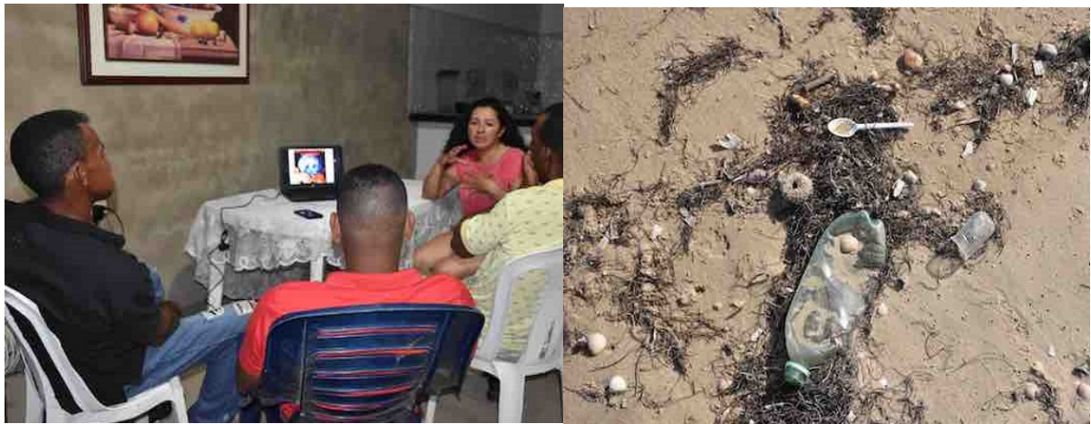
Left: Environmental education with fishermen. Right: Garbage on the beach

During May 2018, we conducted environmental education only with some fishermen. We did workshops with them talking about our preliminary results from last year, and our conservation initiative related to garbage management and the marine ecosystem protection. We also had a meeting with the local environmental corporation CORPOGUAJIRA, in which we could present our preliminary results, highlighting the importance of La Guajira for dolphins. They are the most important local environmental authority, and we established with them a good link to collaborate in the development of future management plans. The results of this meeting were positive, and it is possible that we can work together in the long-term on conservation of cetaceans, ecosystems, and local communities.