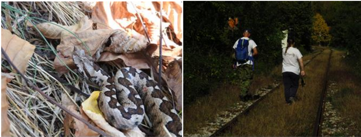
Left: Male nose-horned viper in his habitat. Right: In search for vipers

As our field activities finished due to viper's hibernation, at the moment we are in process of analysing our data and conducting research about venom markets in the literature data.