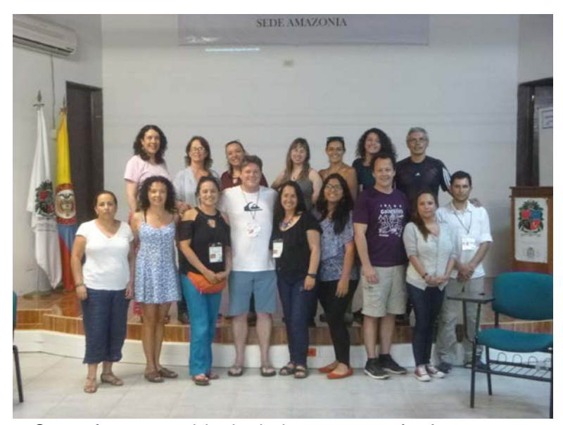
Group of experts participating in the assessment for A. nancymaae

28-30 November 2017: Workshop "Exchange of information and experiences regarding the status and threats of Aotus nancymaae in Colombia" – Leticia. We gave an oral presentation providing the most recent threats facingthis species at the Colombian-Peruvian border.