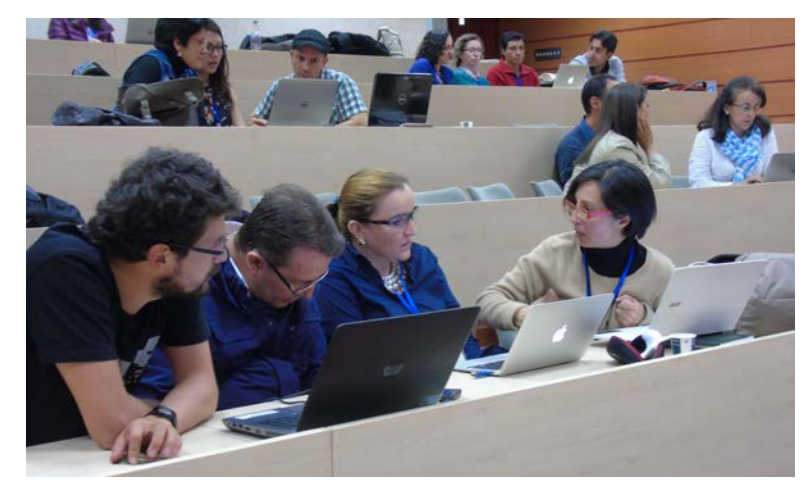
Workshop at the Andes University for the revision of the CSCP with different stakeholders

4. Dissemination of results and other associated work : In the following presentations and workshops Entropika used the Logo of RSG as sponsor.