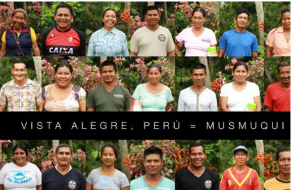
Group of leaders in the WWT project - Peru

<u>Marketing and promotion</u>: With the collaboration of the Calanoa private reserve, Vista Alegre has been included in their promotional material offering a day tour in this community.