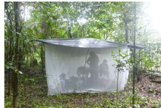
Fieldwork for sampling collection and field laboratory