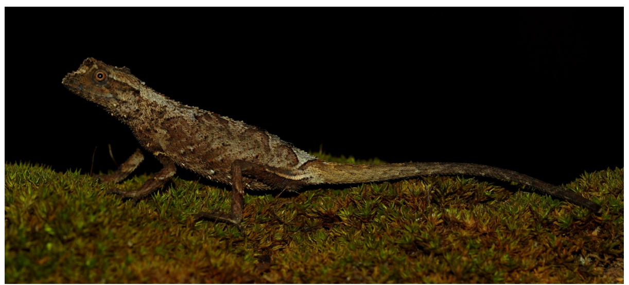
A new species of lizard we discovered (Ceratophora ukuwelai) from Salgala, wet zone of Sri Lanka