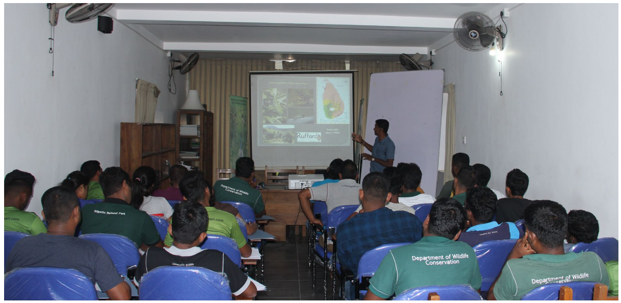
An opportunity for us to conduct workshops and lectures on lizard conservation in Ritigala, Sri Lanka