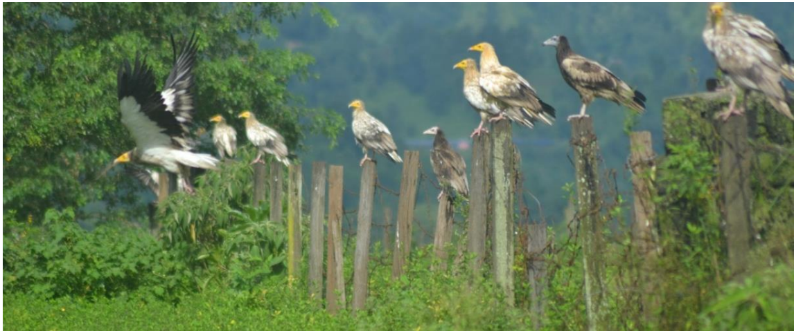
Figure 1: Egyptian vultures near Landfilled site, Pokhara-14 ©Hemanta Dhakal, September 2021