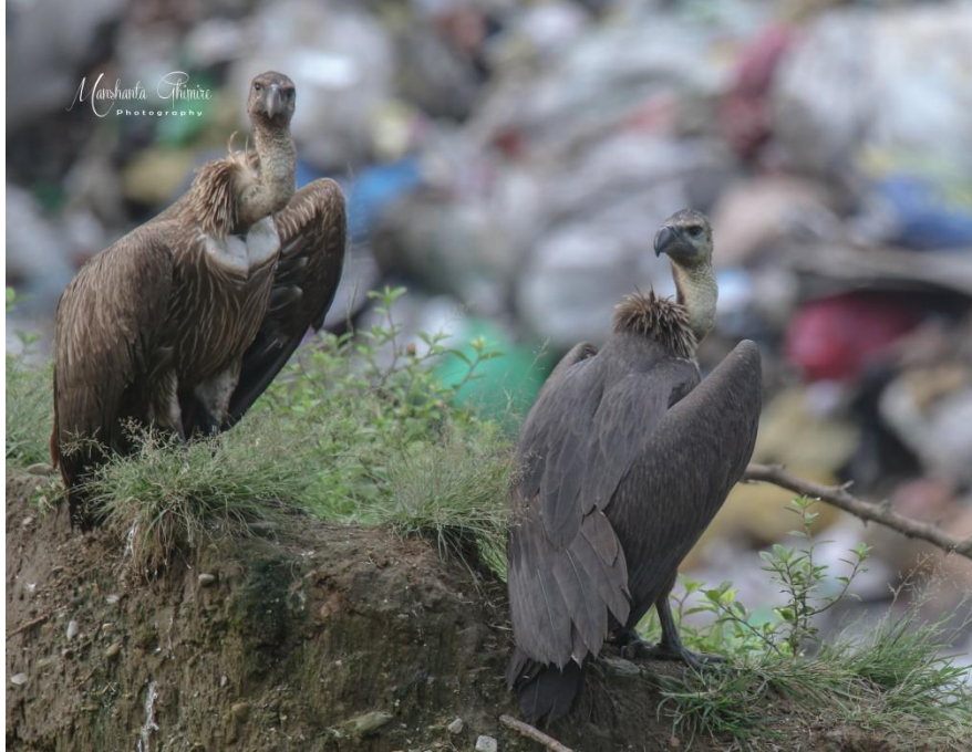
Figure 3: Himalayan Vulture (Sub-Adult) and White-rumped vulture (Sub-Adult).