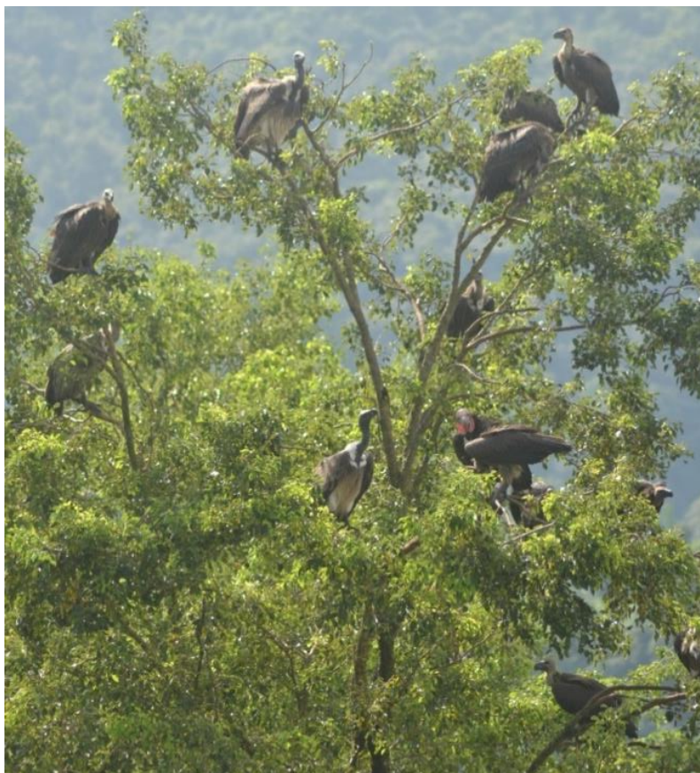
Figure 2: Vultures roosting near land filled site, Pokhara-14