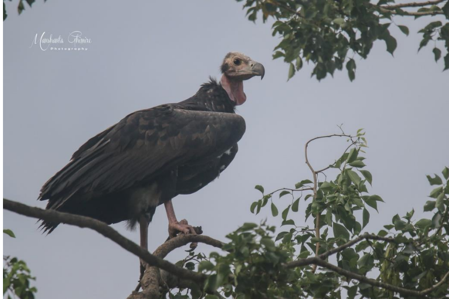
Figure 5: Red-headed Vulture