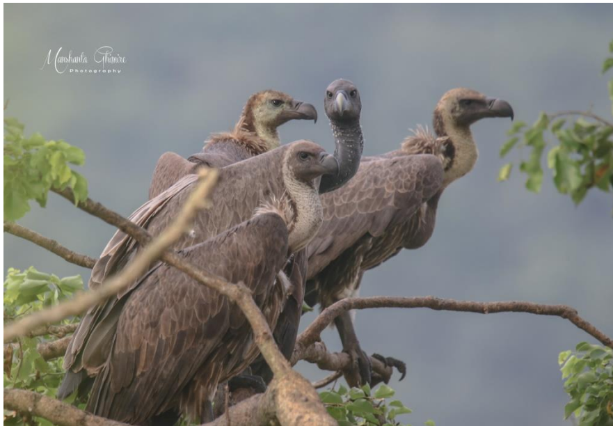
Figure 4: White-rumped Vultures (Sub-Adult) and Slender-billed Vulture (Center, Sub-Adult).