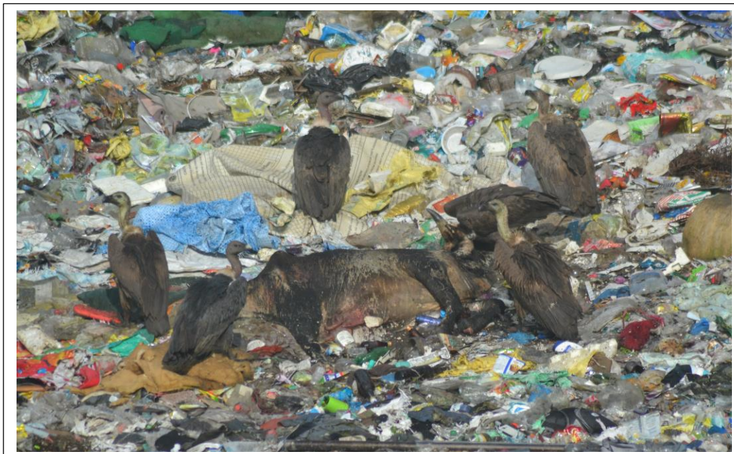
Figure 7: vultures feeding carcass at Landfilled site, Pokhara-14 ©Hemanta Dhakal, September 2021