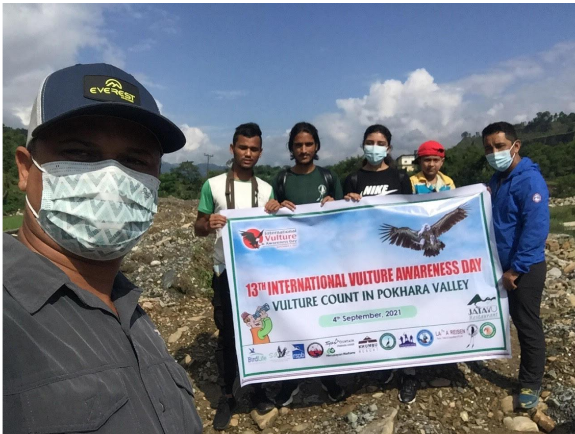
Figure 6: Observers with flex board at Dobilla.