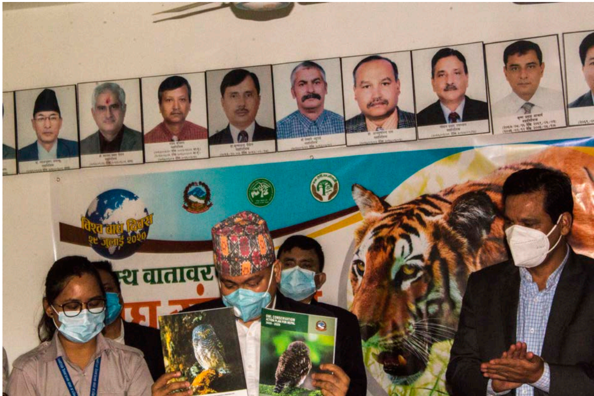
Release of owl conservation action plan by Secretary of Ministry of Forest and Environment