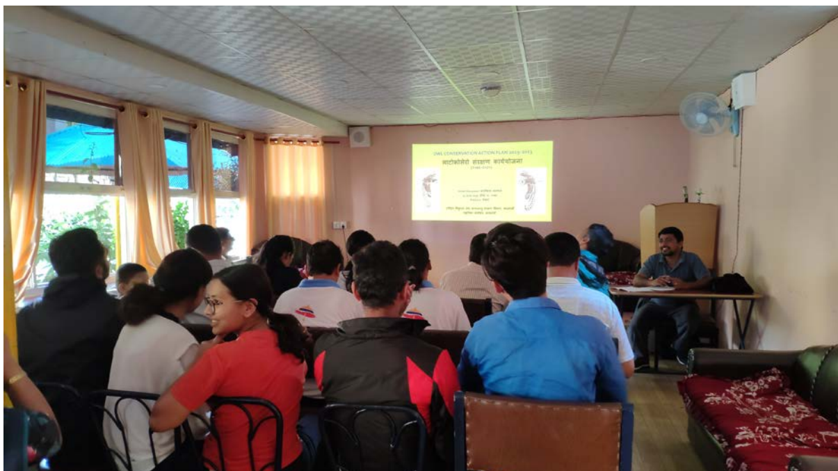
Local workshop at Pokhara

Generating fund for owl research and conservation is not easy in Nepal. Thank you Rufford for funding to date.