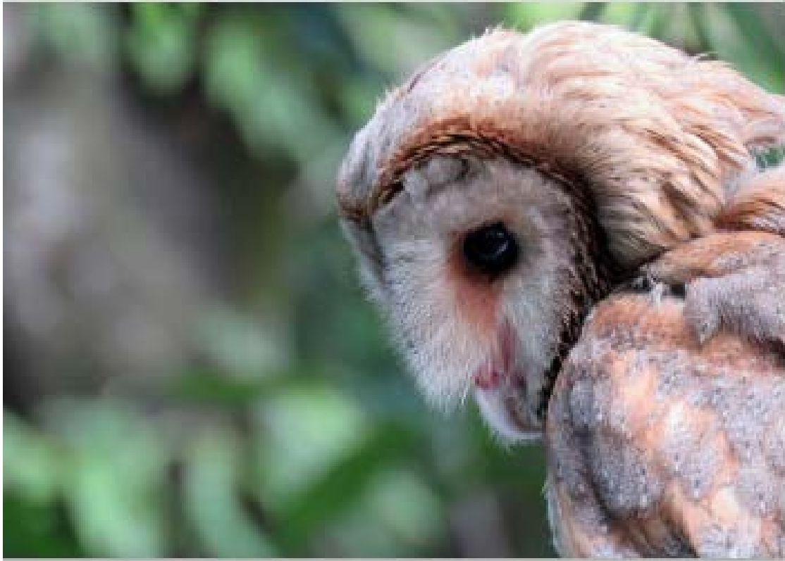
Barn Owl गोठे लाटोकोसेरो