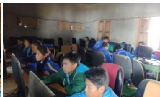
PHOTO: Owl conservation camps in various schools of Khotang district.