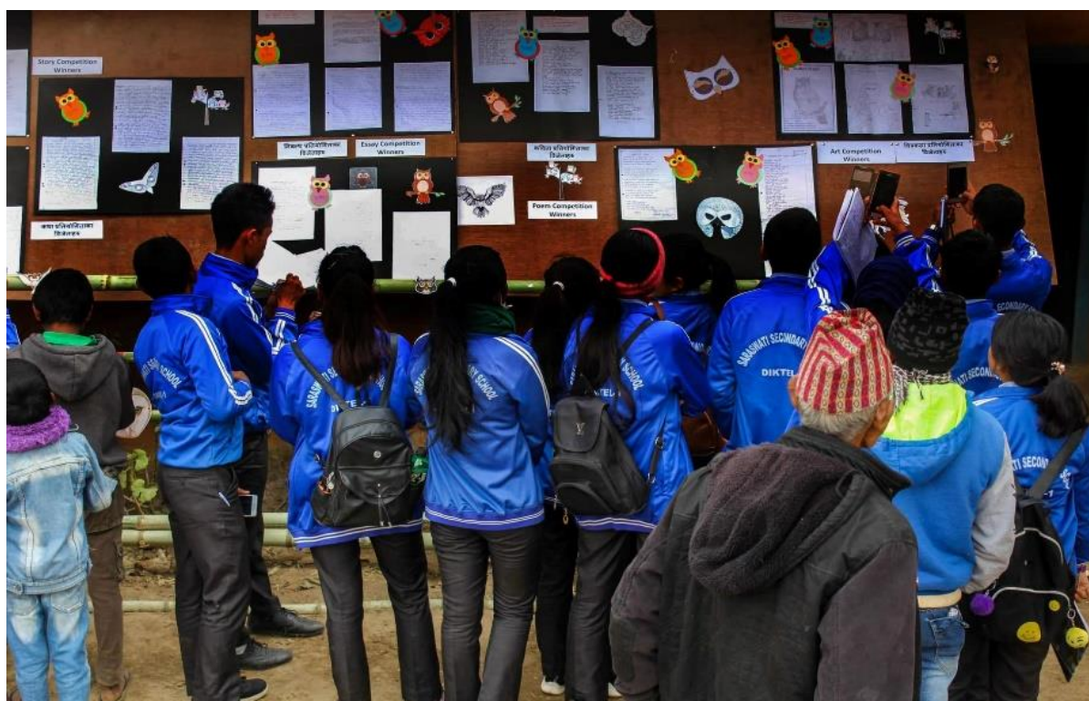
PHOTO: Winning story, essay, poem and art was displayed during the festival.