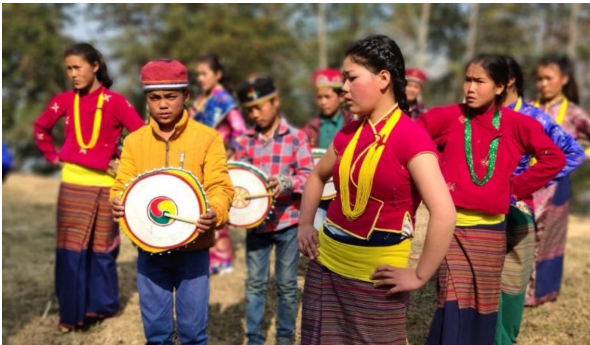
PHOTO: Tamang Selo was performed by the students from Jalapa at Nepal Owl Festival 2019.