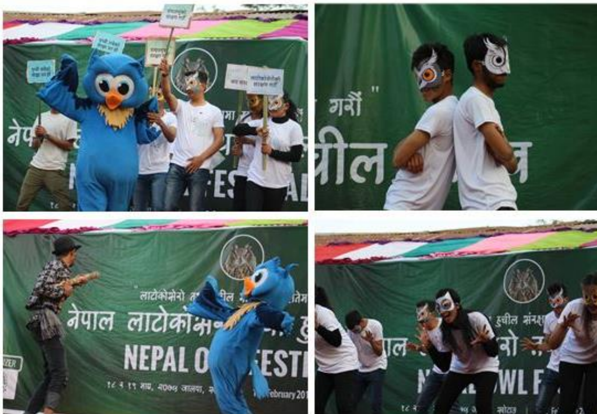
PHOTO: Flash mob performed by IOF students was applauded by huge audience during second day of the festival. Their flash mob ended with short and sweet act and speech on conservation of all the wildlife particularly owls.