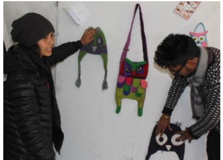
PHOTOS: Volunteers work tirelessly and make the owl museum as a center of attraction at the festival. After four days of complete hard work, volunteers make the museum ready for the visitors.