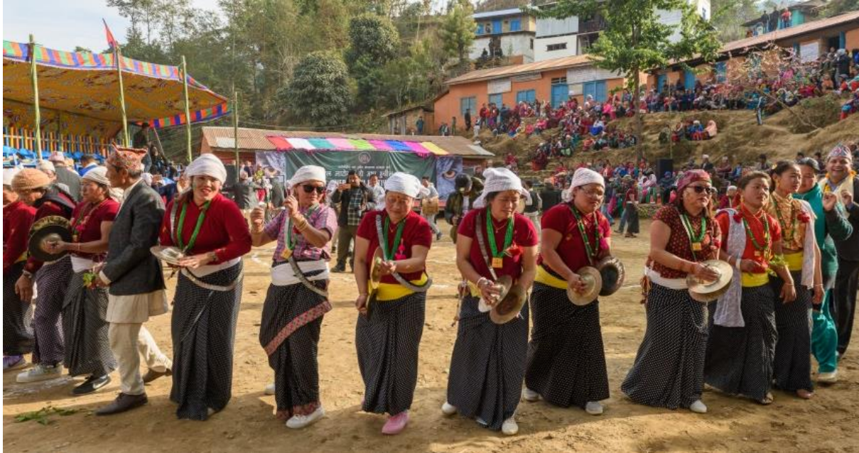
PHOTO: Locals from Rai community performing Sakela silli on first day of Nepal Owl Festival, 2019 at Jalapa.

Although Jalapa has dominant settlement of Rai community, scattered settlements of Newar, Tamang, Sherpa and Gurung have well preserved their culture making the settlement more heterogeneous. During the festival, students and locals performed several cultural dances and songs representing aforementioned cultures.