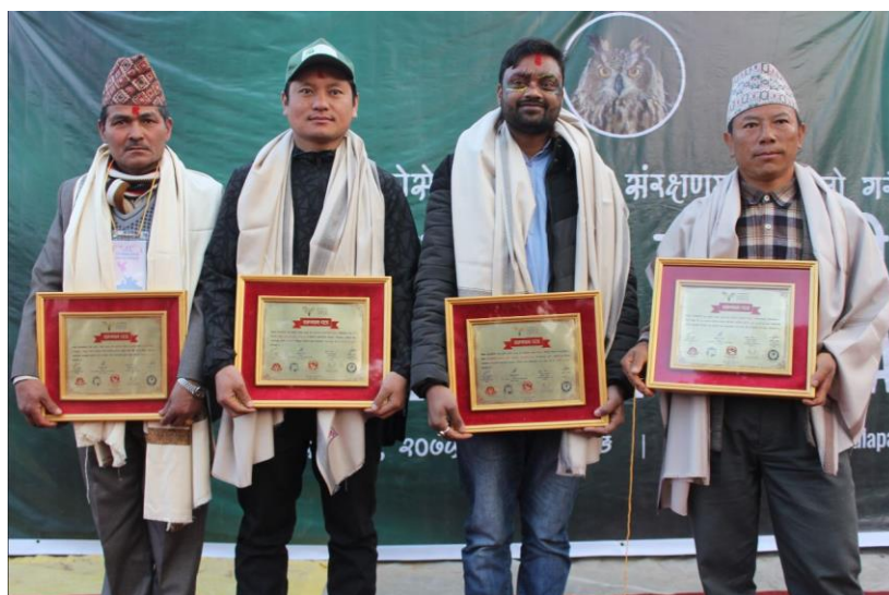
PHOTOS: (From Left) Representatives of Rawa Khola, Tap Khola and Lidung Khola Conservation Forum; Himalayan Nature; Mithila Wildlife Trust and Red Panda Conservation Network Committee

Mithila Wildlife Trust , an organisation based in Mithila Bihari Municipality-3, Dhanusha district, has been in the forefront of wildlife conservation especially their rescue and rehabilitation in central lowlands of Nepal.