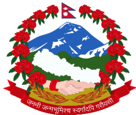
Diktal Rupakot Majhuwagadhi Municipality, Ward No. 12