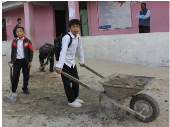
PHOTOS: Making of temporary owl museum begins with arranging furniture and cleaning them. Volunteers including local students make the museum hall as well as its premises clean & attractive.