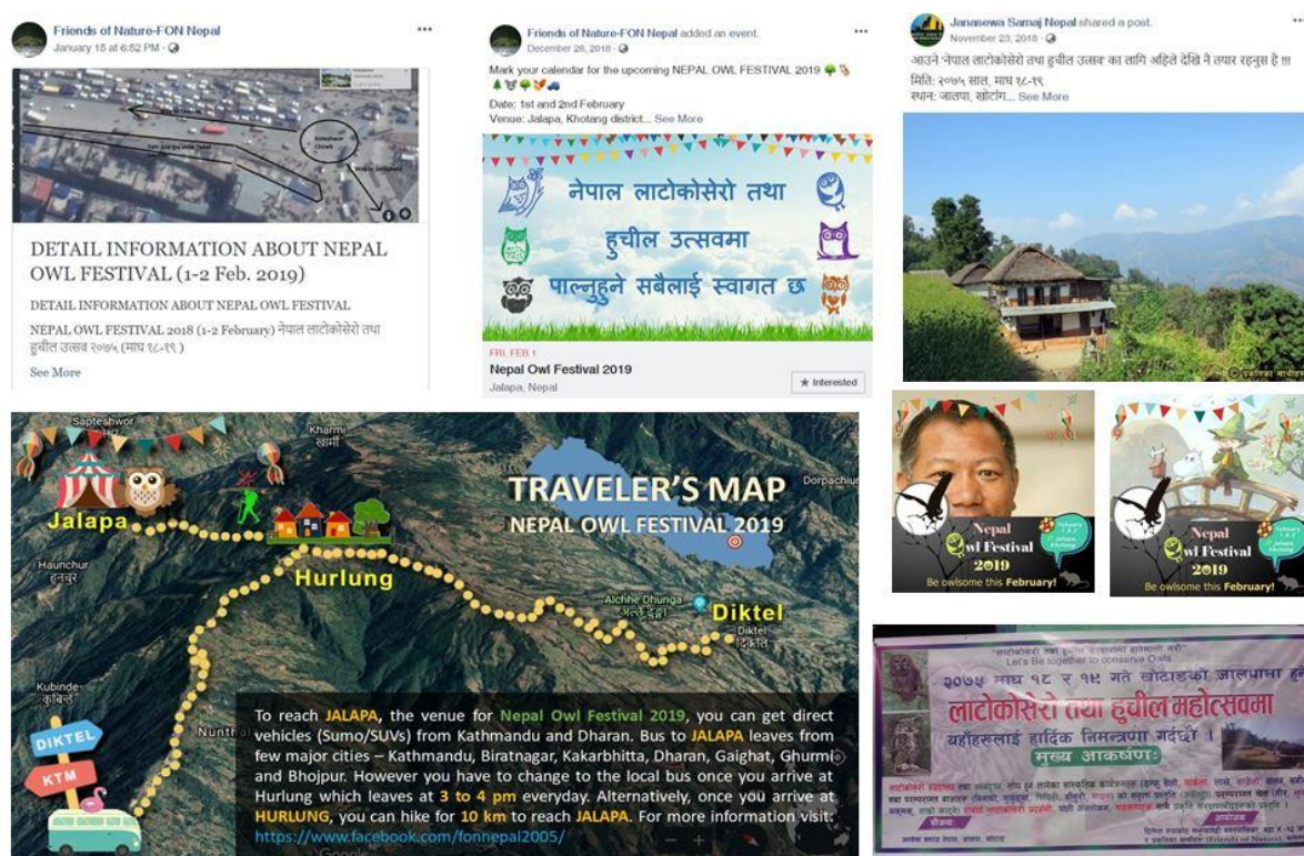
Promotional post of Nepal Owl Festival by Friends of Nature, local organization and individuals

We started the preparation for the festival two months prior to the festival date. After the venue was fixed, we started posting promotional videos and photos about the venue, program description and promotional material of the festival on our official website and Facebook page.