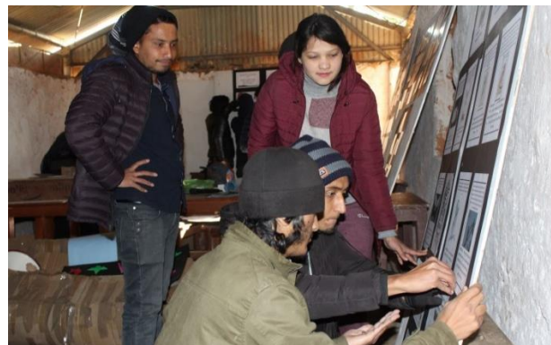
PHOTOS: Unpacking boxes, repairing damaged curios, checking electrics and electronics, cutting, and pasting goes on for next two three days.