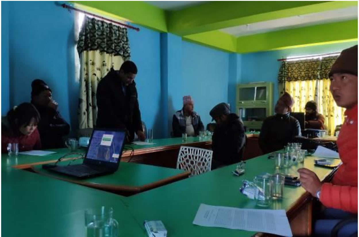
PHOTO: Press conference at Diktel on Nepal Owl Festival 2019

the festival date was approaching. Beside this several banners and information pamphlets were put in location en route to Jalapa from Kathmandu. Local people had prepared the flex print for wall, bus, Jeep and also aired at local FM.