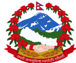
Diktal Rupakot Majhuwagadhi Municipality, Diktal, Khotang