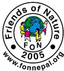
Friends of Nature (FON), Nepal