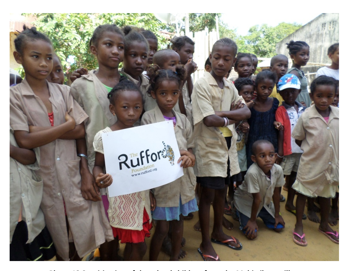
Photo 13 Sensitization of the school children from the Mahitsihazo village