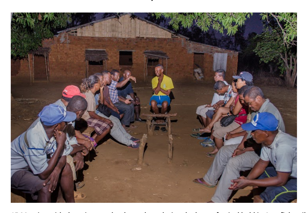
Photo 15 Meeting with the primary schools teachers during the lemur festival held in Antafiabe village