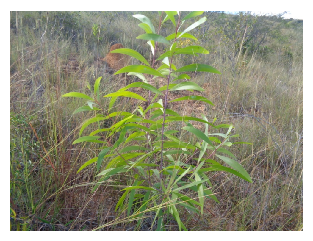
Photo 24 An exotic tree (Acacia) planted surrounding the village of Mahitsihazo