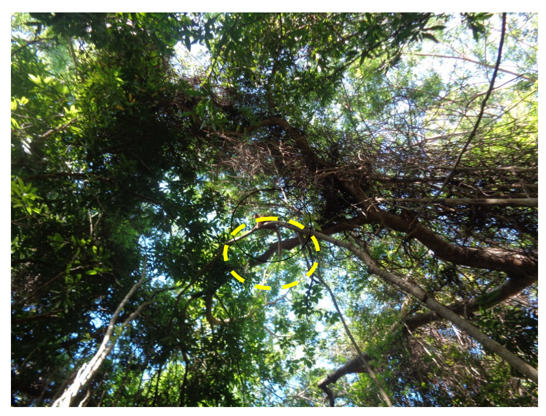
Photo 6 Female blue-eyed black lemur with her baby resting close to the tree canopy

Eight (8) local guides worked in a rotational schedule and 15 days per month. They conducted only diurnal lemur survey including the blue-eyed black lemur (Eulemur flavifrons) and the western lesser bamboo lemur (Hapalemur occidentalis). The guides followed two transects of 1.5km and 2km during each survey. In total, the two transects 150 times during the reporting period. Four (4) groups of western lesser bamboo lemur were counted and the group size ranged from 2 to 4 individuals. Six groups of the blue-eyed black lemur species were recorded within the forest; the mean group size is about 7 individuals. It is noted that we are the first conducting biological research within the forest of Andilambologno thus it is still difficult to find the lemur species are they are still wild. The guides spent more time searching lemur during the dry season as the animal travel a lot for food searching. It is noted that the dry season coincided with the food scarcity. On the other hand, during the rainy which is the fruiting season several groups gathered in one place thus it is easy to find the animal. The forest of Andilambologno is rich in high trees (more than 15m) thus the blueeyed black lemur are travelling or taking rest close to the canopy most of their time. The guides have to use binocular to count the individual in a group. The local guides destroyed 2 lemur traps found within the forest.