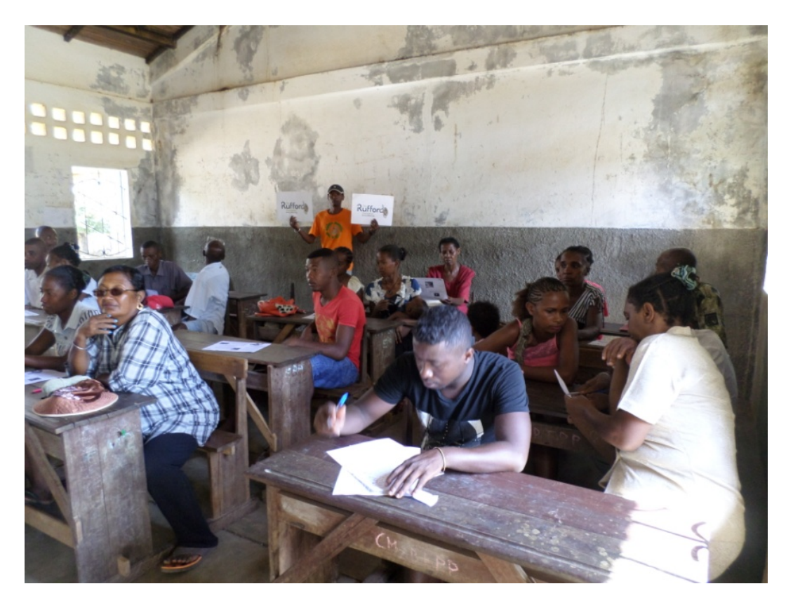
Photo 12 Environmental education training for the primary schools teachers from village of Andilabologno