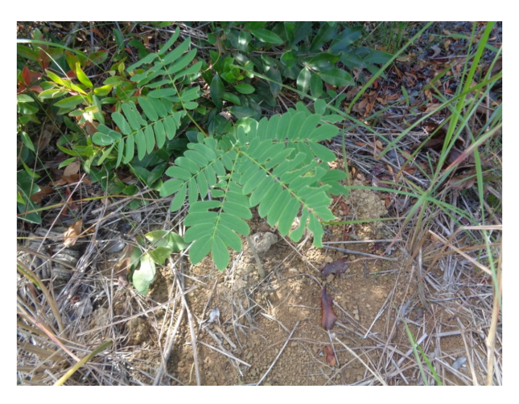
Photo 25 A native tree (Dalbergia sp.) planted at the forest border