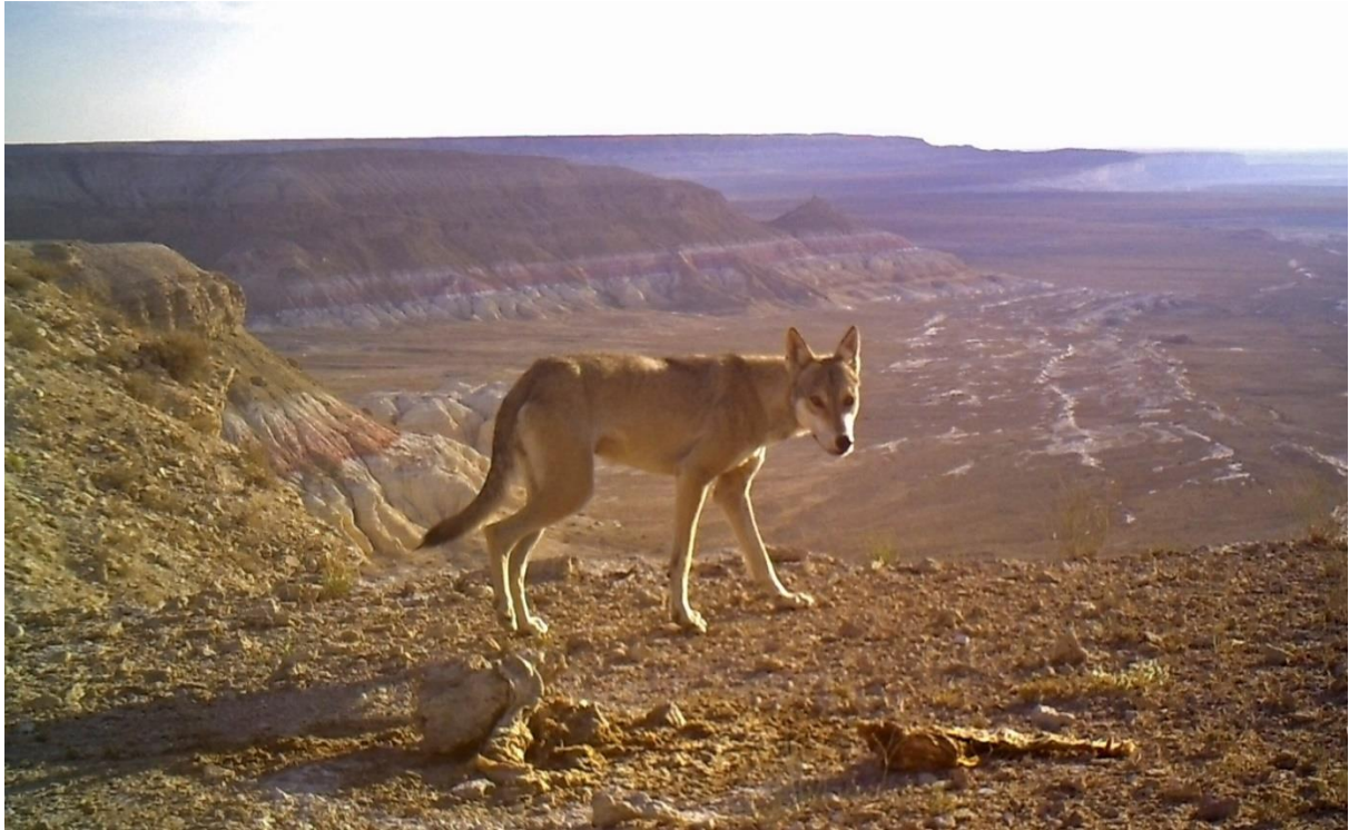
Photo 14. Wolf ( Canis lupus ) on the feeding station № 3 on 25.11.2018. Photo from the camera trap set up by the authors.