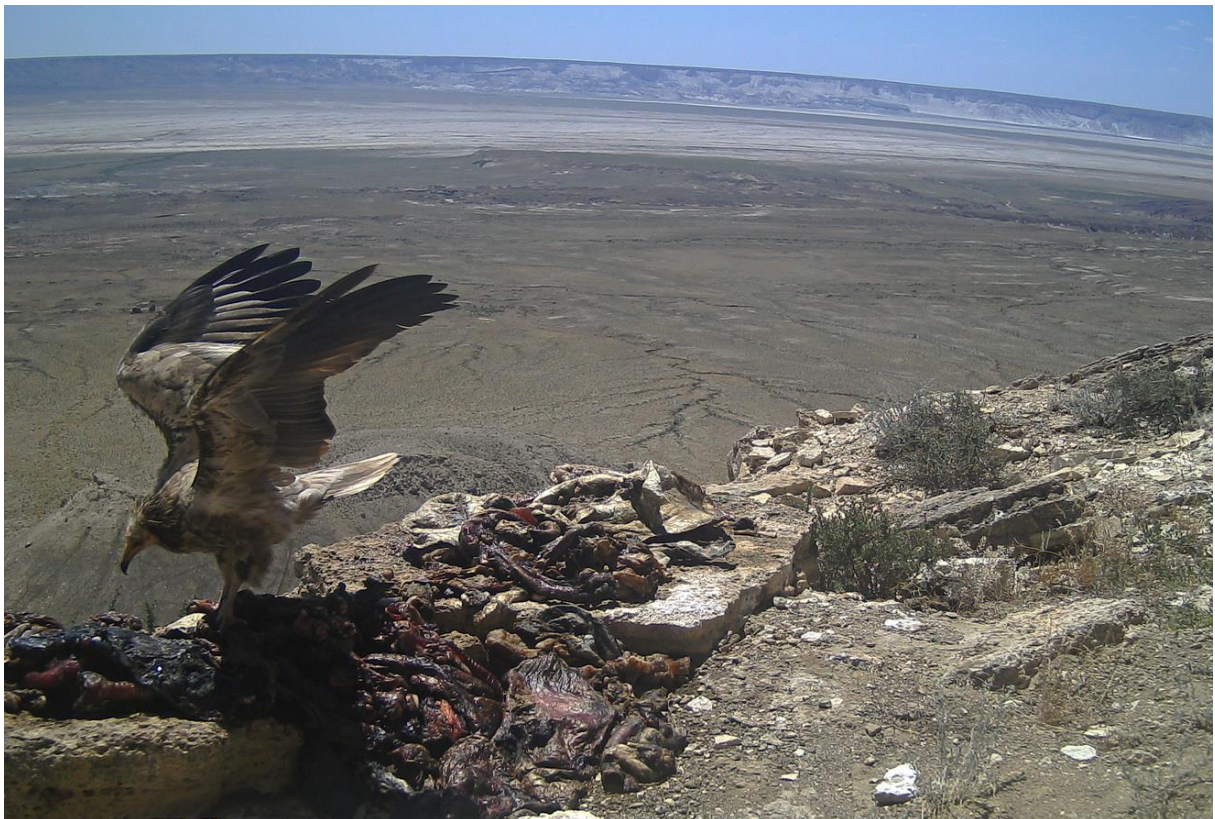
Photo 5. The young vulture at the age of 2-3 years on the feeding-station №1 on 21.05.2018. Photo from the camera trap set up by the authors.