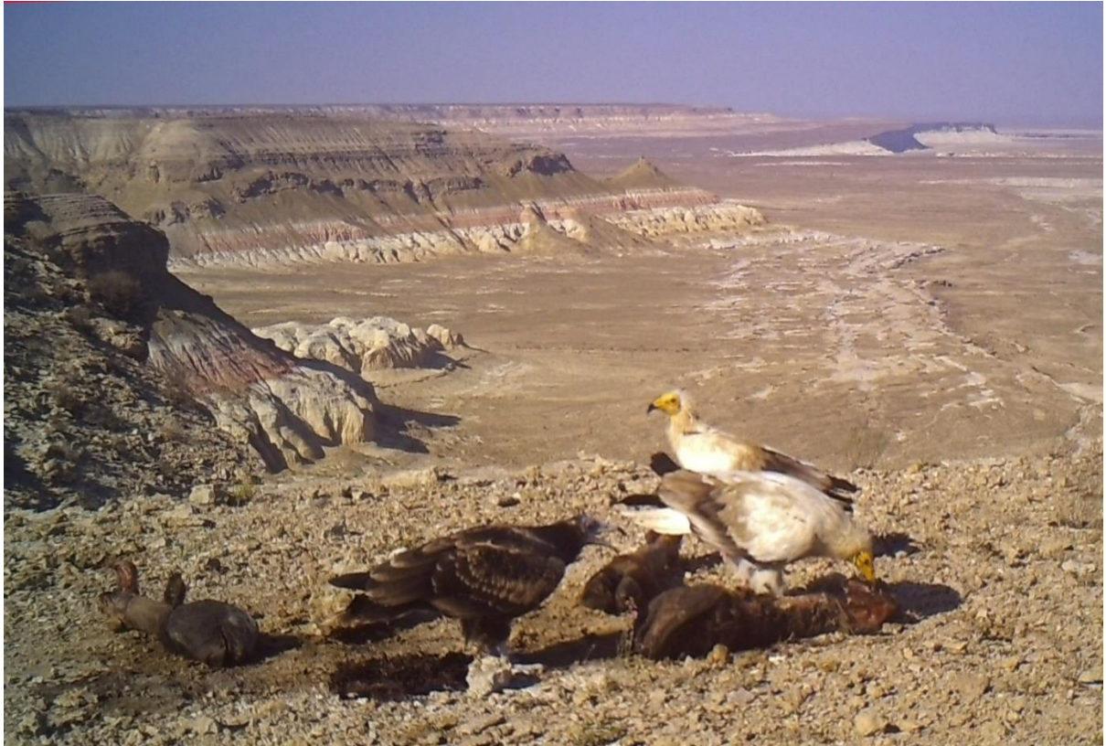
Photo 6. The Egyptian Vultures (a pair of adults and the juvenile) on the feeding-station № 3 on 22.11.2018. Photo from the camera trap set up by the authors.