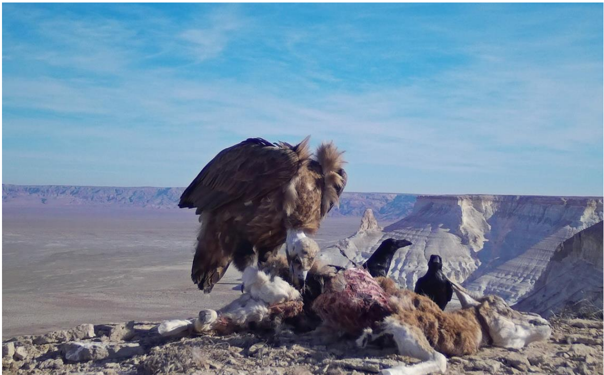
Photo 9. Cinereous Vulture and Ravens ( Corvus corax ) on the remains of the Ustyurt urial outside the stationary feeding station on 16.11.2018. Photo from the camera trap set up by the authors.