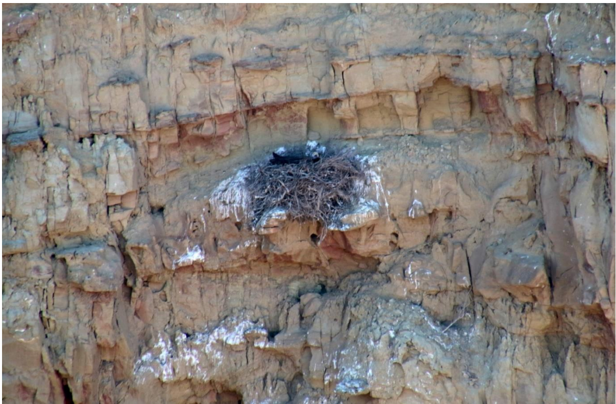
Photo 2. Untypical location of Cinereous Vulture nest in a niche on the top of the cliff in Kokusem area, 08.04.2018.