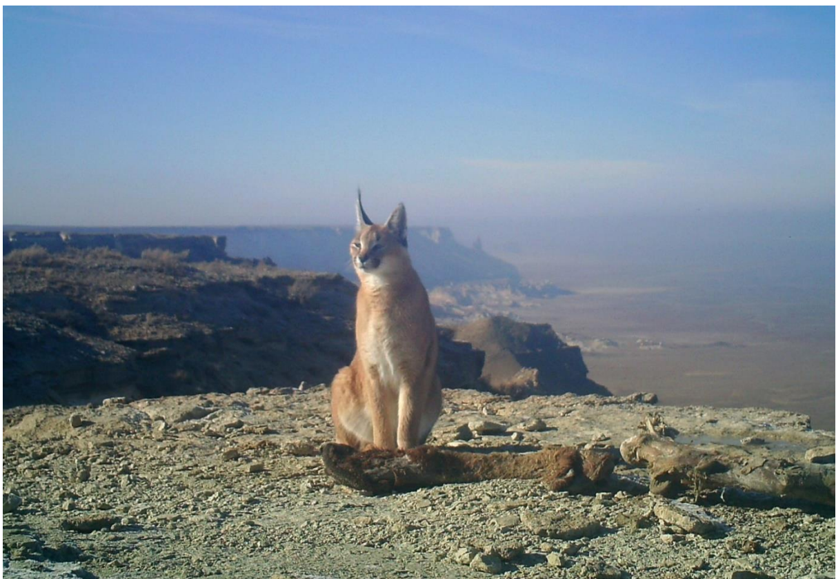
Photo 15. Caracal ( Caracal caracal ) on the feeding station № 2 on 22.11.2018. Photo from the camera trap set up by the authors.