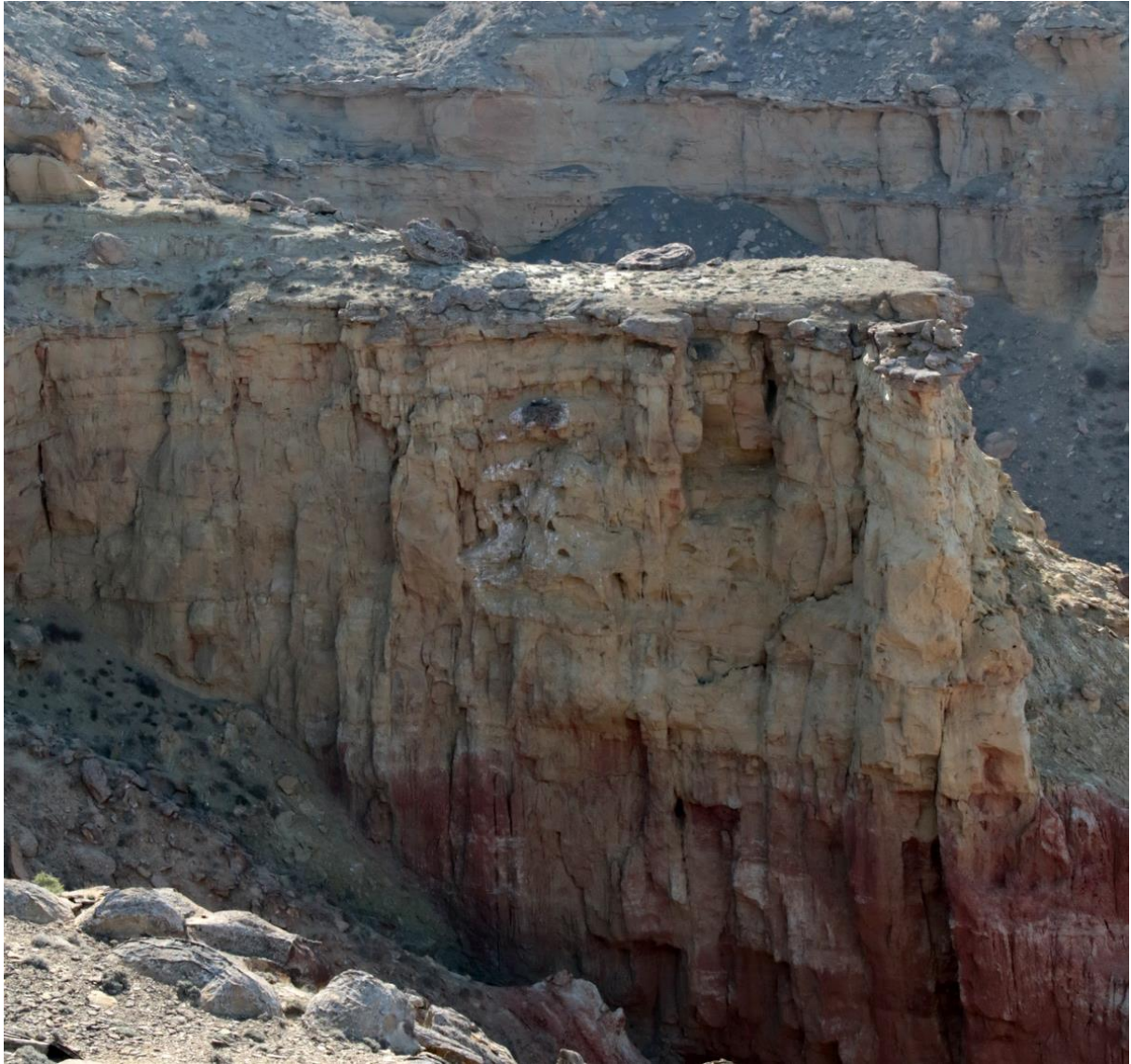
Photo 3. Untypical location of Cinereous Vulture ( Aegypius monachus) nest in a niche on the top of the cliff in Kokusem area, 08.04.2018.