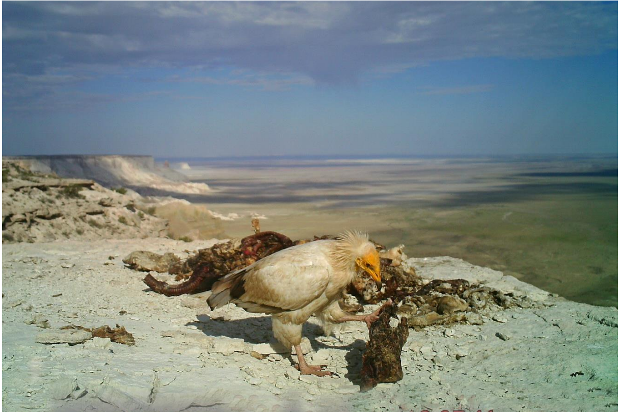
Photo 4. Adult Egyptian Vulture ( Neophron percnopterus ) on the feeding-station № 2 on 11.07.2018. Photo from the camera trap set up by the authors.