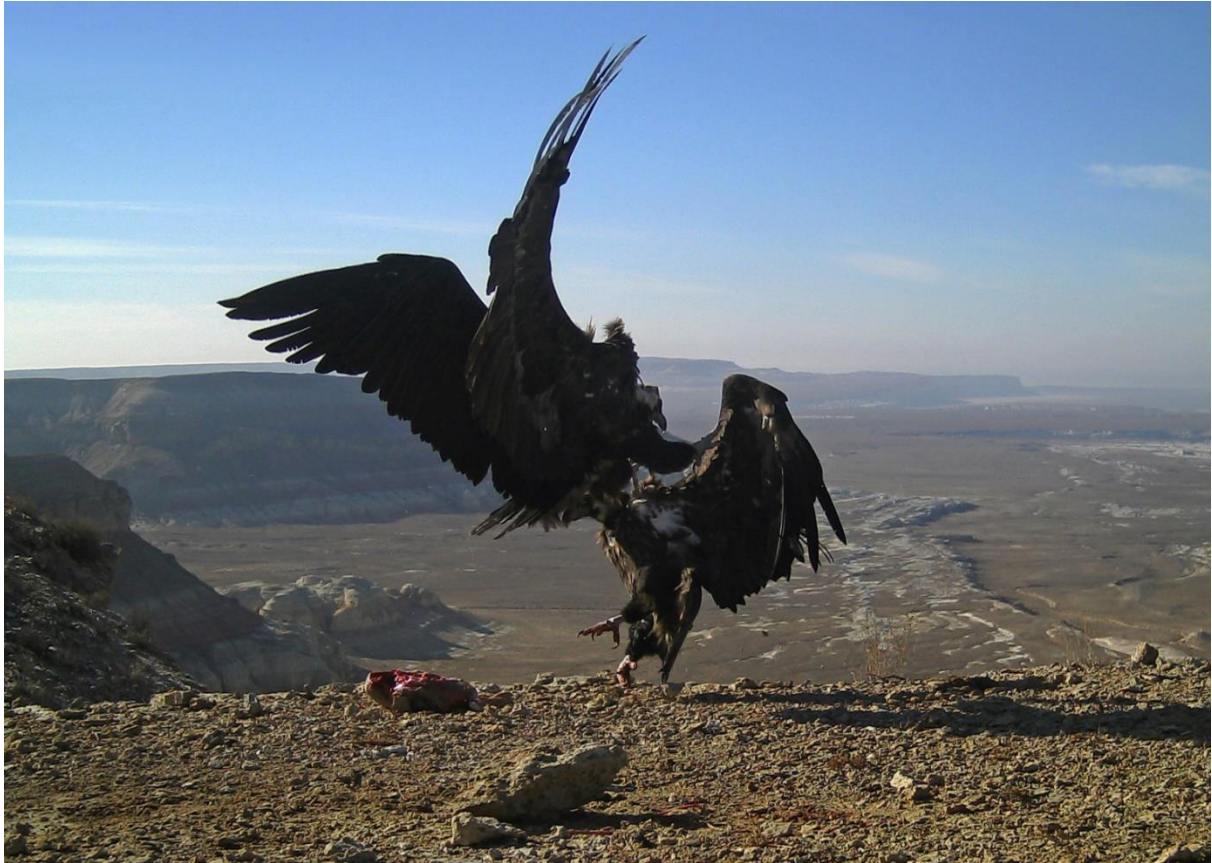
Photo 8. The conflict over pray between two Cinereous Vultures on the feeding station № 3 on 22.11.2018. Photo from the camera trap set up by the authors.