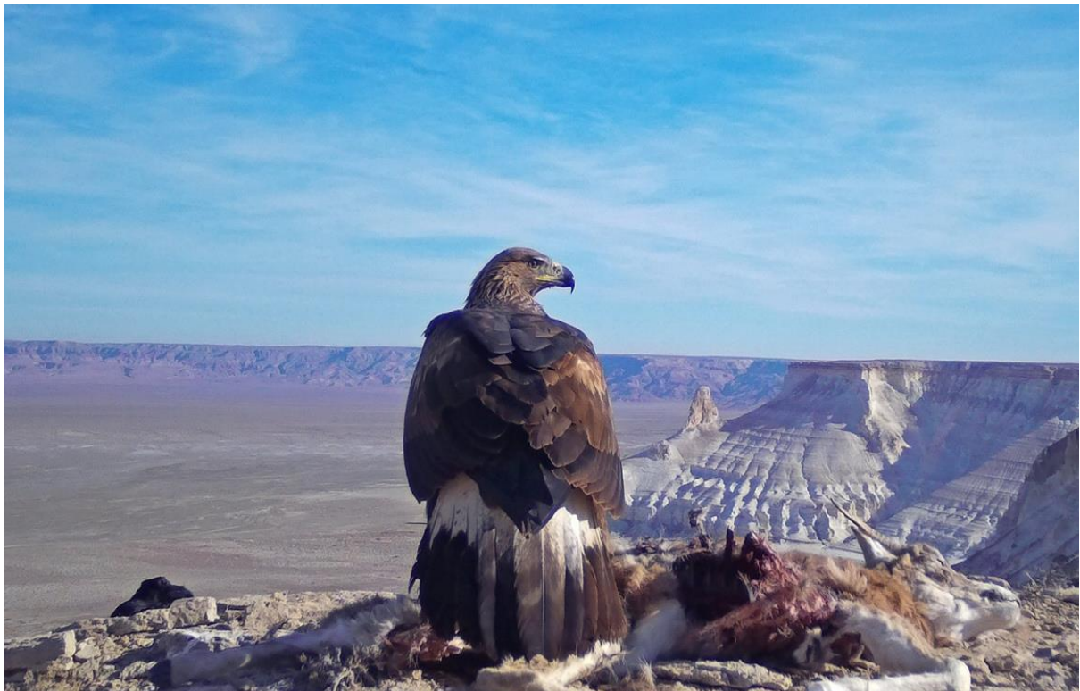
Photo 13. Golden Eagle ( Aquila chrysaetos ) and the Raven on the remains of the Ustyurt urial outside the stationary feeding station on 16.11.2018. Photo from the camera trap set up by the authors.