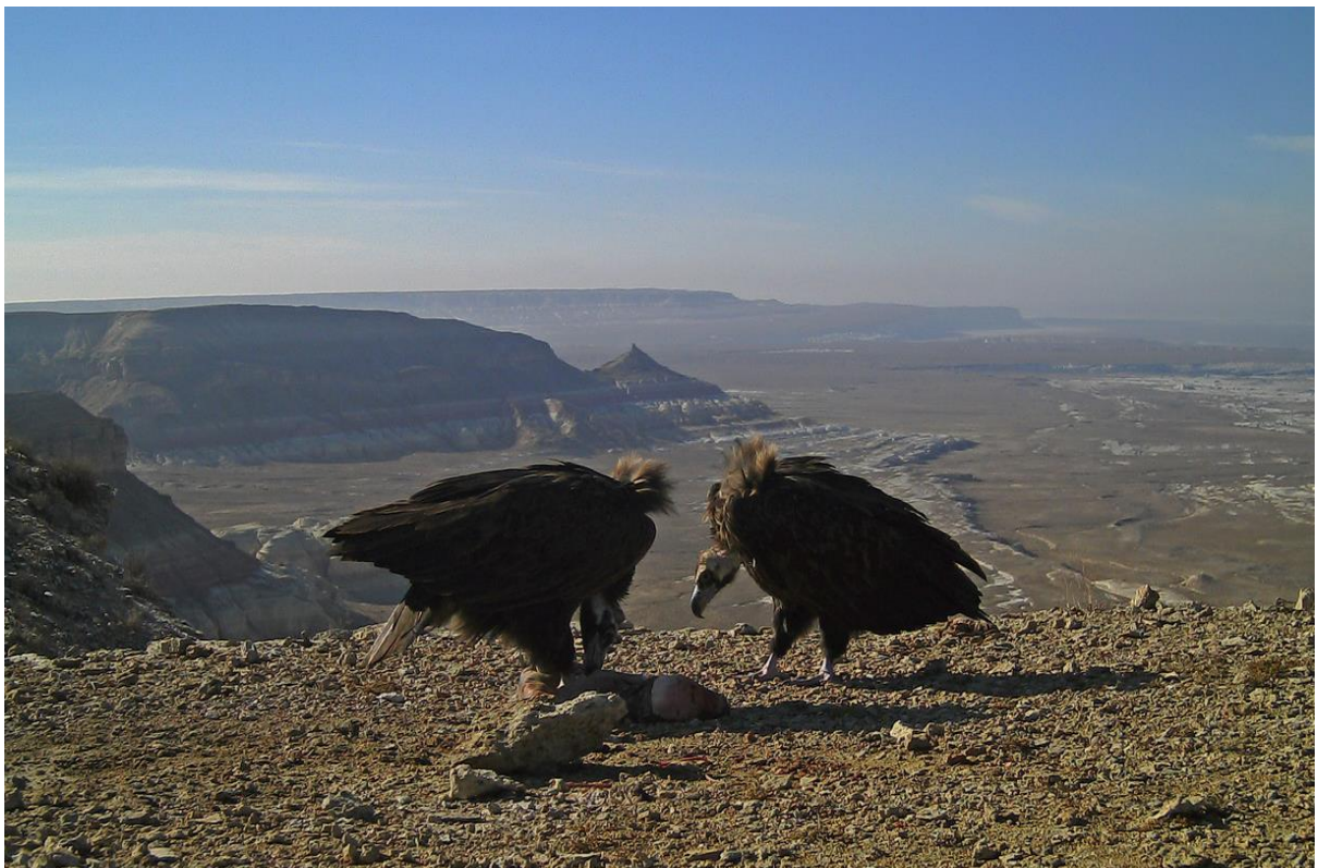
Photo 7. Pair of the Cinereous Vulture on the feeding station №3 on 22.11.2018. Photo from the camera trap set up by the authors.