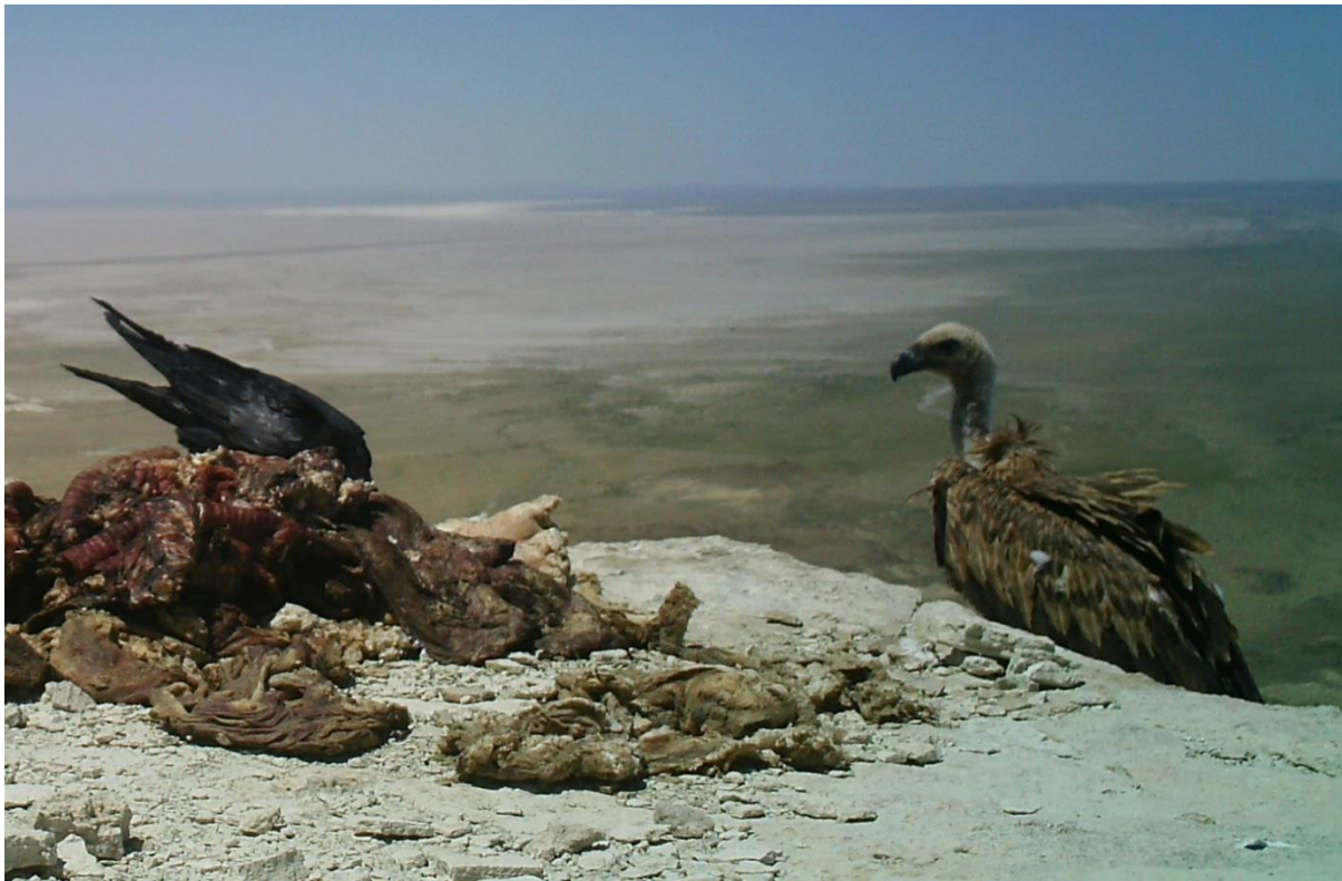
Photo 11. Griffon Vulture and the Raven on the feeding station № 2 on 07.06.2018. Photo from the camera trap set up by the authors.