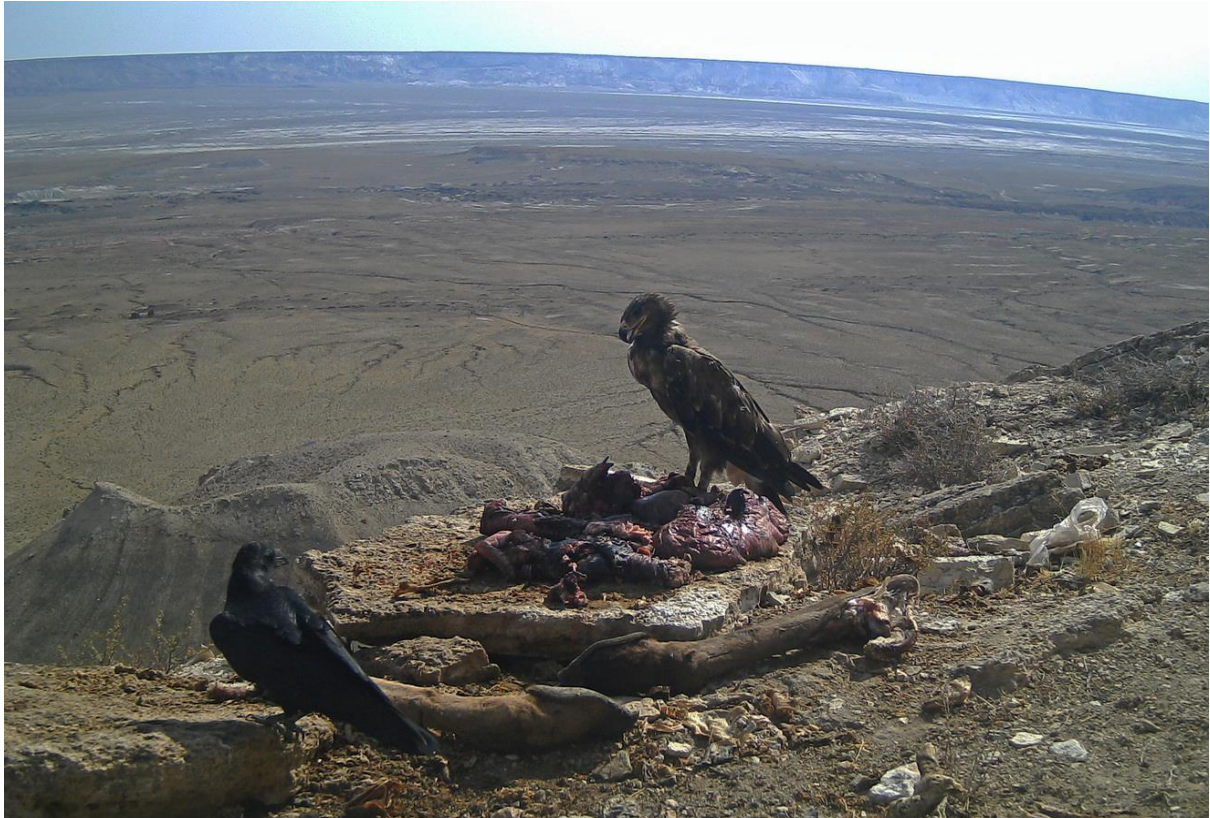
Photo 12. Steppe Eagle ( Aquila nipalensis ) and the Raven on the feeding station № 1 on 07.09.2018 r. Photo from the camera trap set up by the authors.