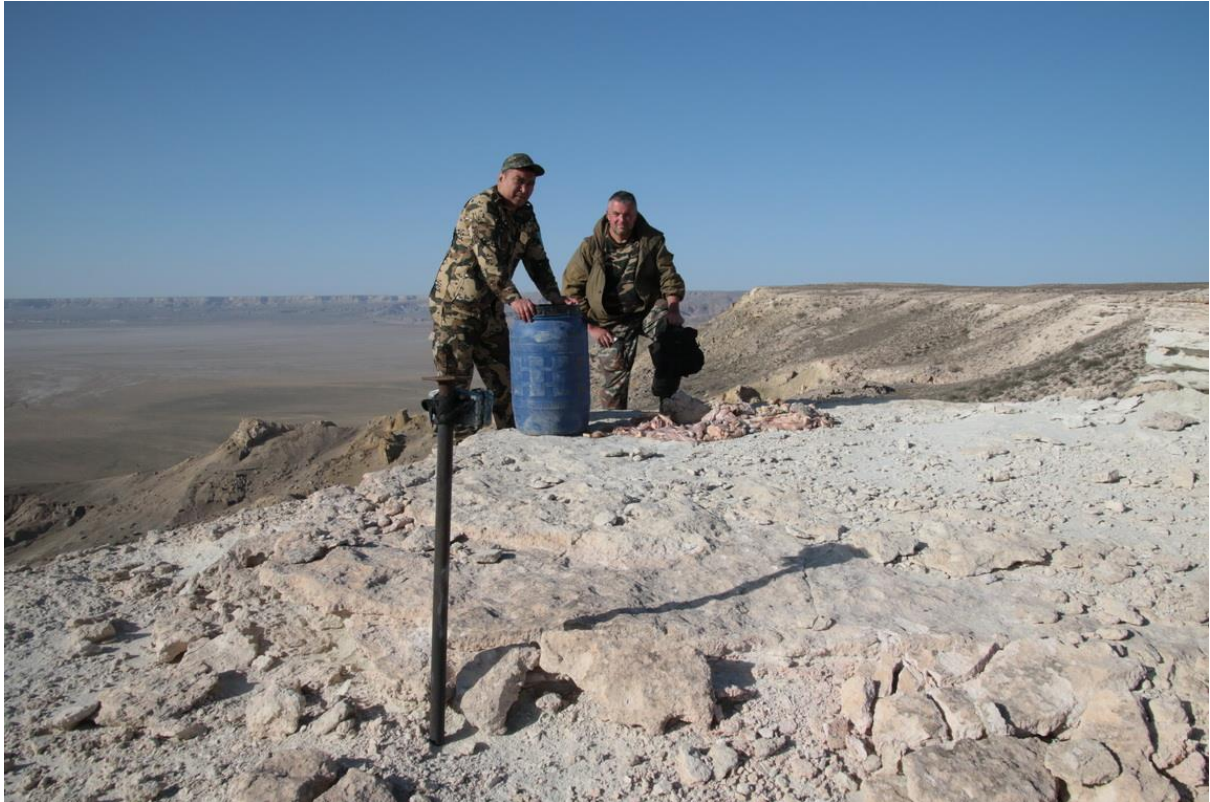
Photo 1. Project participants are setting up a feeding station №1 on 10.04.2018.