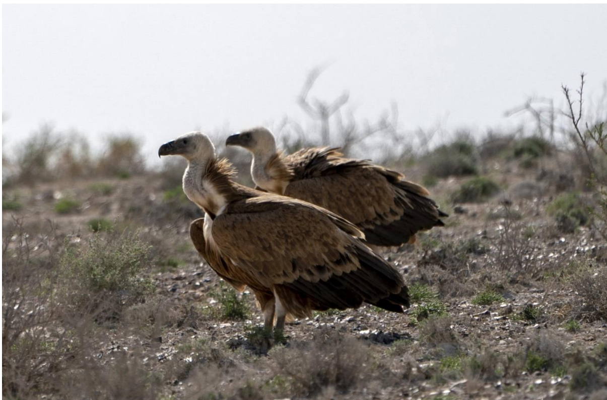
Photo 10. Griffon Vultures ( Gyps fulvus) at Tabanata area in the northern part of the Ustyurt Reserve on 28.04.2018.