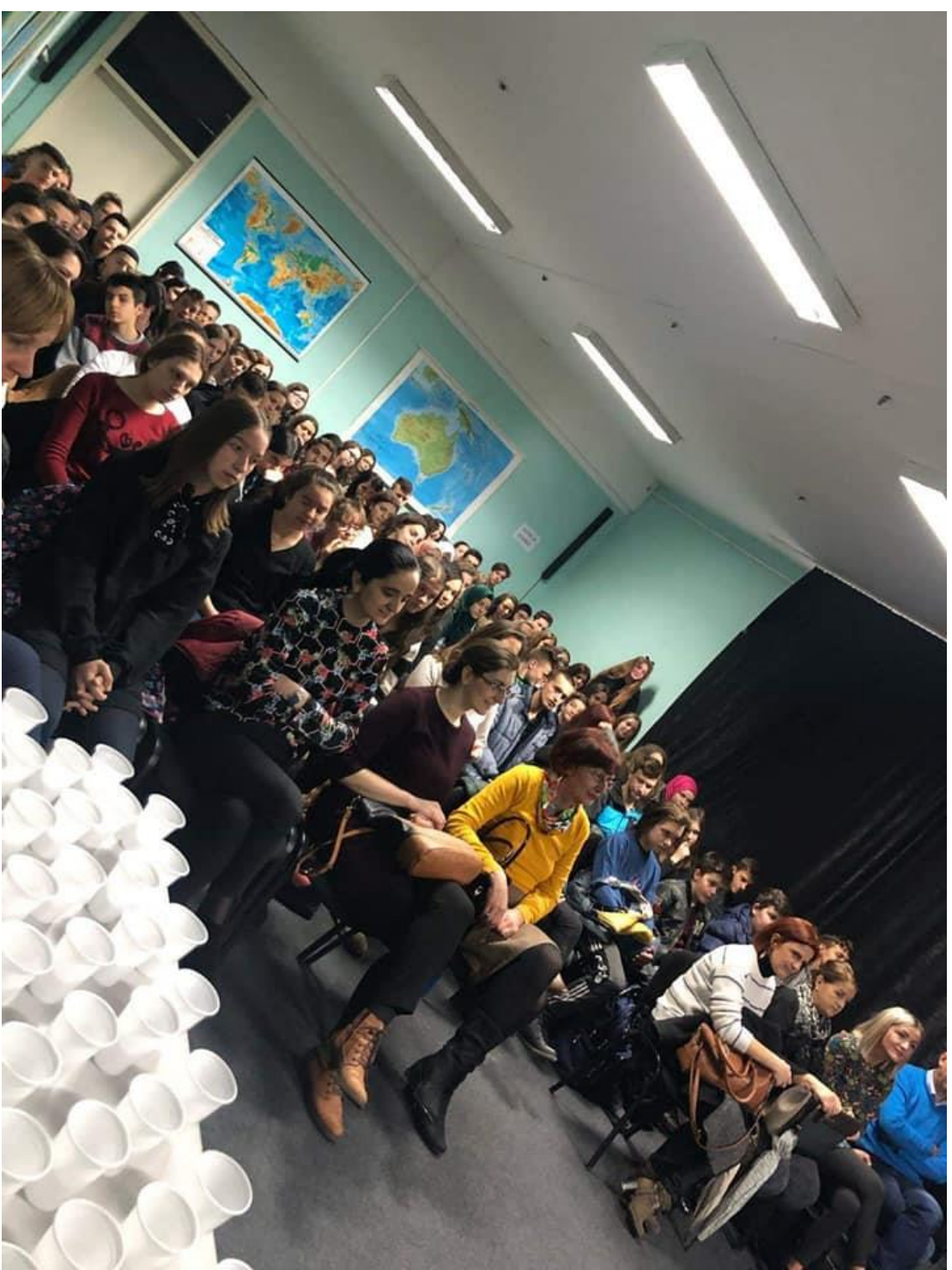
Photo 5: Participants at one of the lectures organized for the high school students and teachers in the SBK/Z, photo: OSDV.