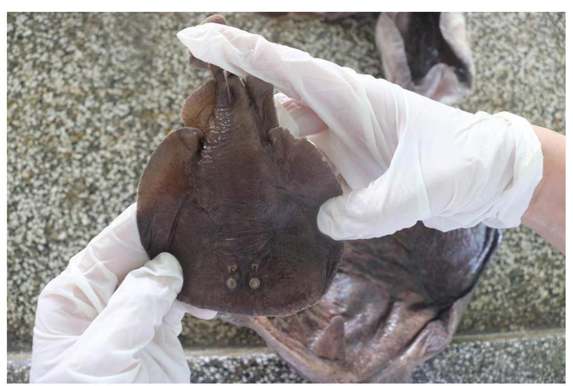
Photo 3: Marbled electric rays collected during the by-catch analysis within the small-scale fisheries in the marine part of Bosni and Herzegovina.