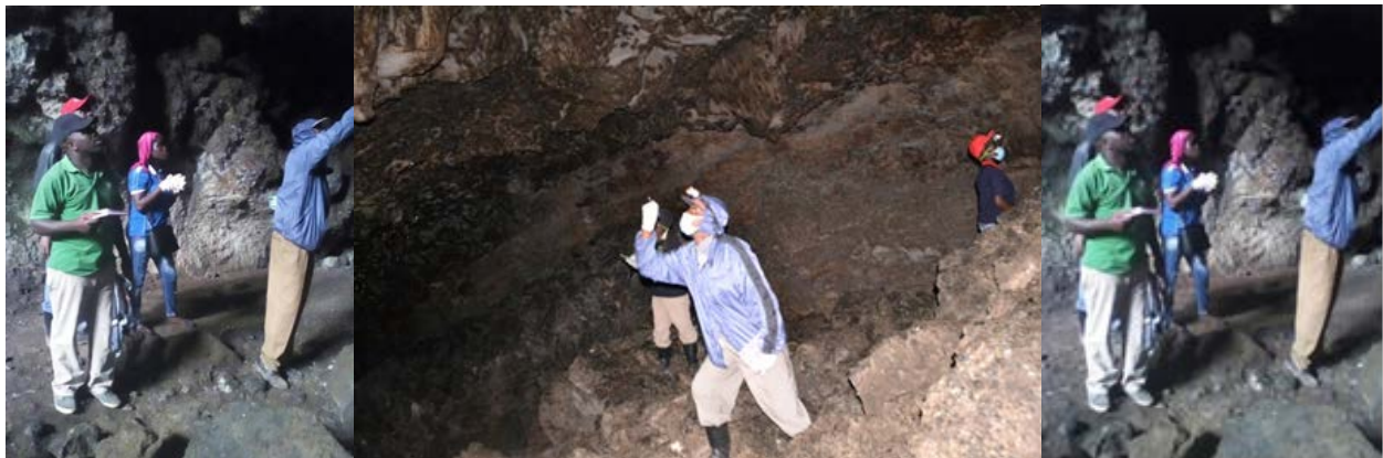
Bats counting trainees being taught how to do population estimates.

The local community was sensitised on bats conservation efforts by the field team. This was done on the end of month community day (umuganda), where the local would be gather to talk about community issues and the team leader talked to the about the important of bats conservation in the caves. Main points of discussion were importance of bats, efforts on conserving them, any challenges on bats conservation and how best to tackle them. These sensitisation meeting are organised in partnership with the local leaders.