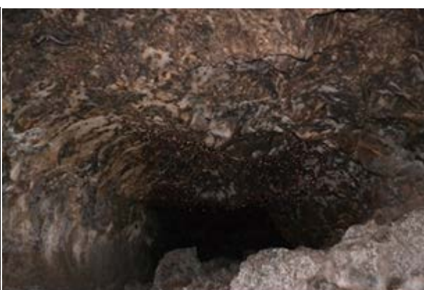
Musanze Caves entrance and roosting site.