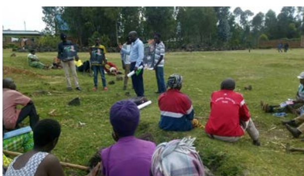
Part of the local community members attending one of the community sensitizations about bat conservation by the bat conservation field staff.