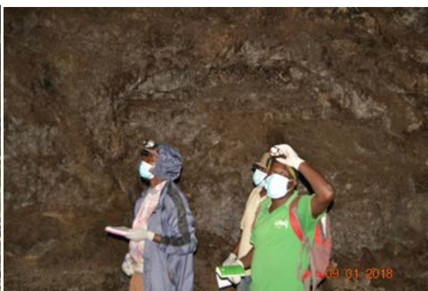
Left: Bat counting team getting ready for another bats counting phase. Right: Another phase of bats counting.