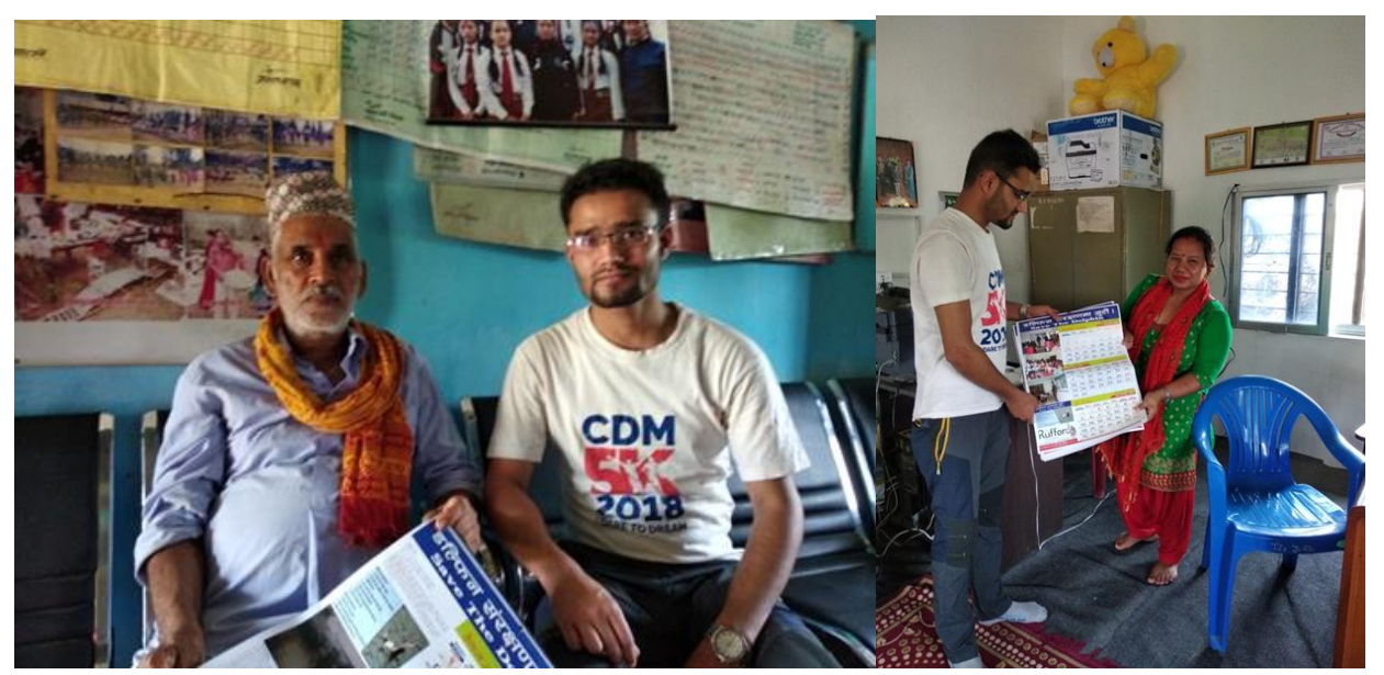
Left: Distribution to social worker. Right: Distribution to secretary of Tribeni buffer zone office.