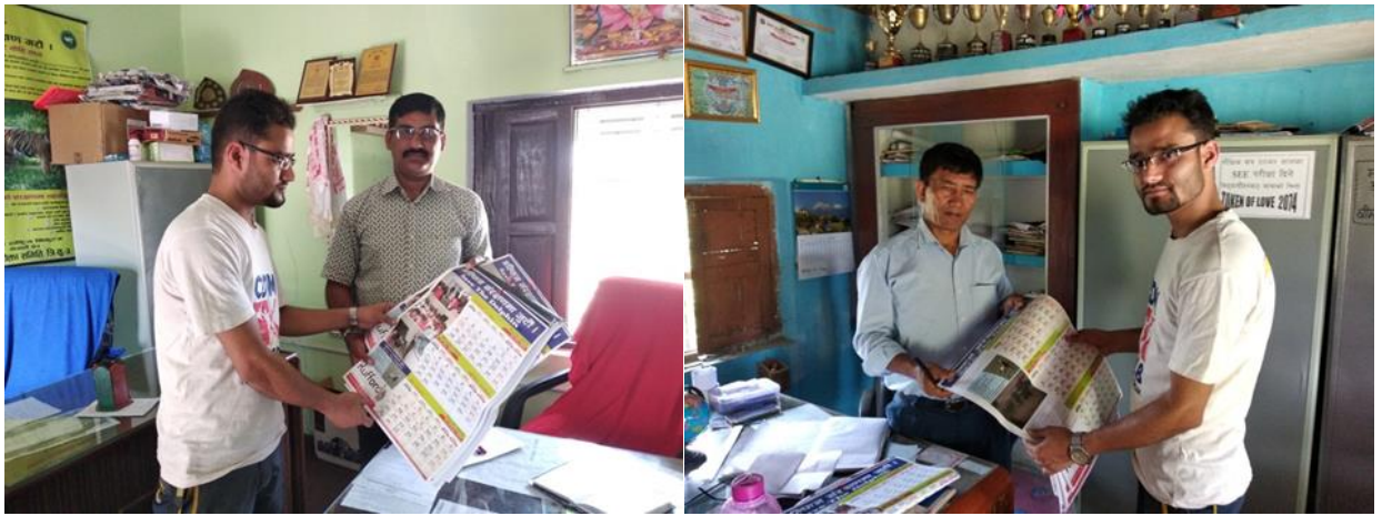
Distribution to Principals (left: Narayani Gandaki Secondary School. Right: Shivapurgadhi Secondary School).